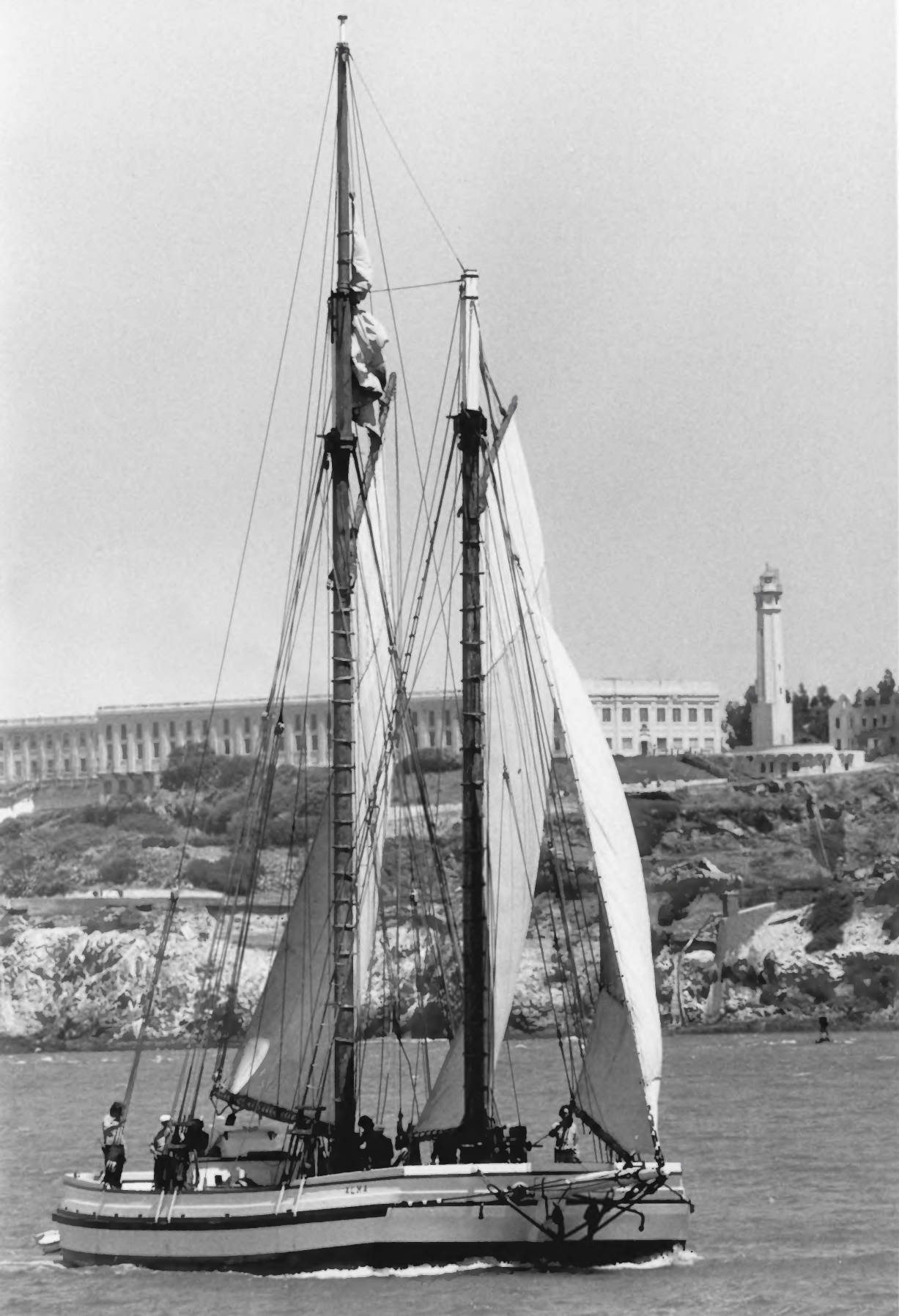
Golden Gate NRA - U.S. Department of the Interior, National Park Service