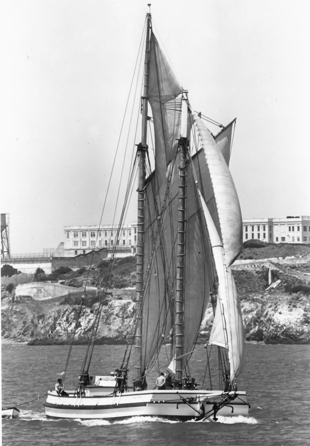
Golden Gate NRA - U.S. Department of the Interior, National Park Service