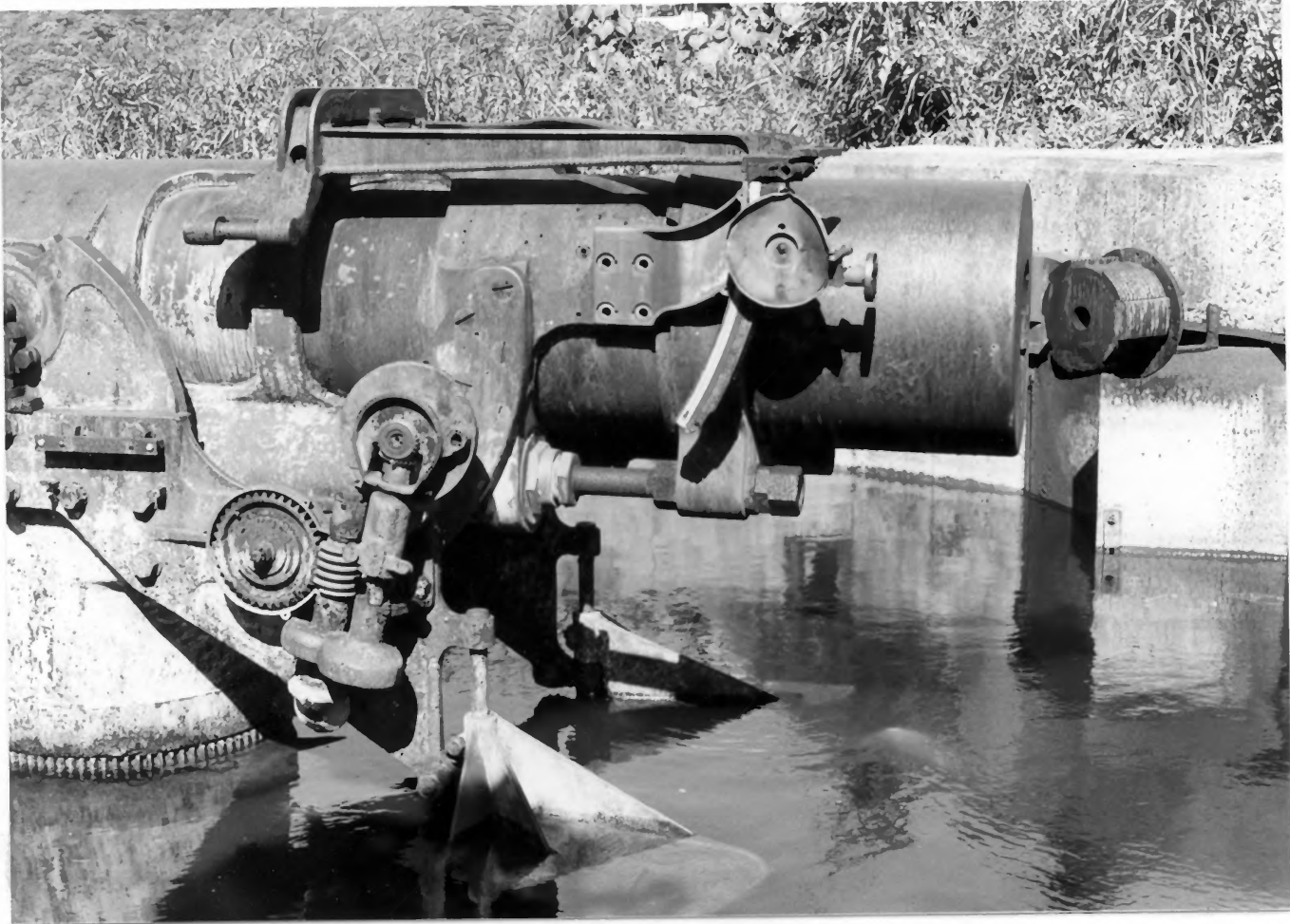
A 6-inch naval gun, Blunts Point, American Samoa. The water in the pit is full of toads.