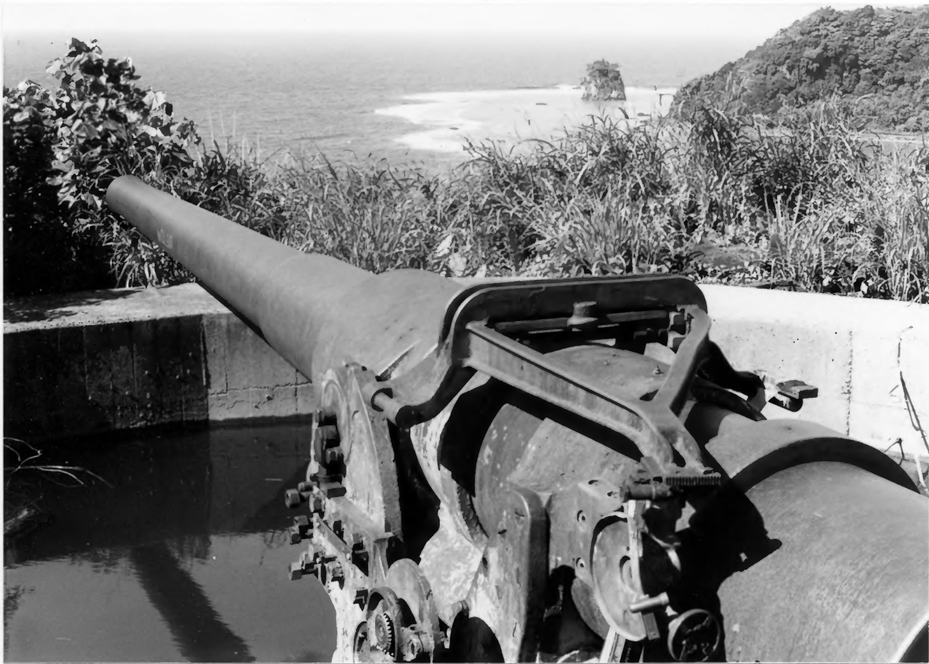
A 6-inch naval gun at Blunts Point battery, American Samoa. One has grand views of lower Pago Pago harbor and the South Pacific from this point.