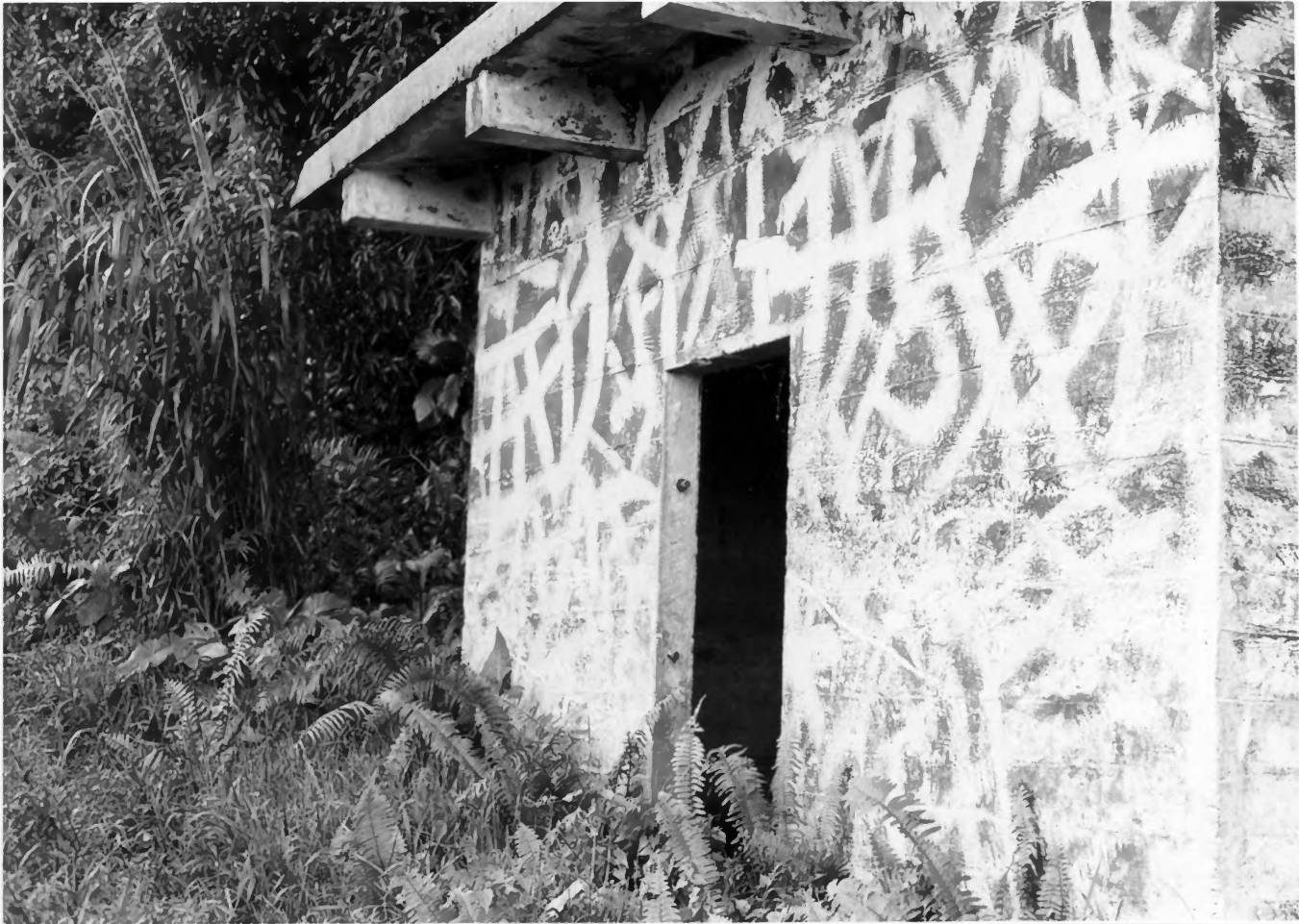
Ammunition magazine for 6-inch naval gun battery, Blunts Point, American Samoa.