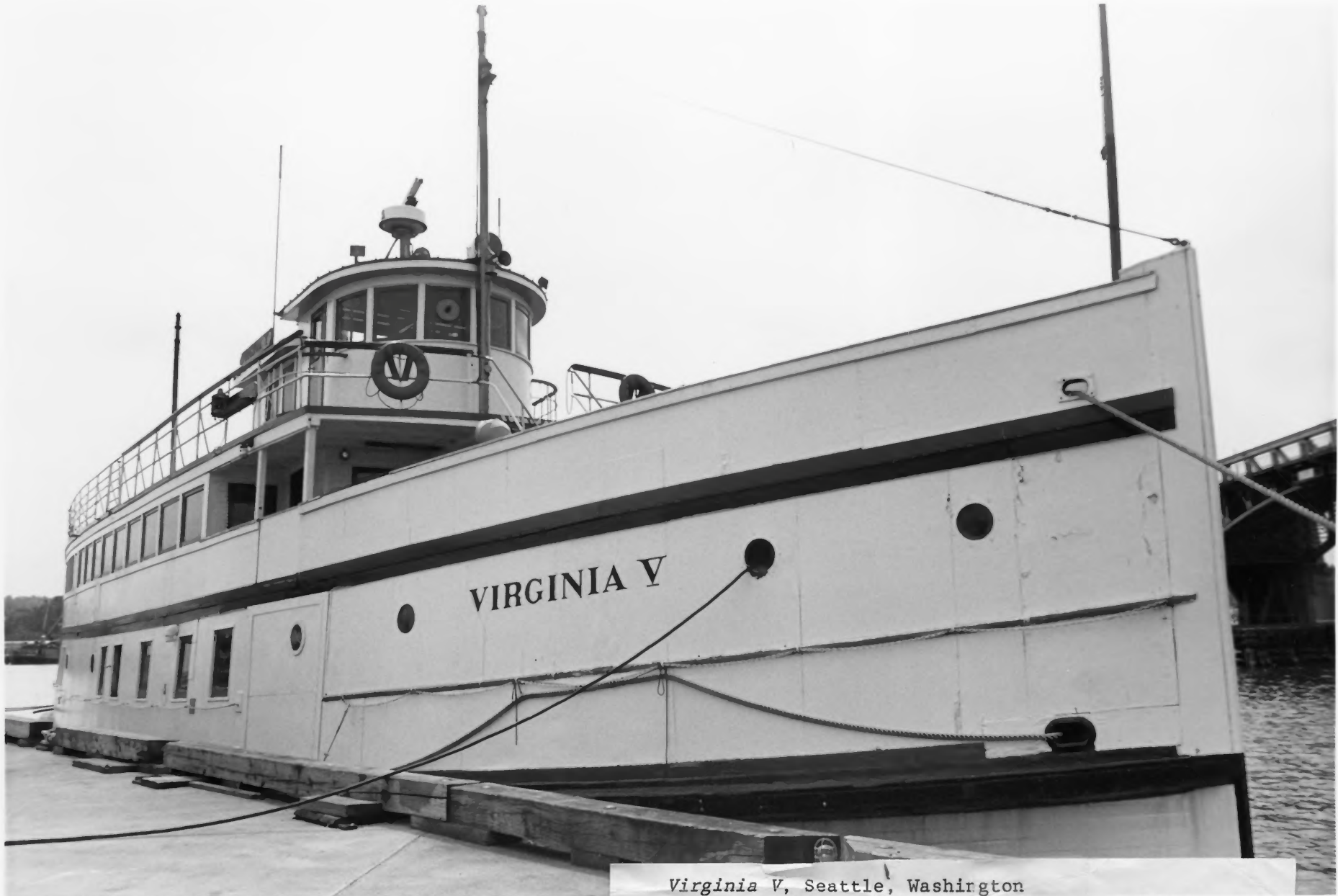
Virginia V , Seattle, Washington At her berth on Lake Union, 1991 Photo No. 1