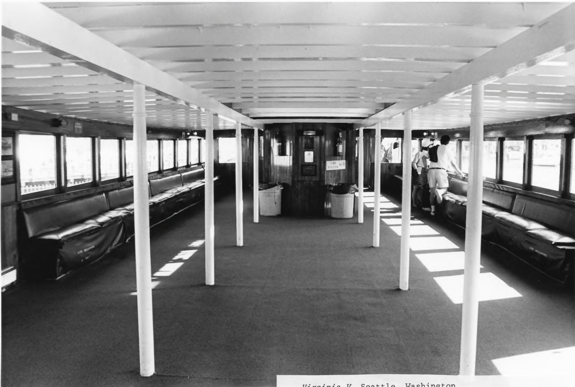
Virginia V , Seattle, Washington Passenger cabin, 1991 Photo No. 3