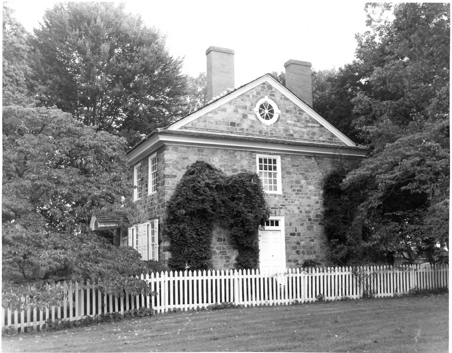
Washington's Headquarters (Potts House), Valley Forge, Pennsylvania