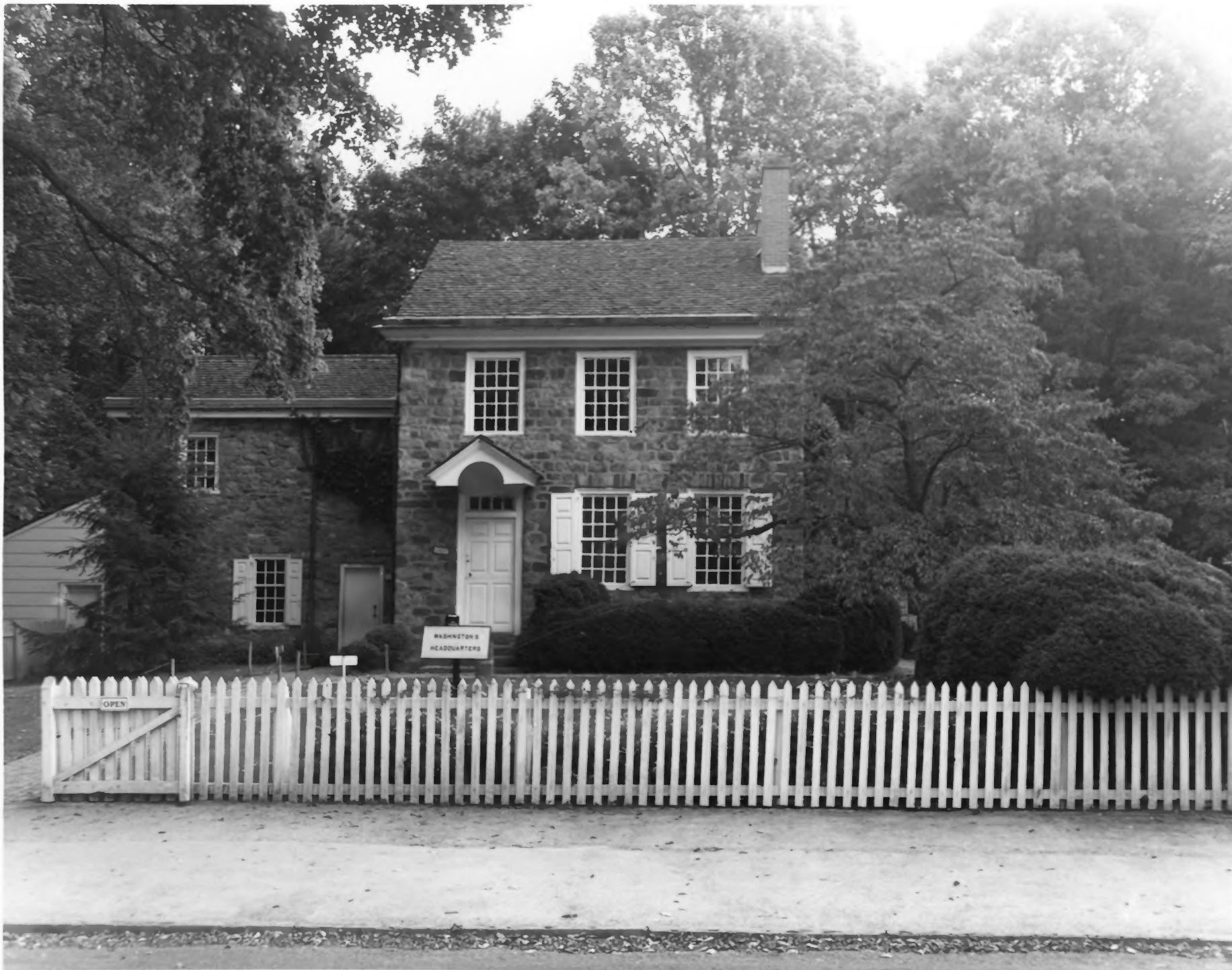
Washington's Headquarters (Potts House), Valley Forge, Pennsylvania