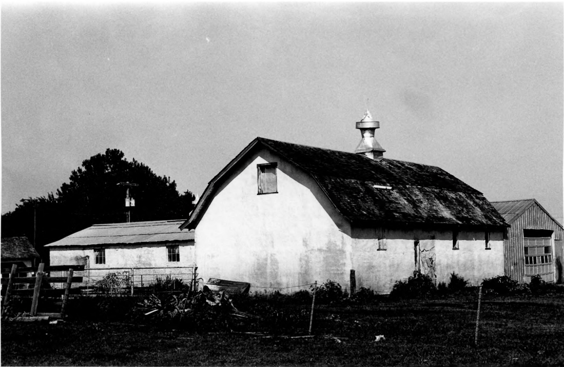
101 Ranch Historic District (Horse Barn), Marland, Oklahoma