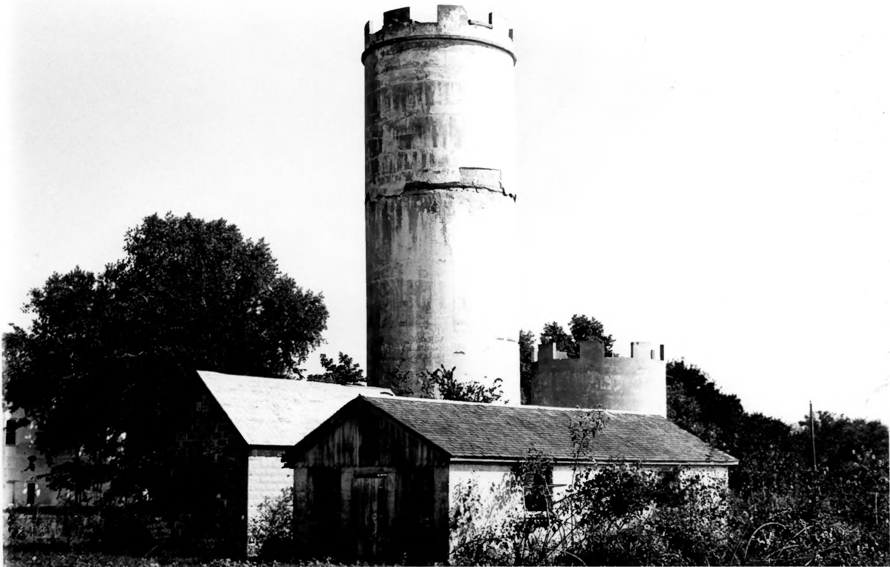
101 Ranch Historic District (Silos, Granery and Milk Storage), Marland, Oklahoma