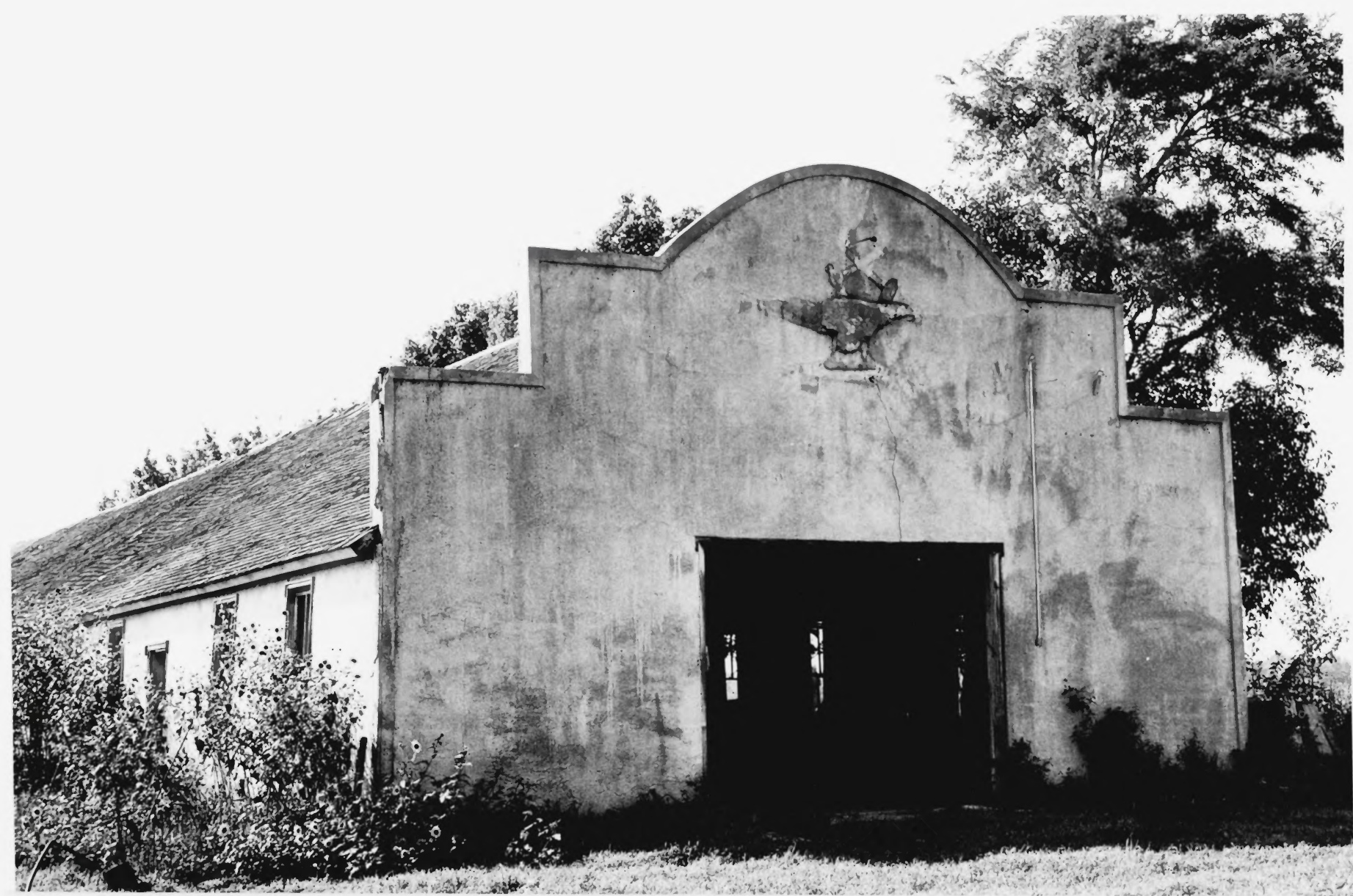
101 Ranch Historic District (Blacksmith Shop), Marland, Oklahoma