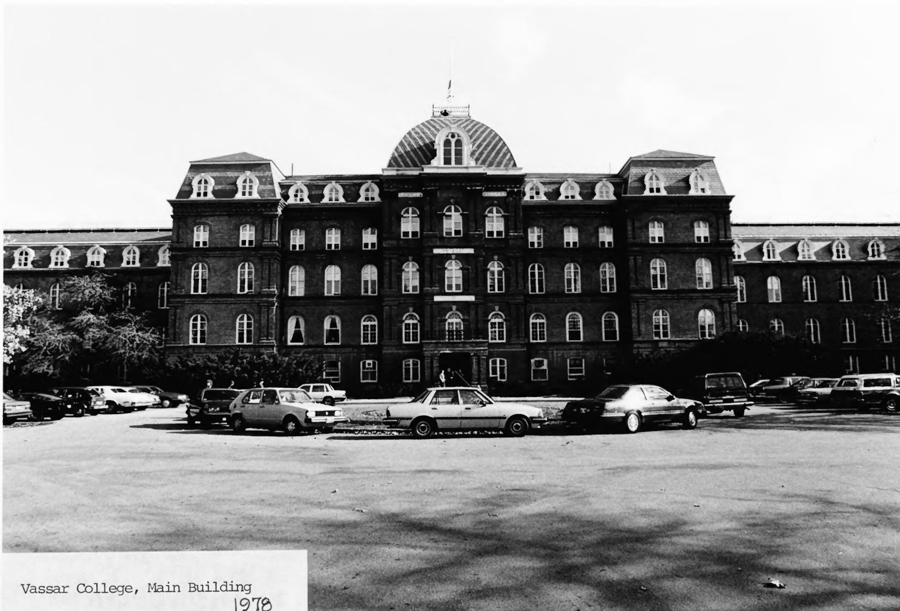
Vassar College, Main Building