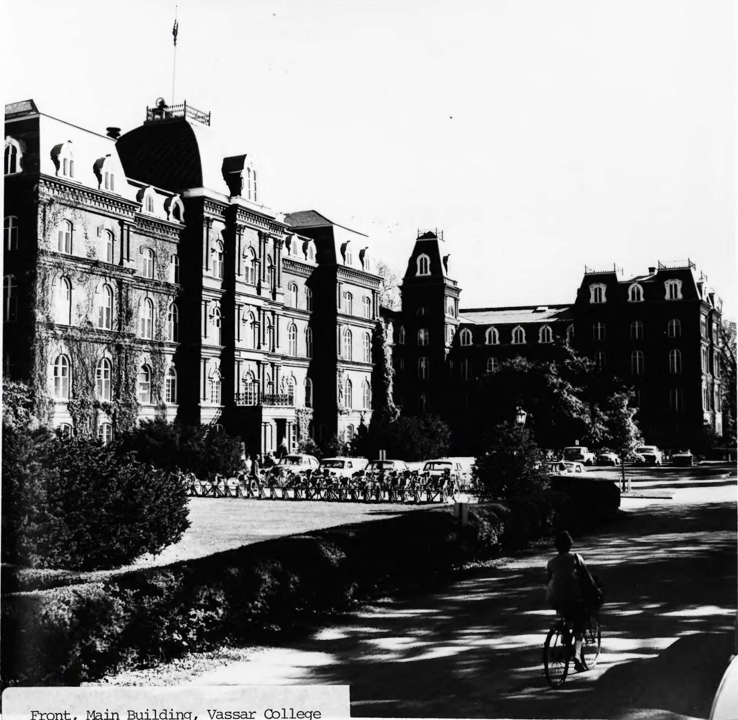
Front, Main Building, Vassar College