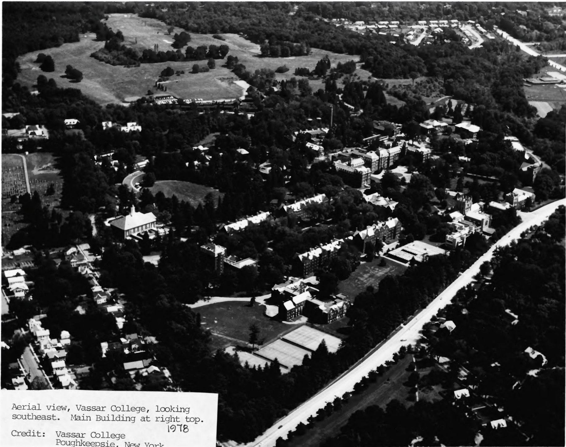
Aerial view, Vassar College, looking southeast. Main Building at right top.

1978