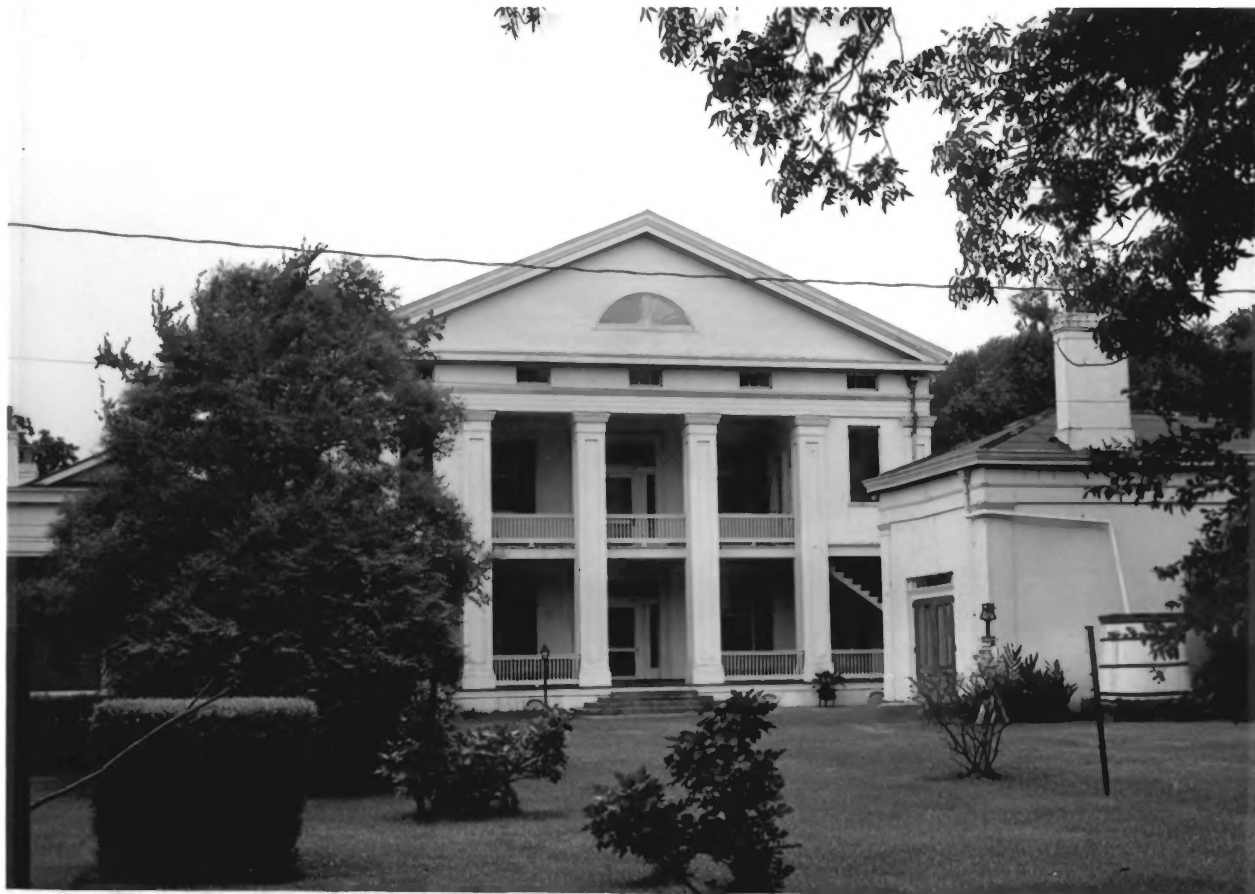
Rear (northeast) elevation of Main house; kitchen at right -- 1973