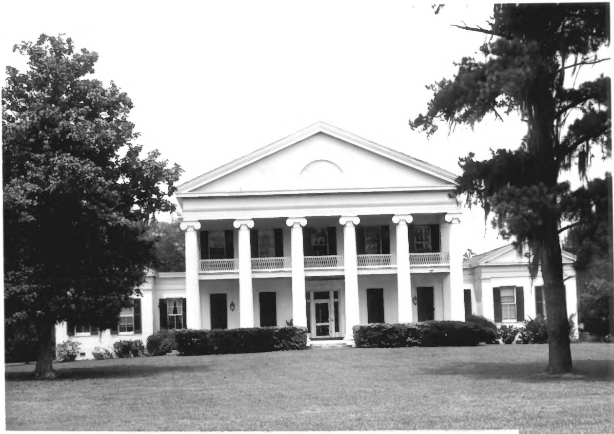
Front (southwest) elevation of Main house -- 1973