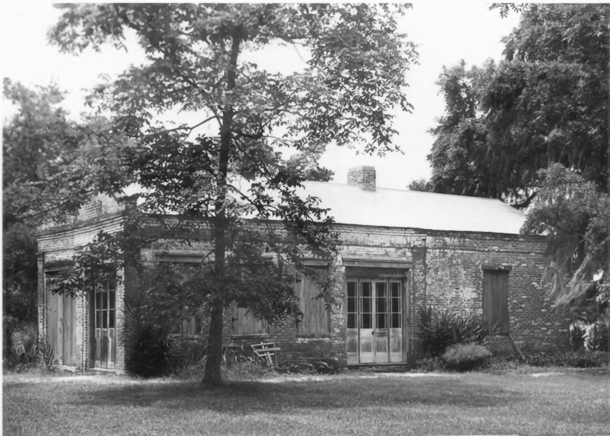
Carriage house (before restoration) -- 1973.