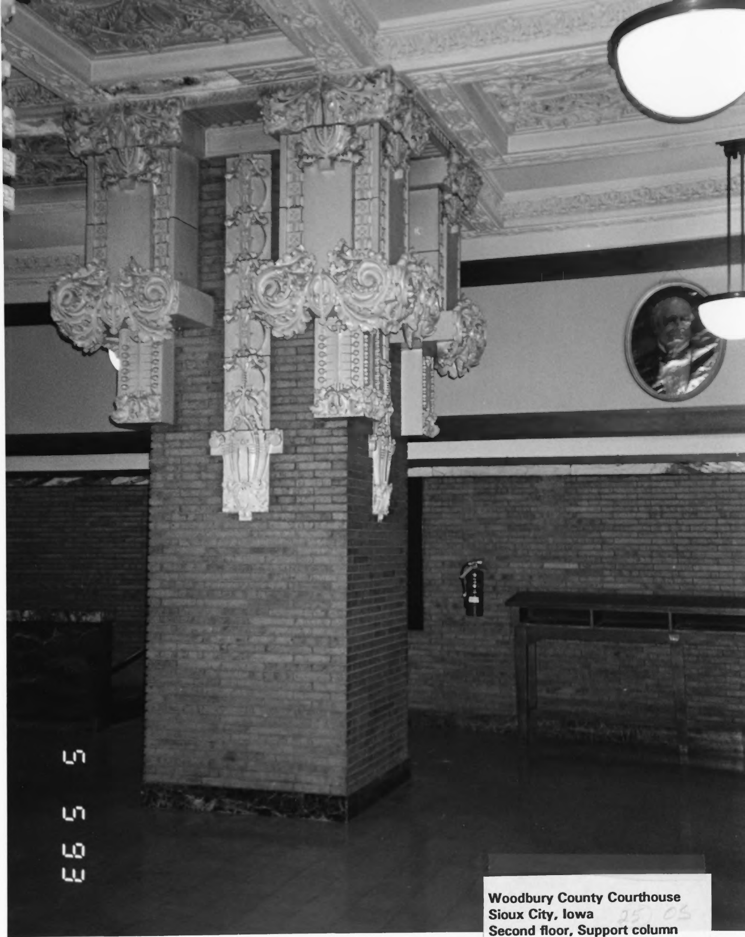
Woodbury County Courthouse Sioux City, Iowa 25/03 Second floor, Support column Photo: Courthouse archive, 1993