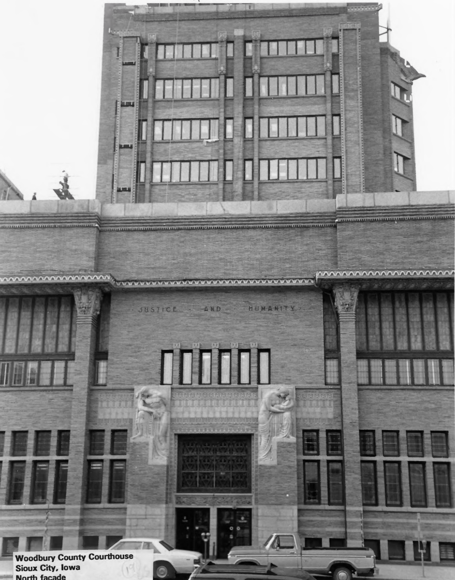
Woodbury County Courthouse Sioux City, Iowa North facade