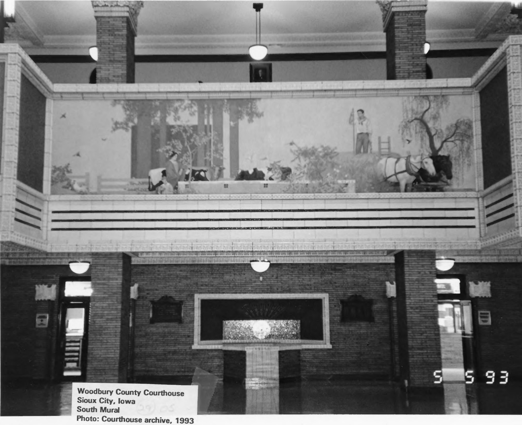
Woodbury County Courthouse Sioux City, Iowa South Mural Photo: Courthouse archive, 1993