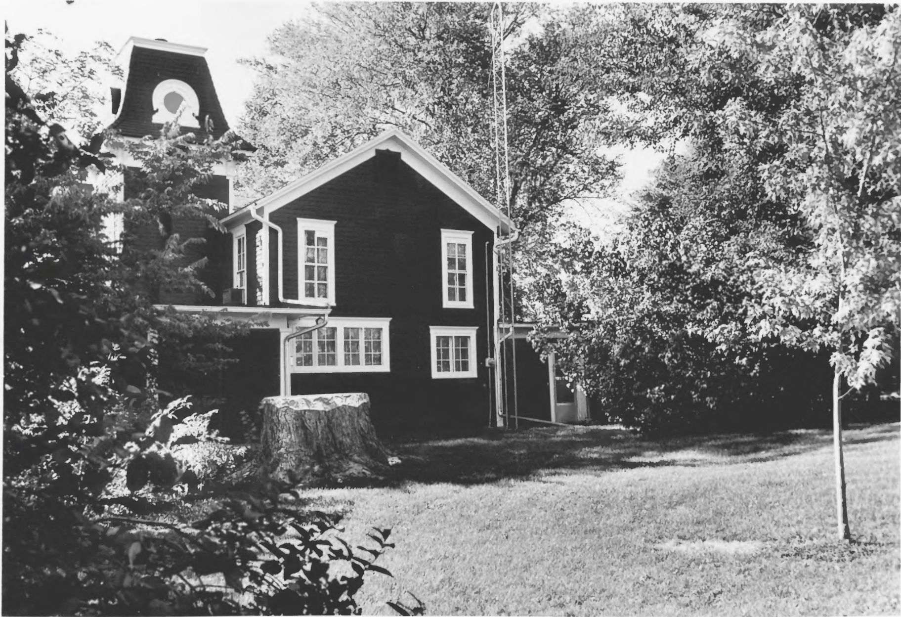
William Peters Hepburn House