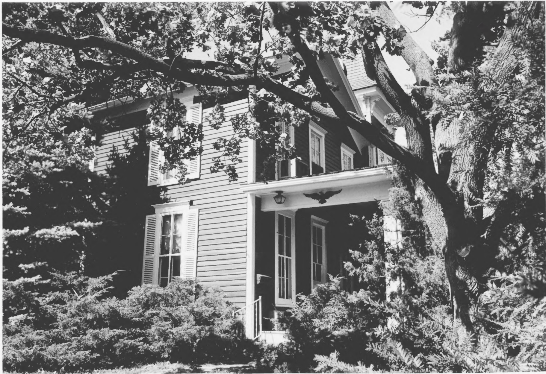
William Peters Hepburn House