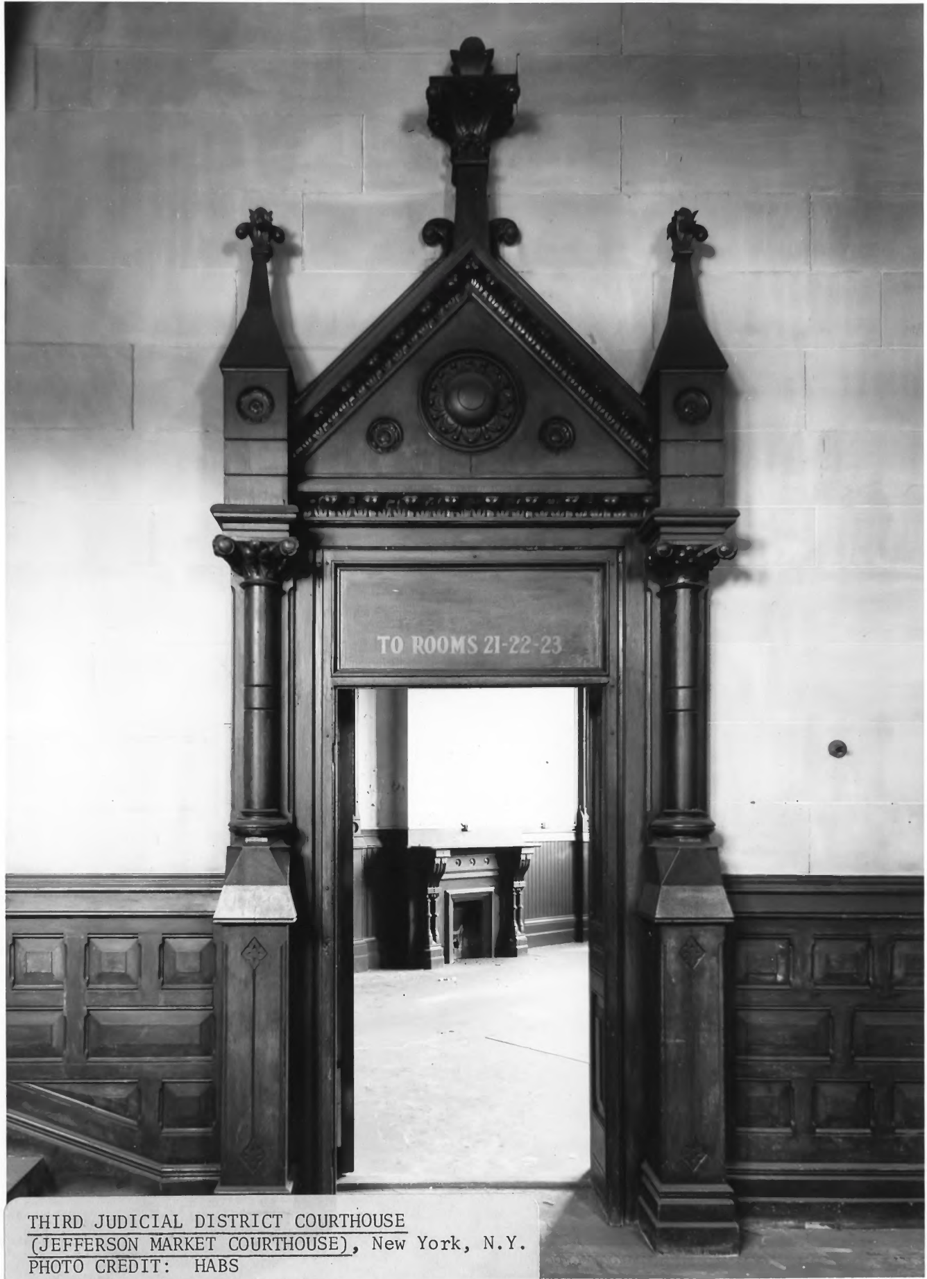
THIRD JUDICIAL DISTRICT COURTHOUSE (JEFFERSON MARKET COURTHOUSE), New York, N.Y.