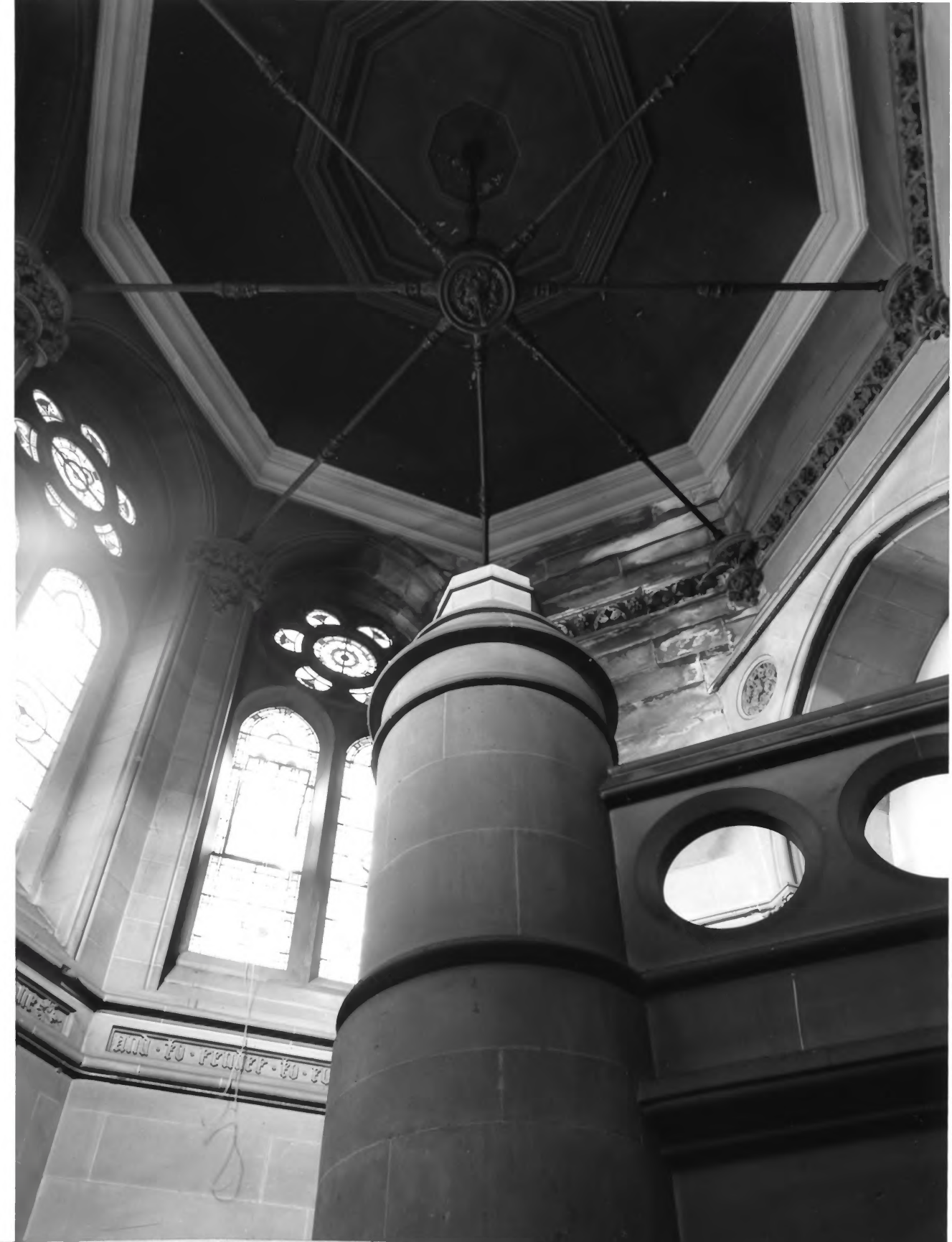
THIRD JUDICIAL DISTRICT COURTHOUSE (JEFFERSON MARKET COURTHOUSE), New York, N.Y. DESCRIPTION: View of rotunda.