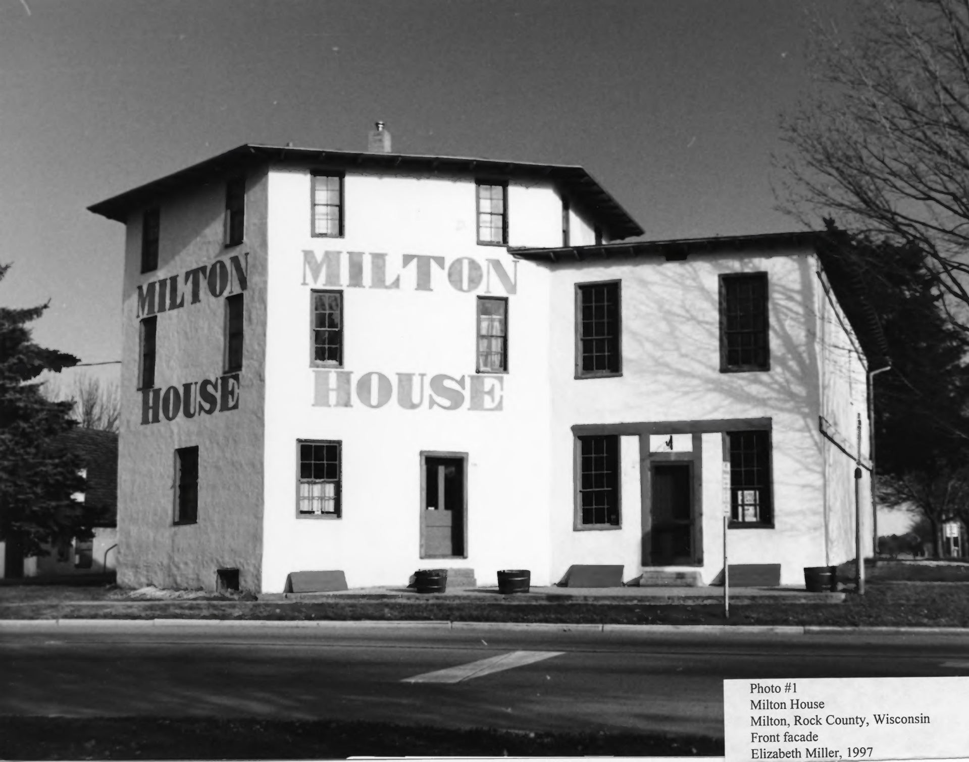
Photo #1 Milton House Milton, Rock County, Wisconsin Front facade