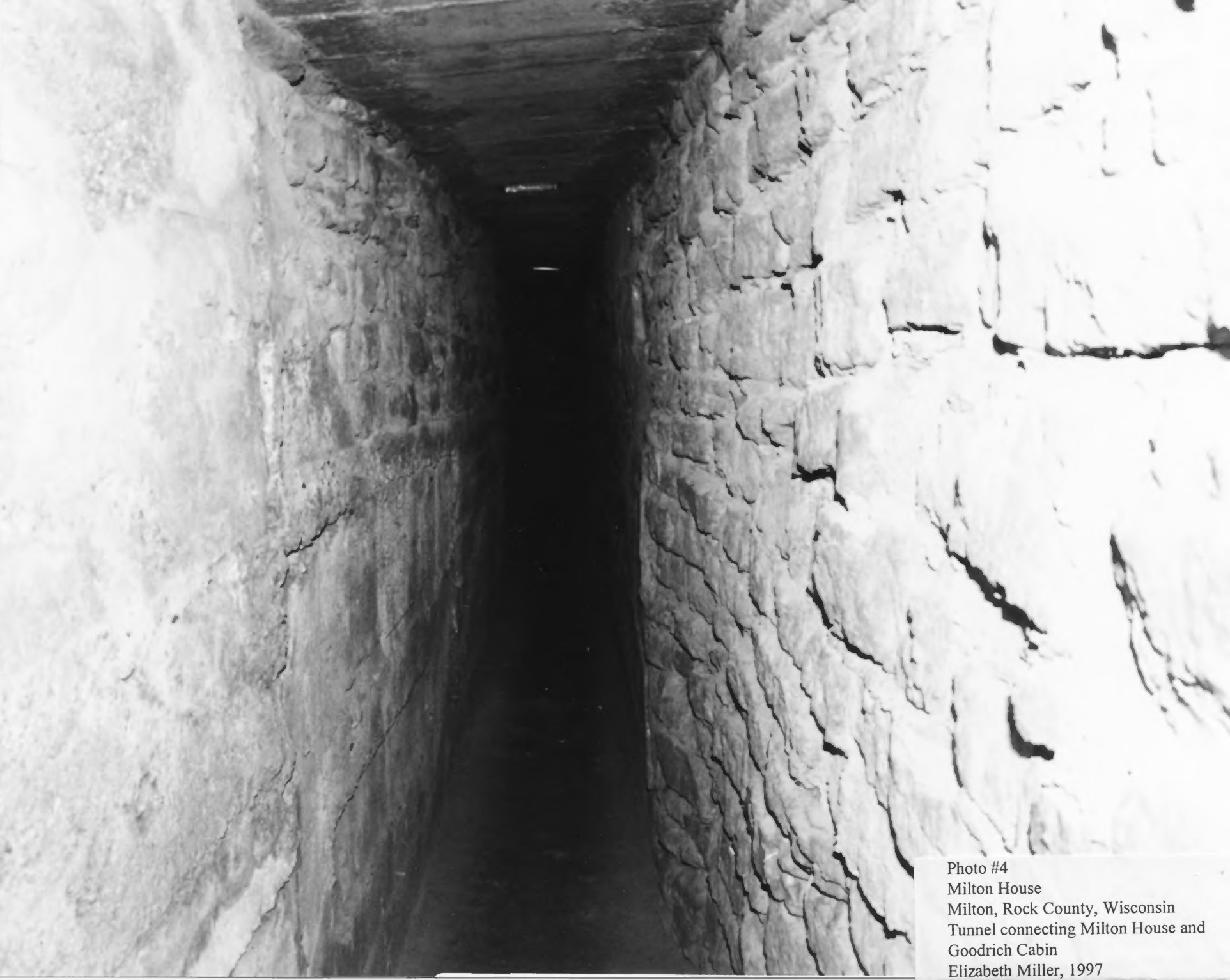
Photo #4 Milton House Milton, Rock County, Wisconsin Tunnel connecting Milton House and Goodrich Cabin