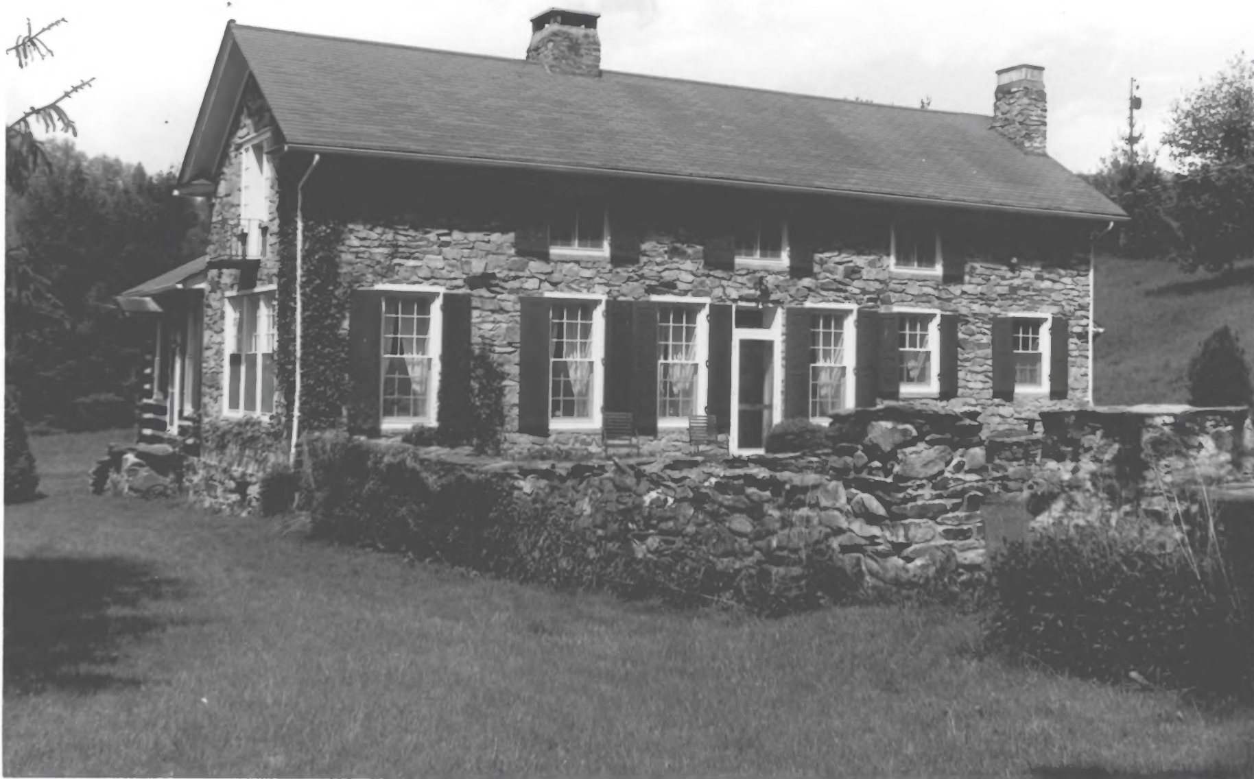
Sherwood Anderson House ("Ripshin Farm"), Trout Dale, Virginia