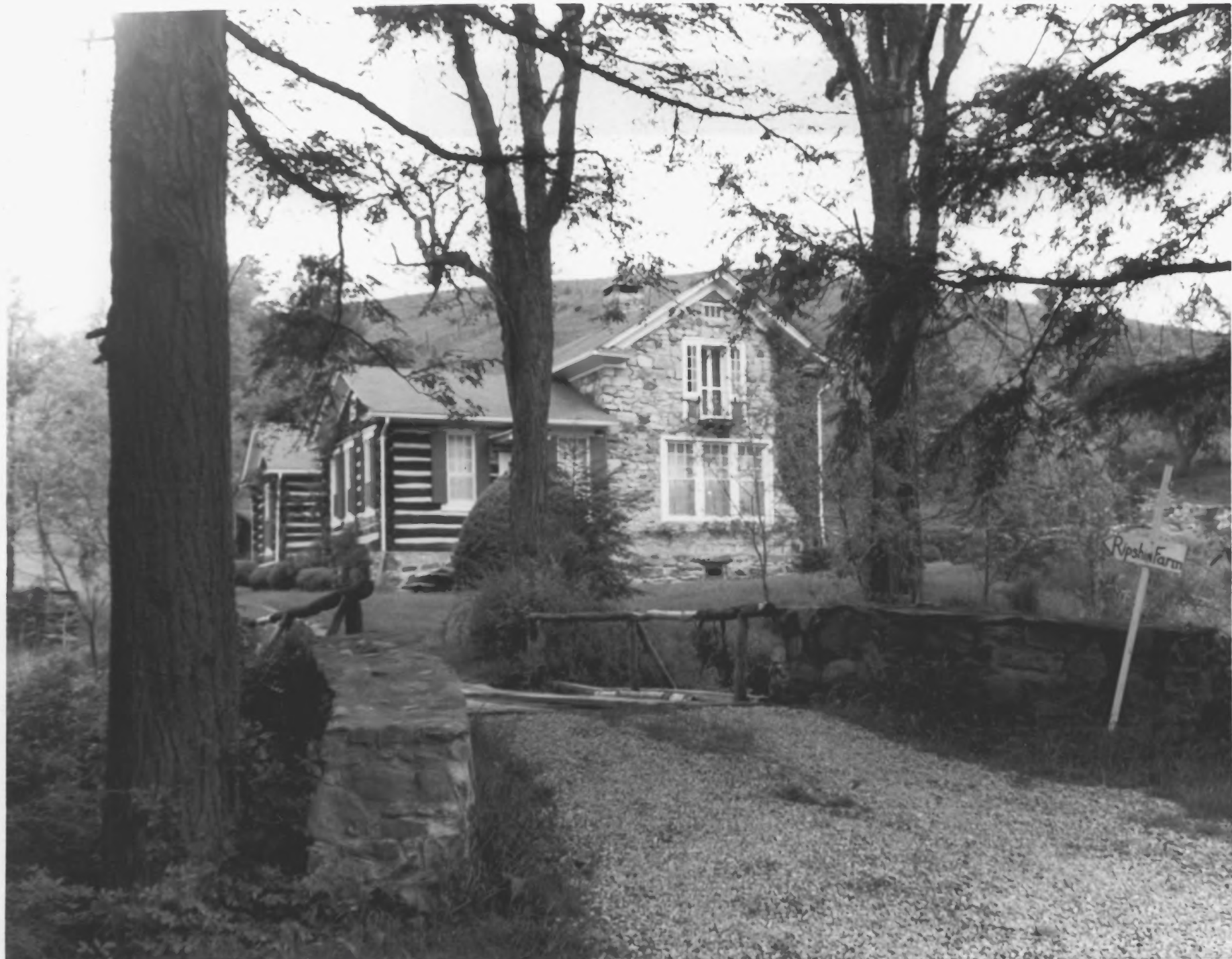
"Ripshin Farm," Sherwood Anderson House, Trout Dale, Virginia (entrance)