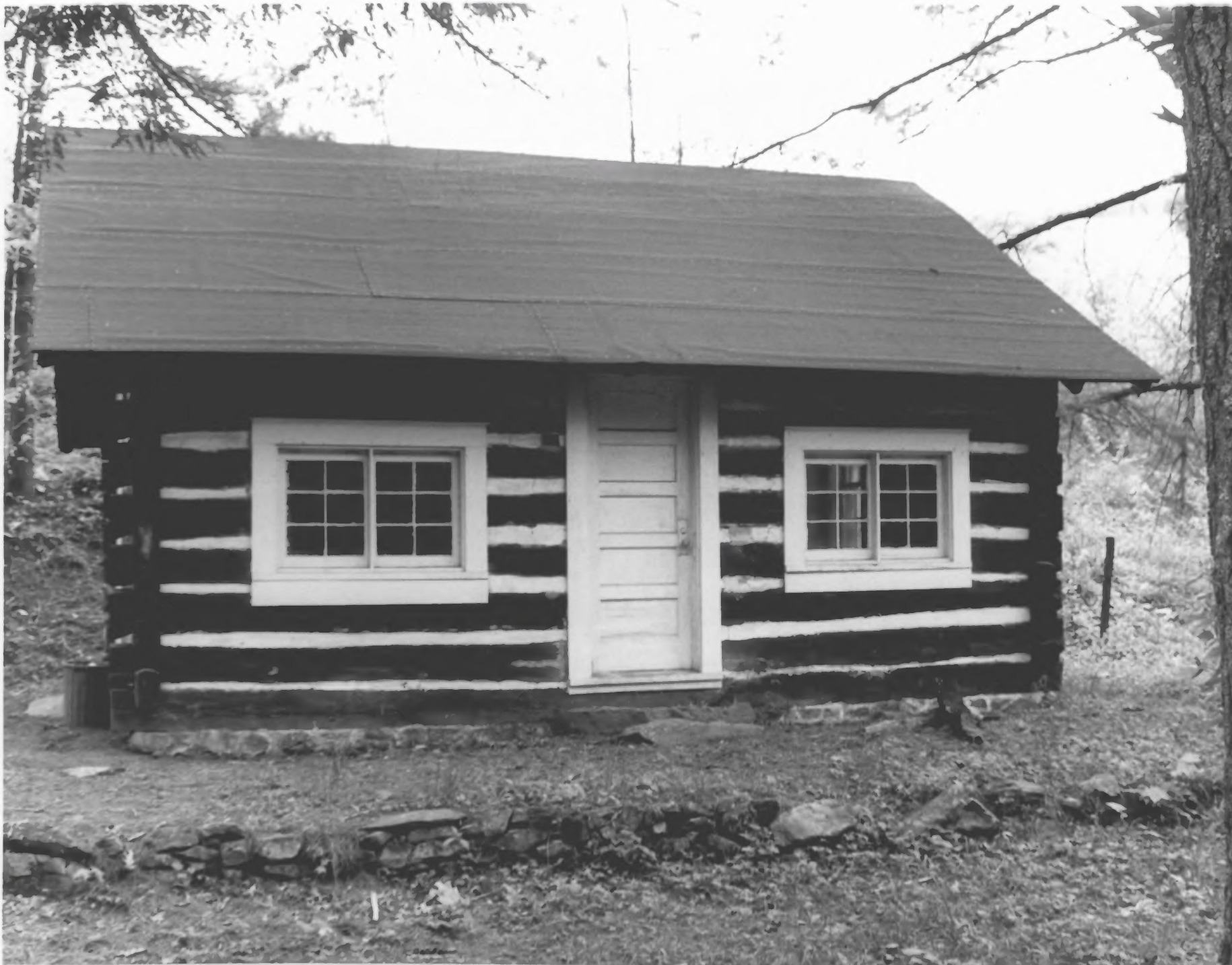
"Ripshin Farm," Sherwood Anderson House, Trout Dale, Virginia (writing cabin)