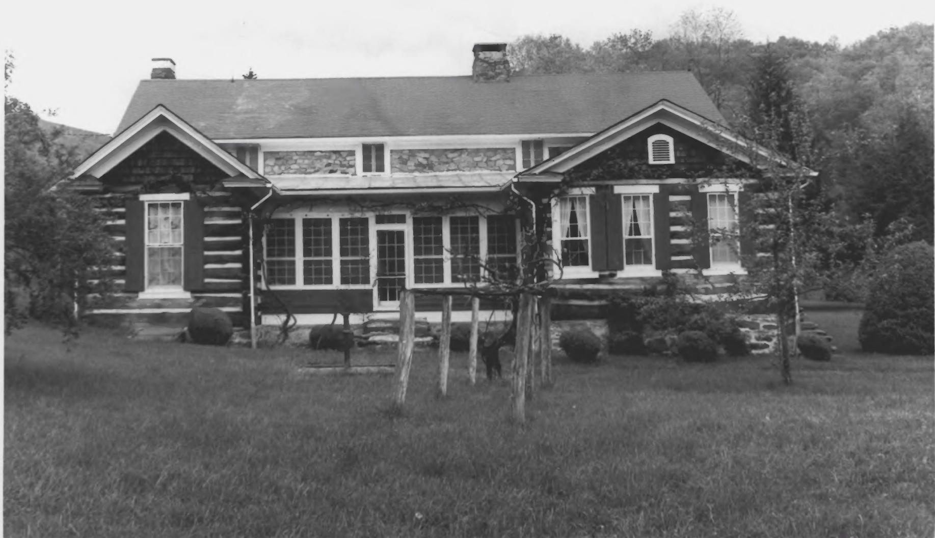
Sherwood Anderson House ("Ripshin Farm"), Trout Dale, Virginia