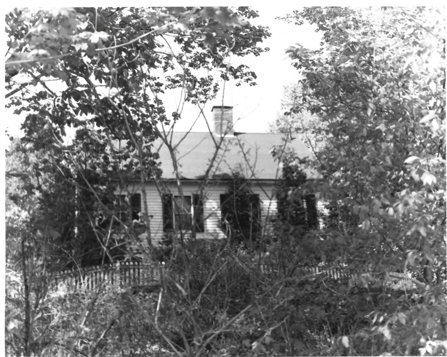
"Steepletop" Edna St. Vincent Millay House, Austerlitz, New York