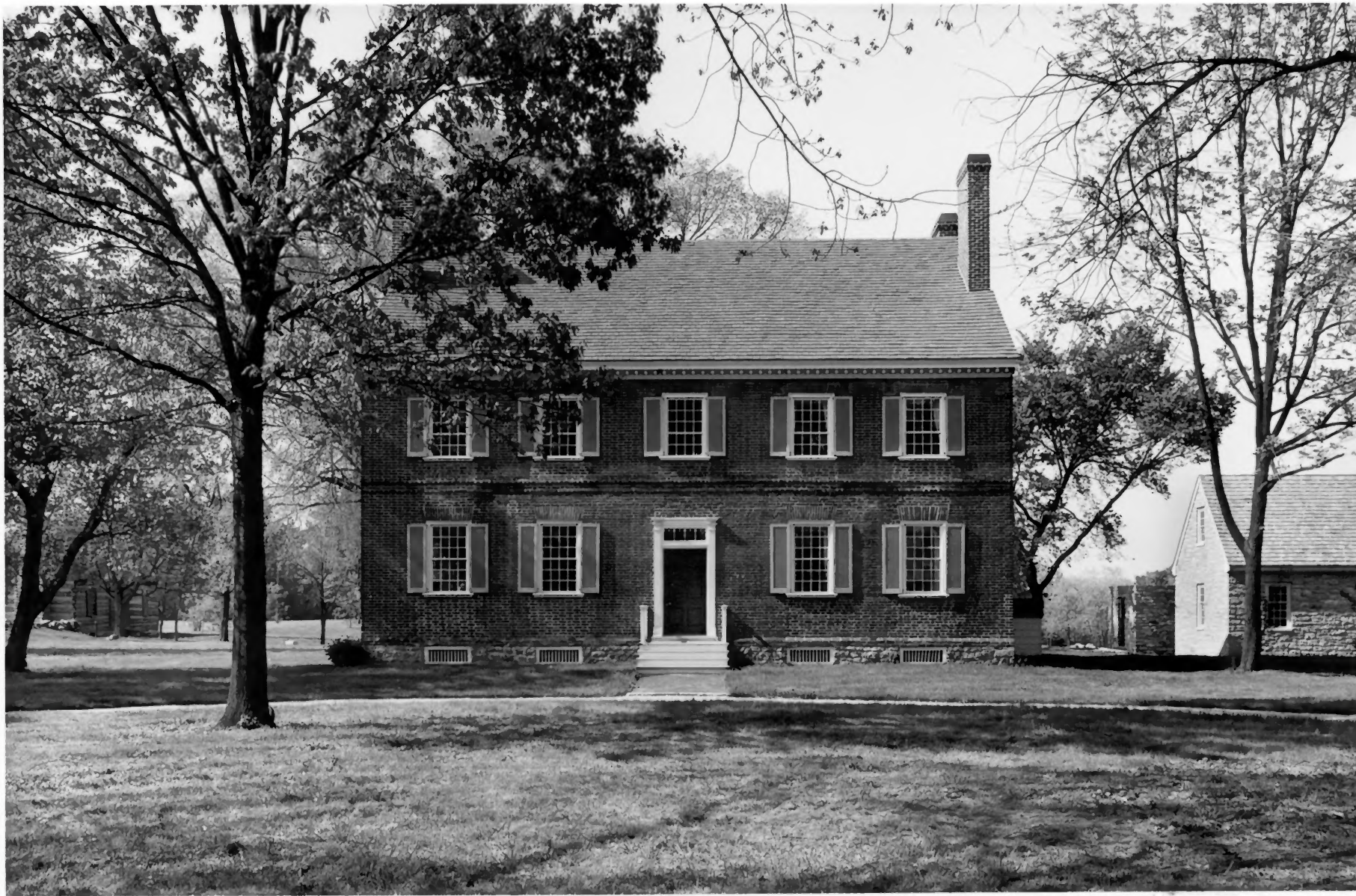
12 Locust Grove, front elevation, c. 1971