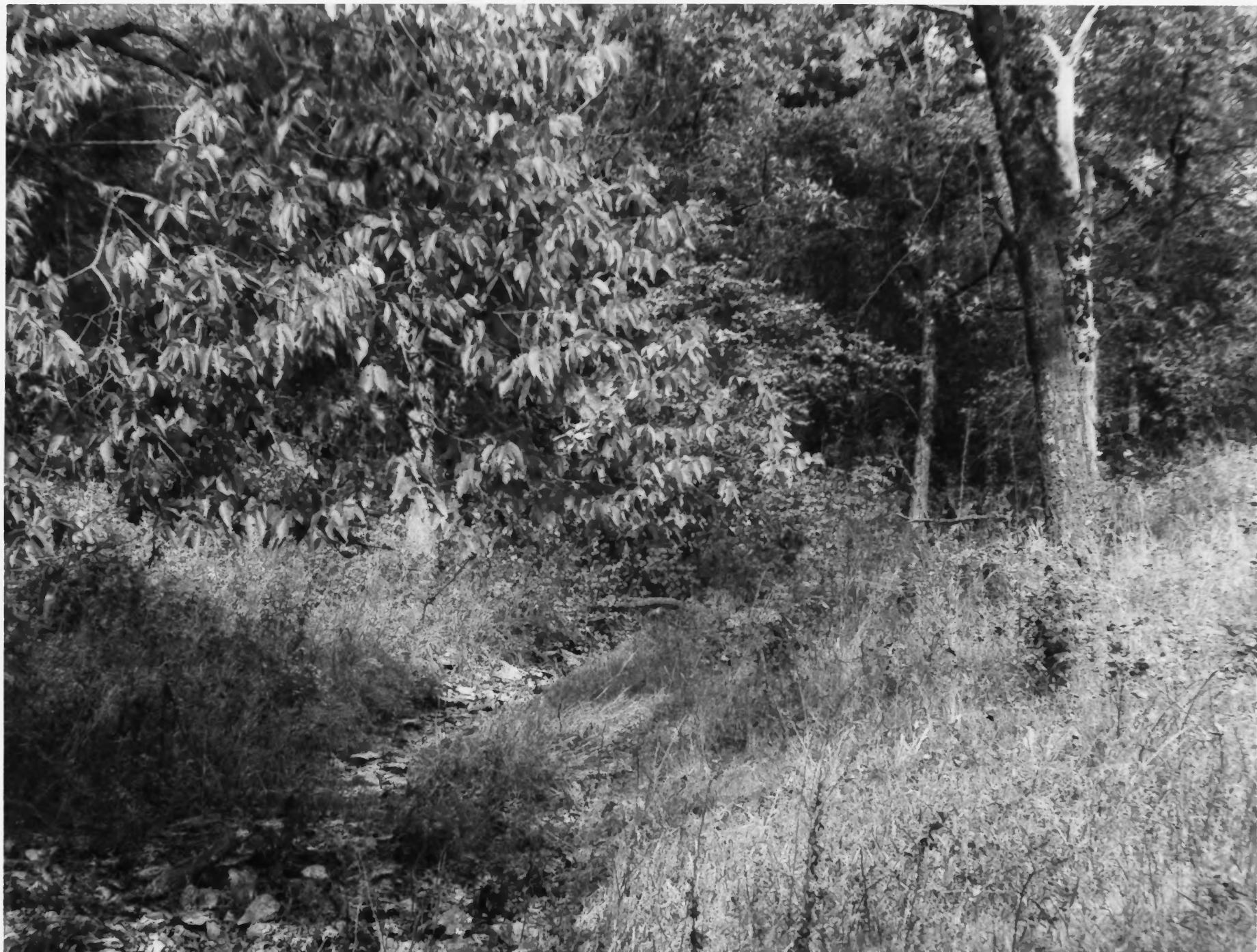
Marais des Cygnes Massacre Site, Trading Post, Kansas