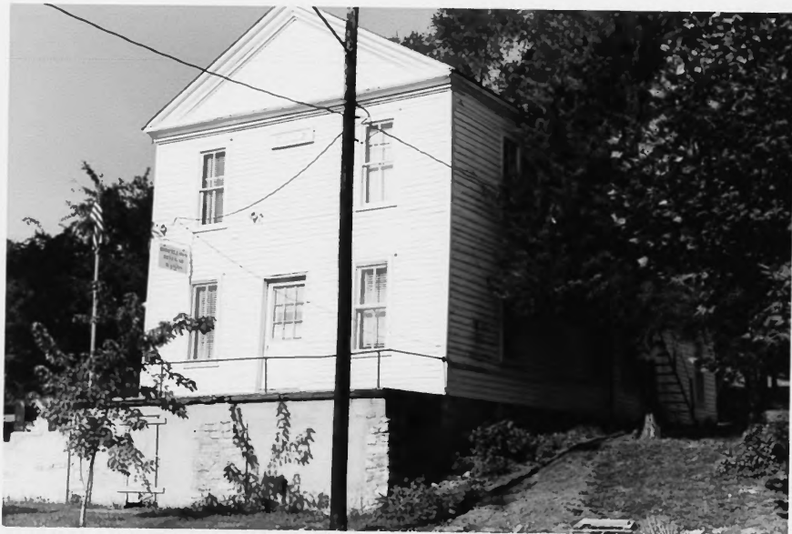
View SW, Showing N & E exposures, Lecompton Constitution Hall