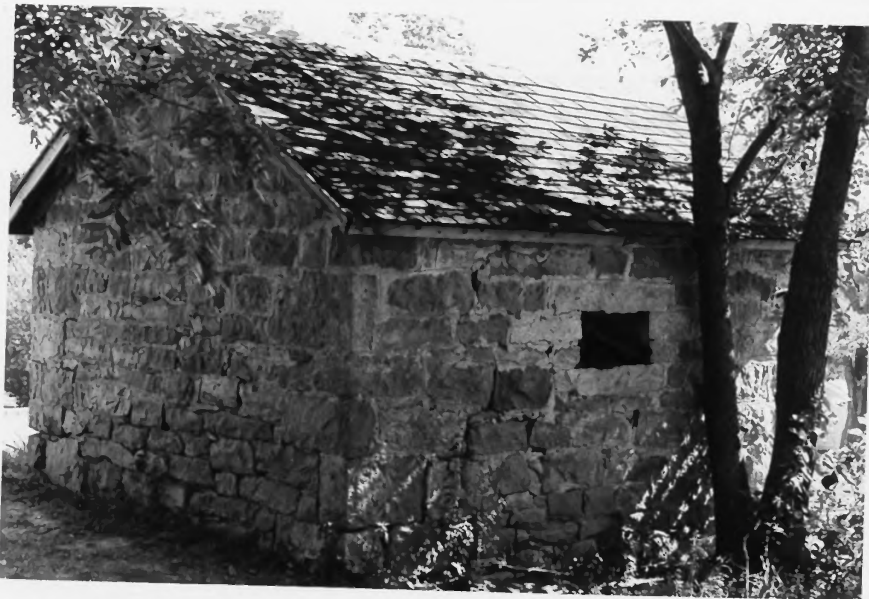
View of W and S exposures, Old Territorial Jail