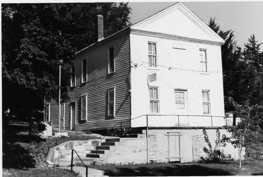
View NW, Showing E & S exposures, Lecompton Constitution Hall