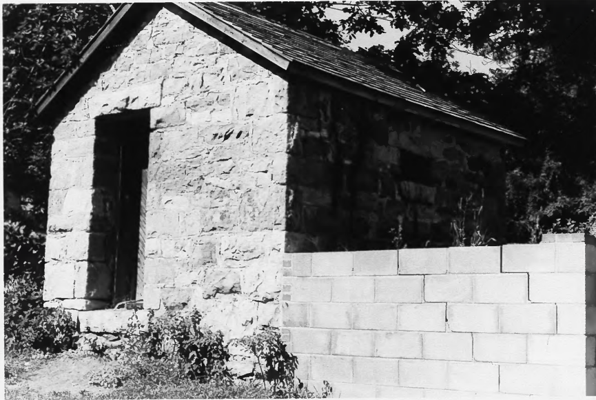
E and N exposures of old territorial jail, located behind the Hall, privately owned.