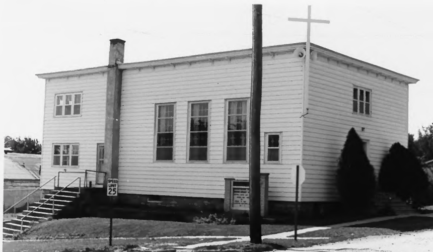
Methodist Church, originally a hotel contemporaneous with territorial capitol