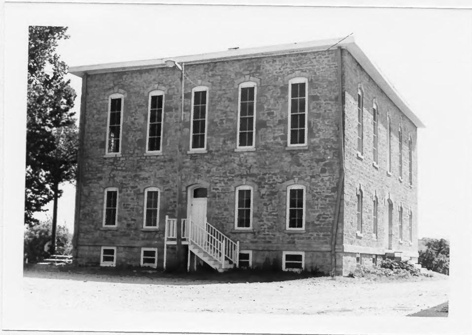
Lane University building - S & W exposures - built on foundation of unfinished capitol