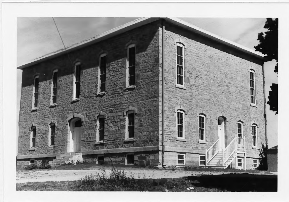
Lane University building, E & S exposures