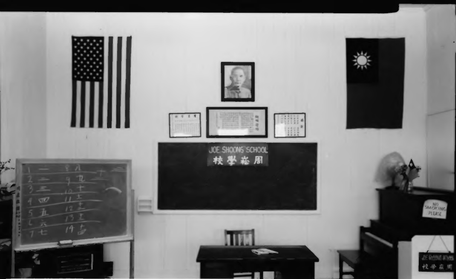
Locke Historic District, California Joe Shoong School (3), interior