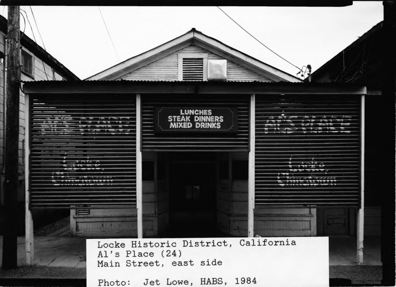
Locke Historic District, California Al's Place (24) Main Street, east side