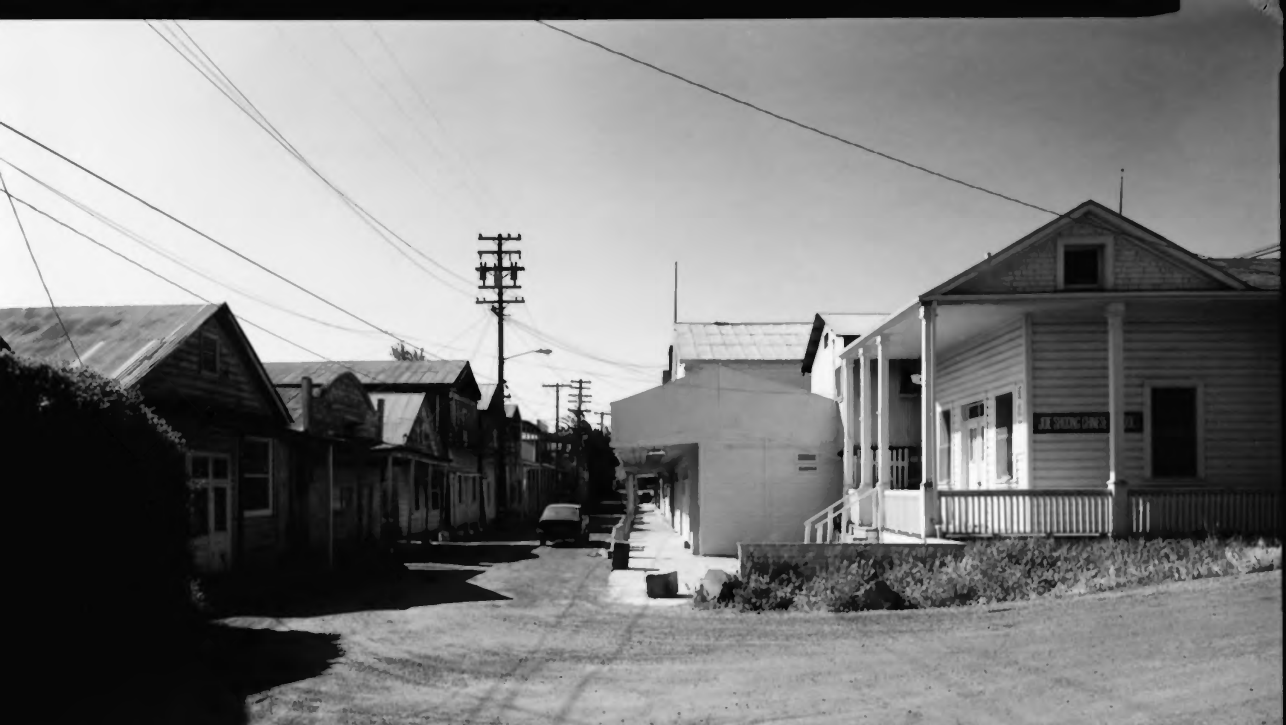
Locke Historic District, California Looking south along Main Street from Locke Road, Joe Shoong School (3) to right