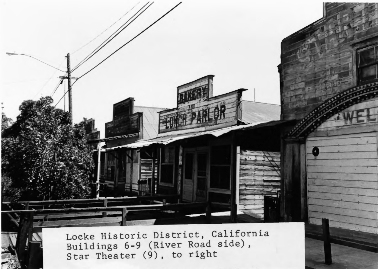
Locke Historic District, California Buildings 6-9 (River Road side), Star Theater (9), to right