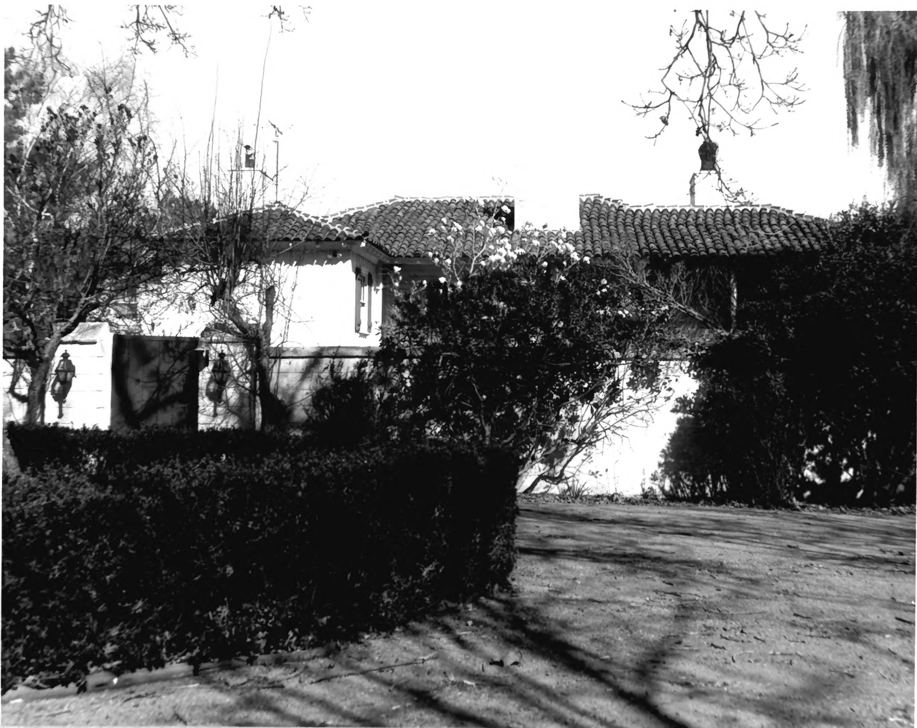
Tao House (Entrance Court and Western Facade) near Danville, California