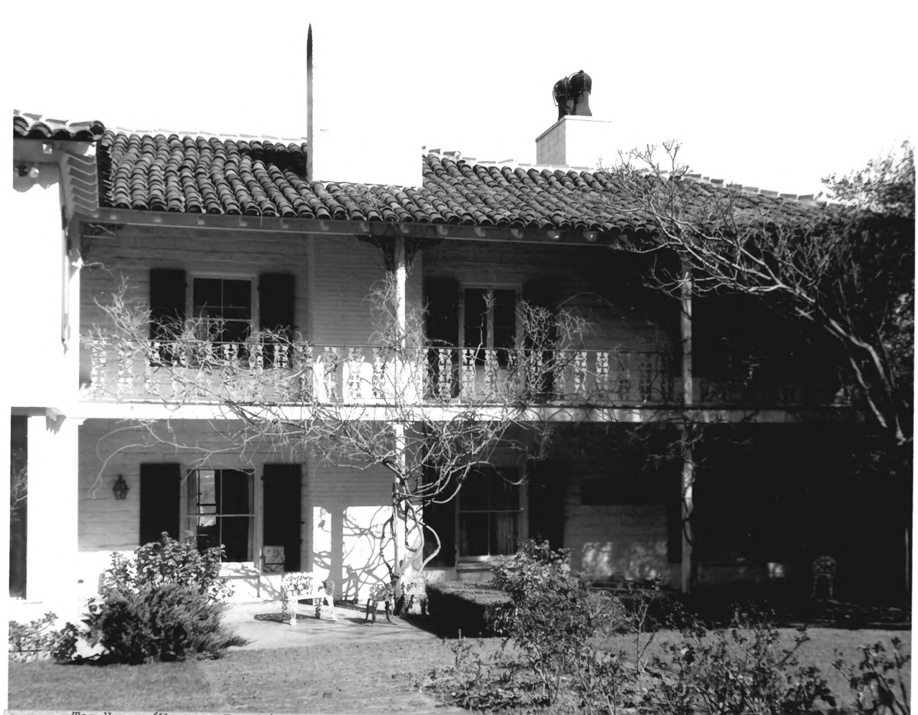
Tao House (Western Facade) near Danville, California