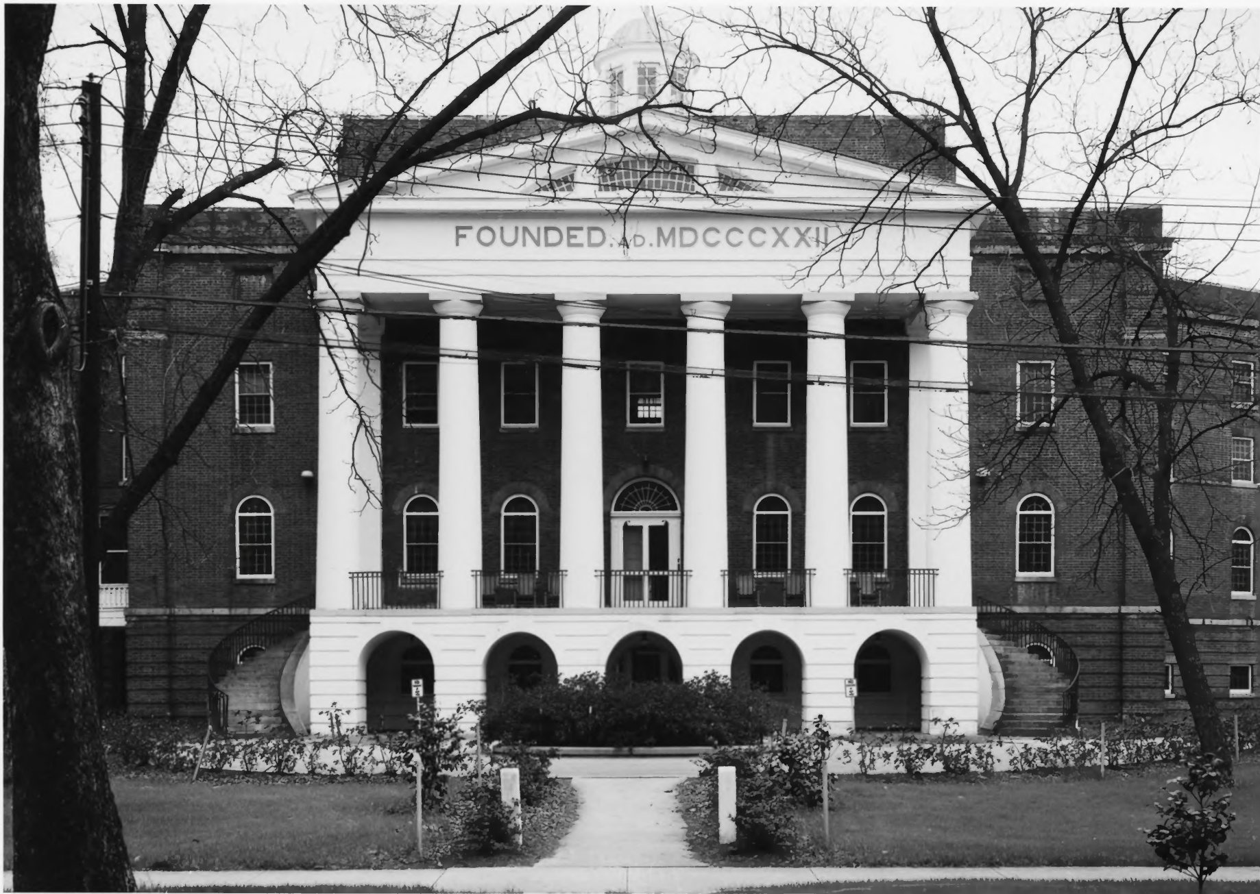
Robert Mills Building, South Carolina State Hospital, Columbia, South Carolina