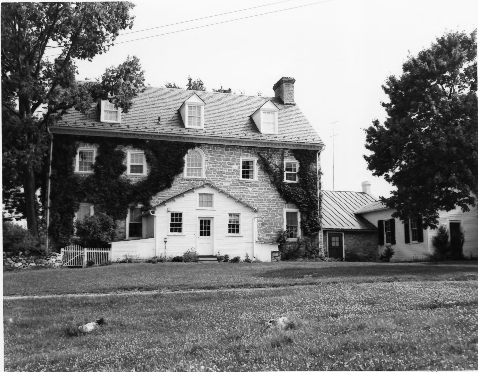
General Daniel Morgan House, Saratoga, Boyce, Virginia. (North elevation).