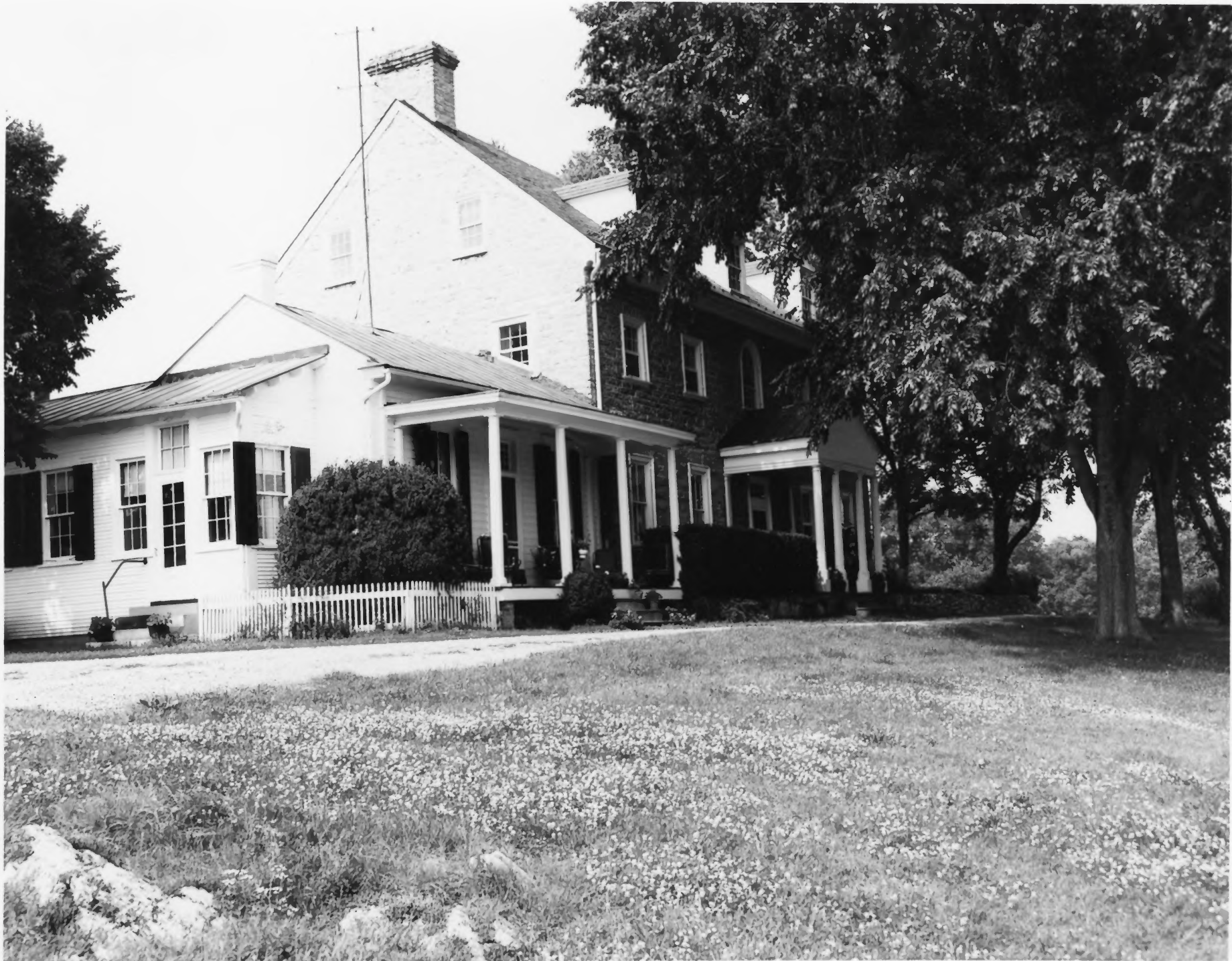
General Daniel Morgan House, Saratoga, Boyce, Virginia (South elevation)