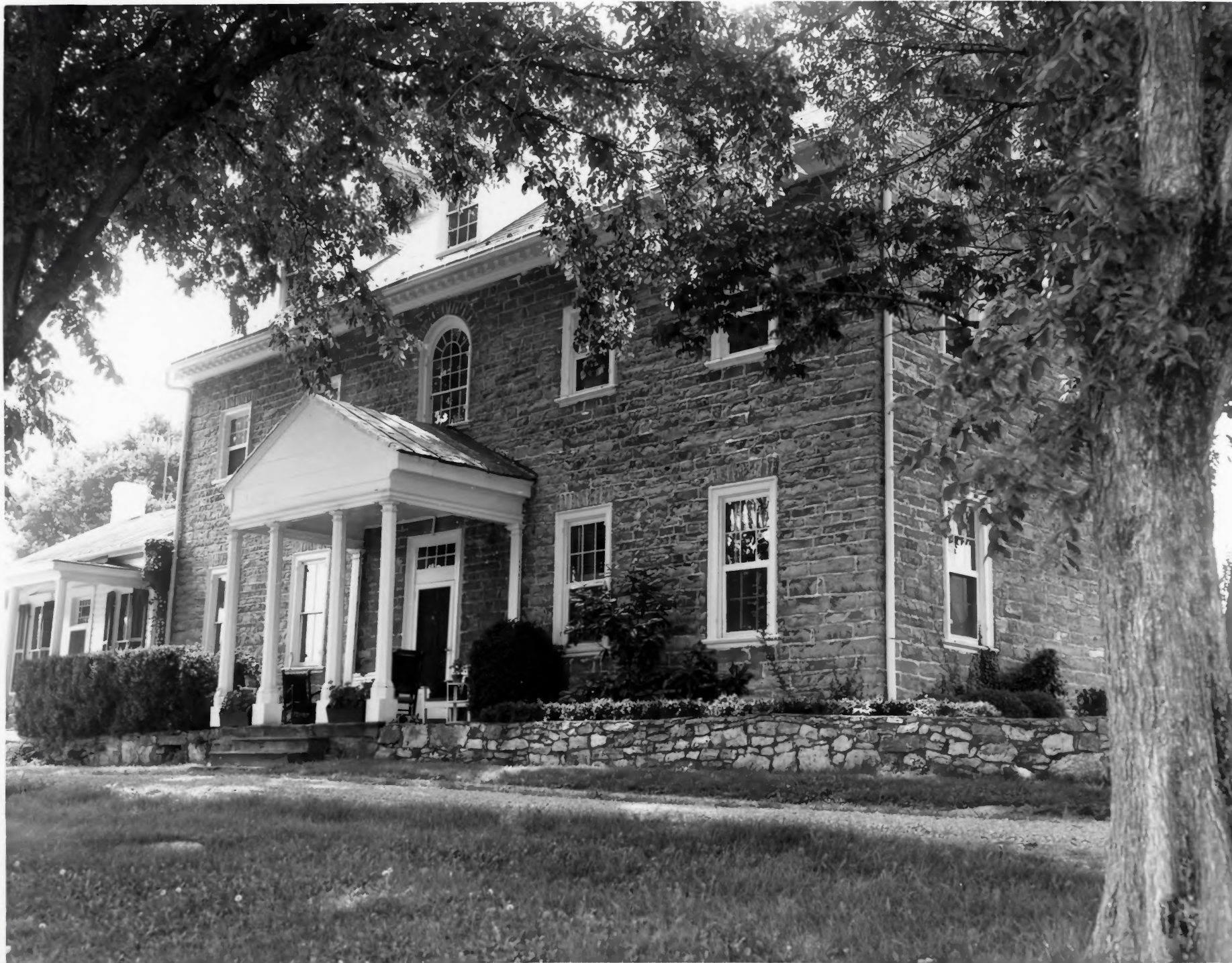
General Daniel Morgan House, Saratoga, Boyce, Virginia. (South elevation).