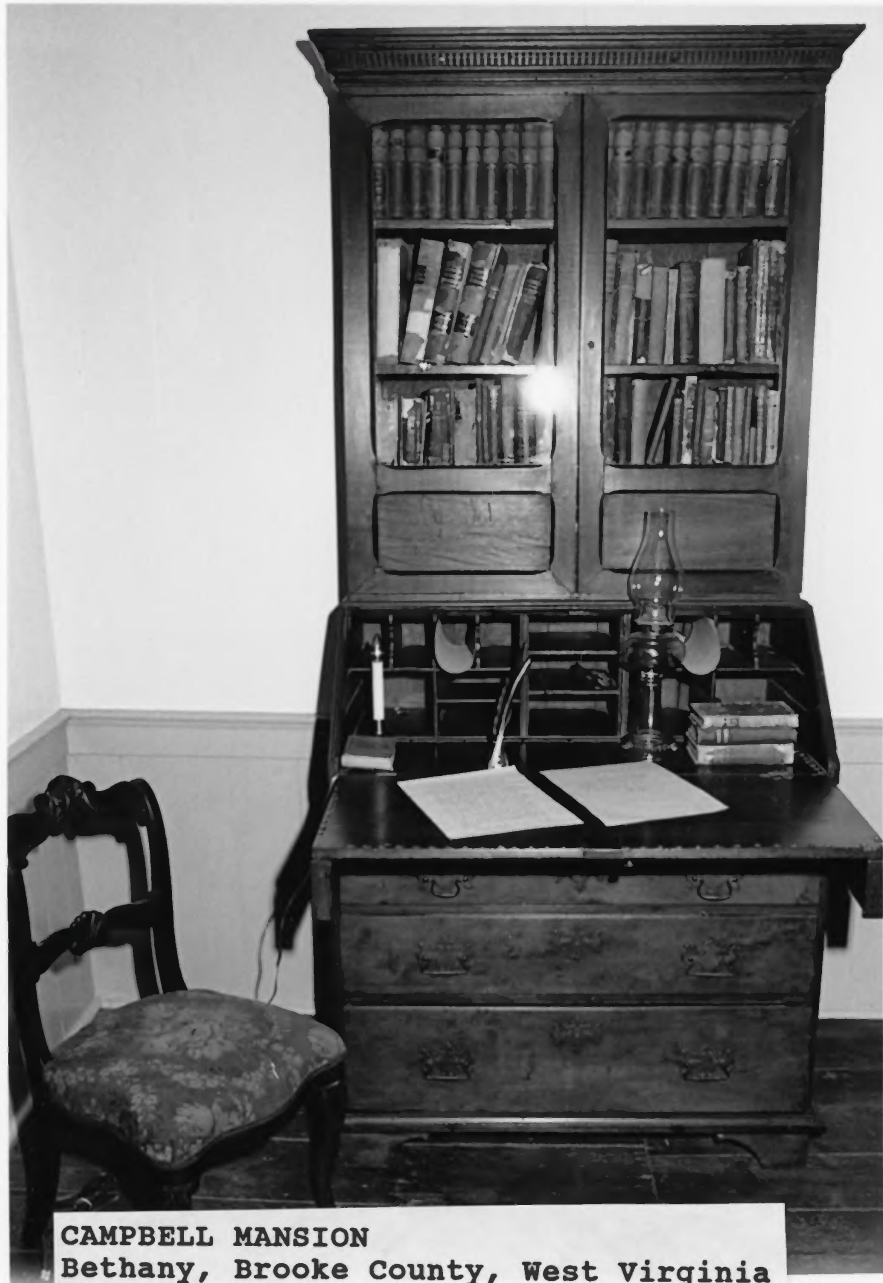
CAMPBELL MANSION Bethany, Brooke County, West Virginia "Secretary" in parlor in original portion of house