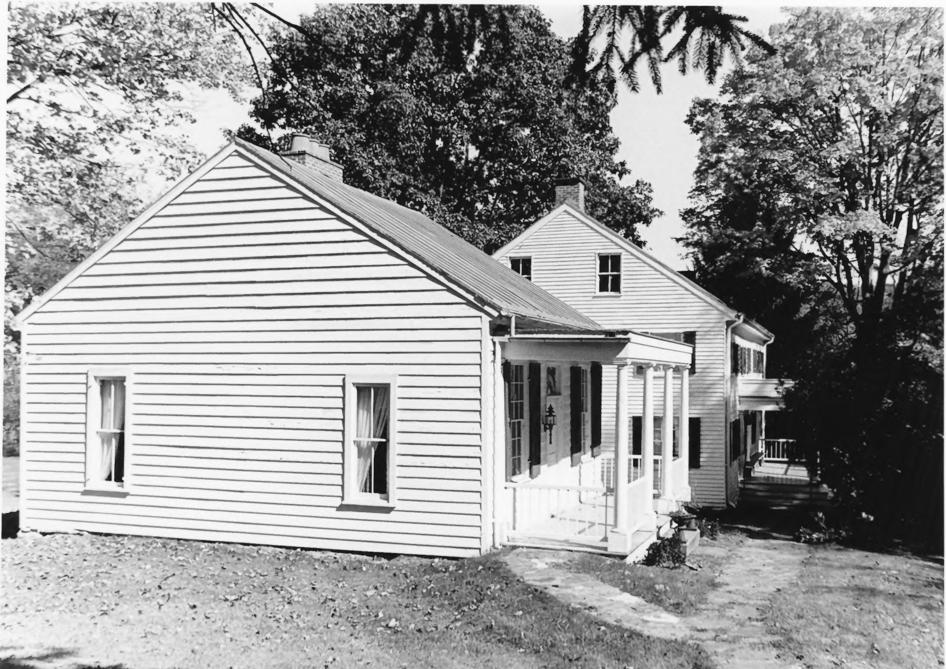
CAMPBELL MANSION Bethany, Brooke County, West Virginia Strangers Hall from southwest, main block behind and to right