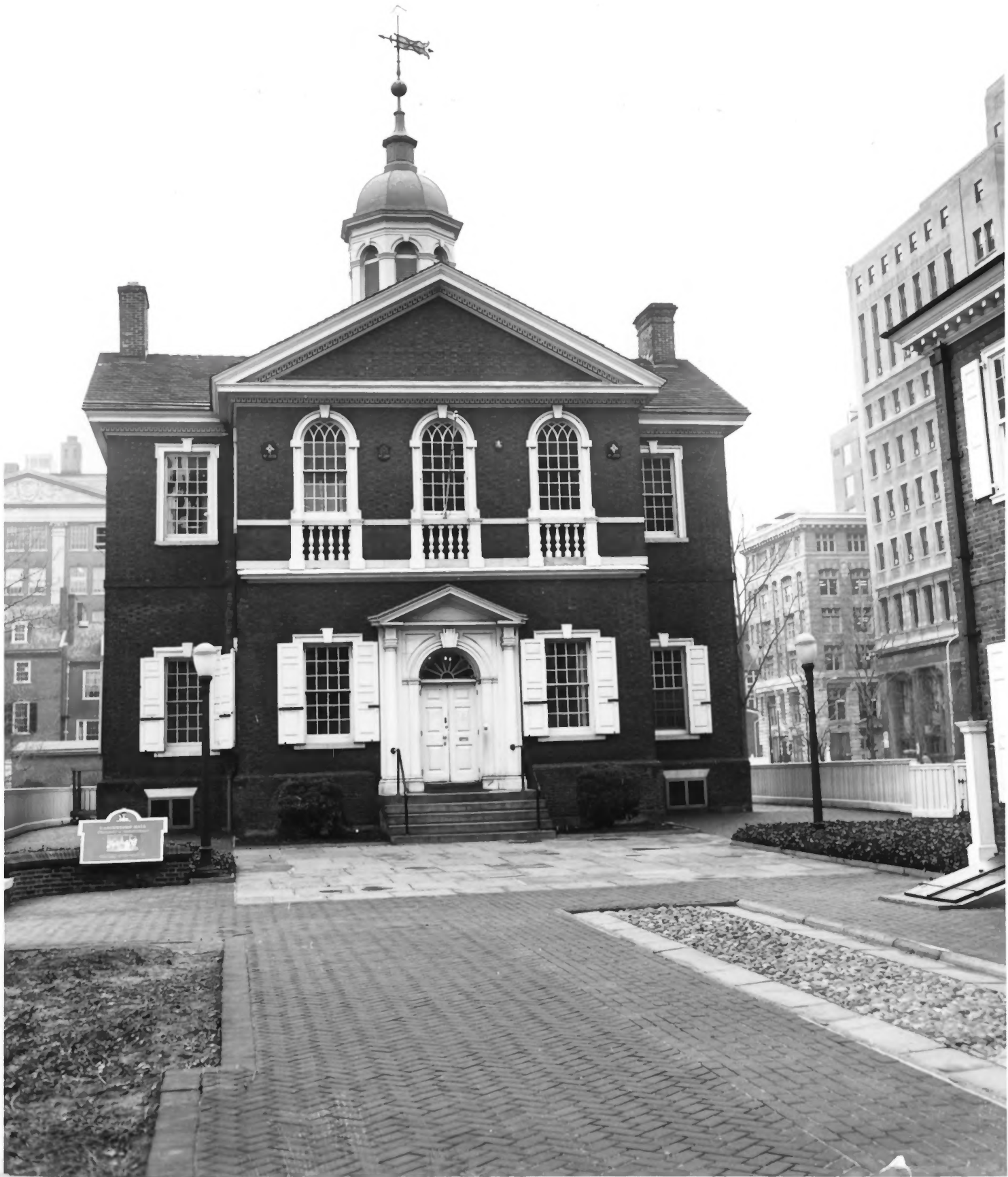
Carpenters Hall, Philadelphia, Pennsylvania