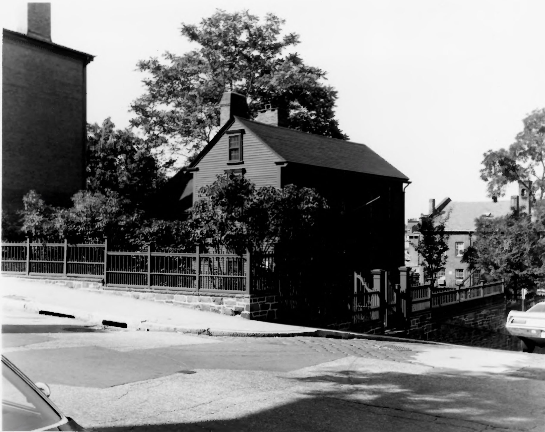
Gov. Stephen Hopkins House, Providence, Rhode Island