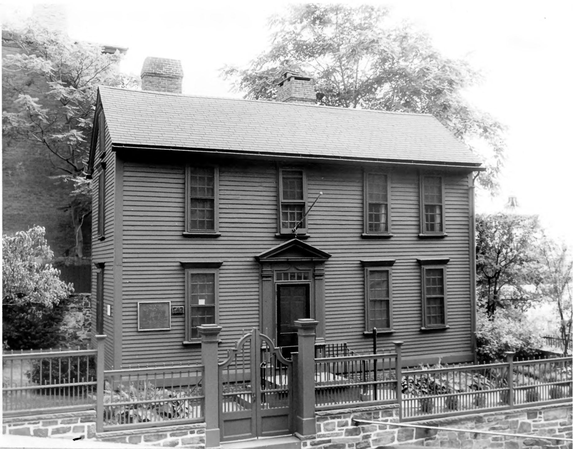
Stephen Hopkins House, Providence, Rhode Island