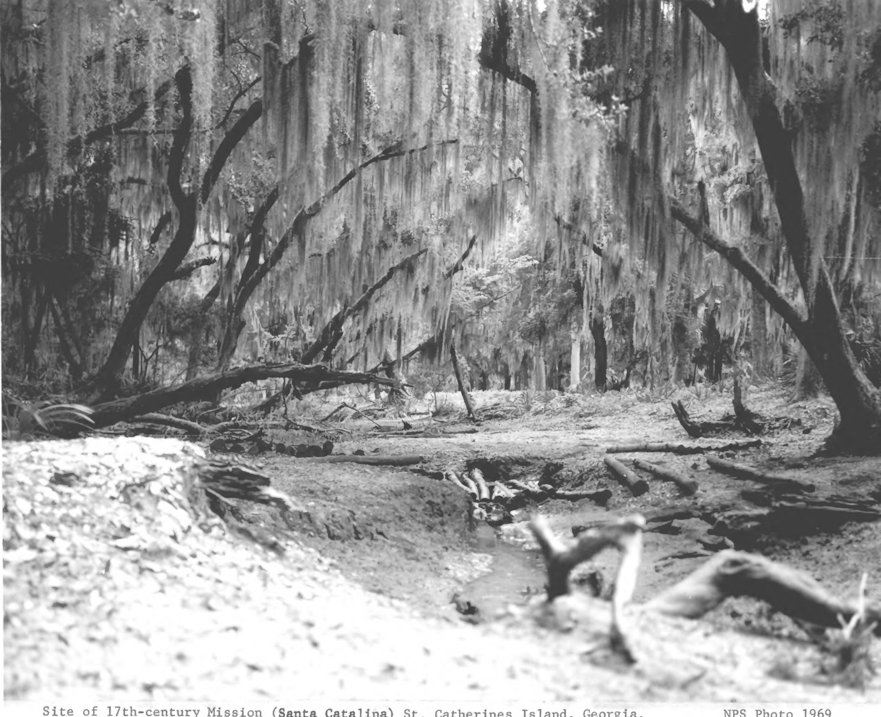
Site of 17th-century Mission (Santa Catalina) St. Catherines Island, Georgia.