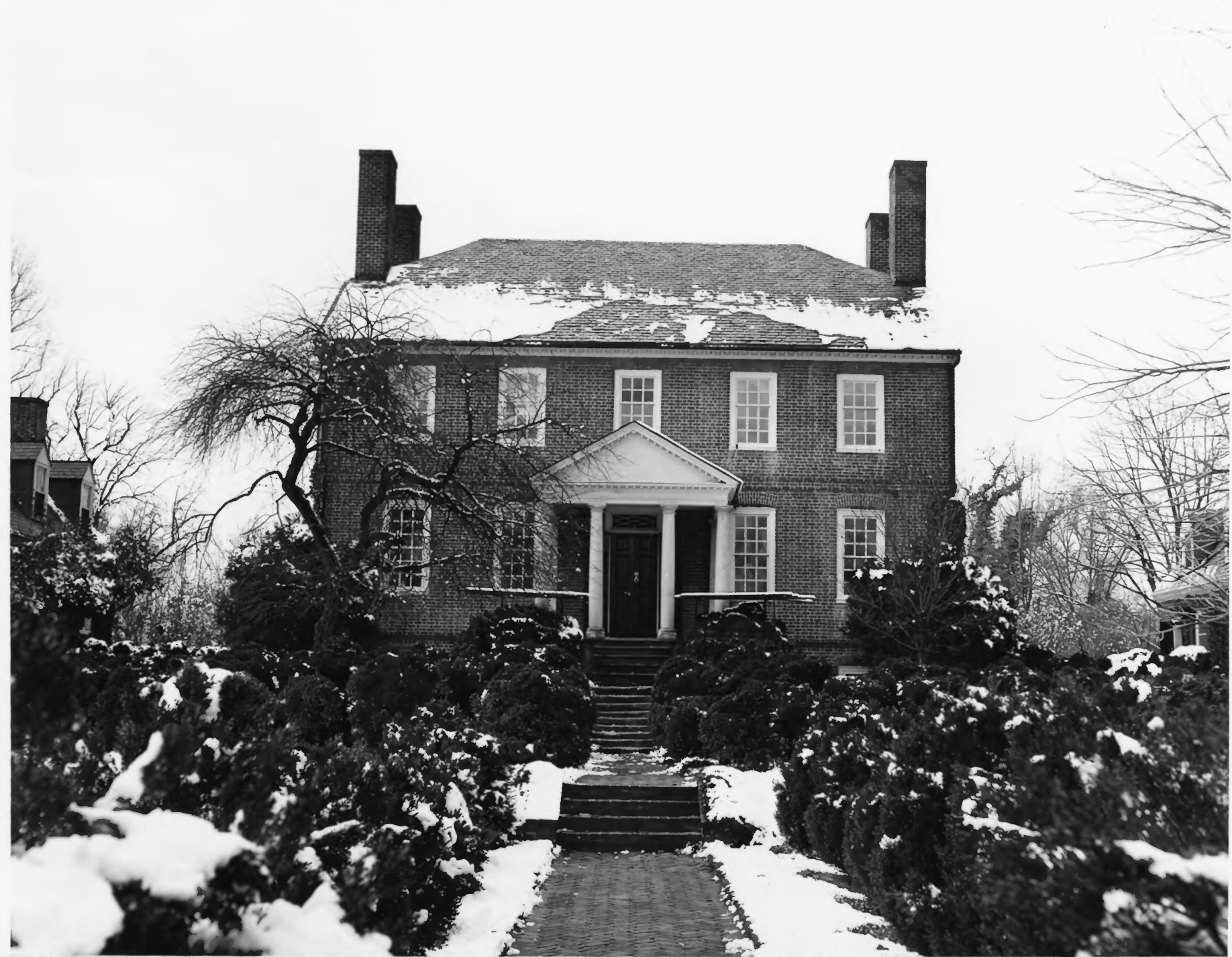
Kenmore, Fredericksburg, Virginia