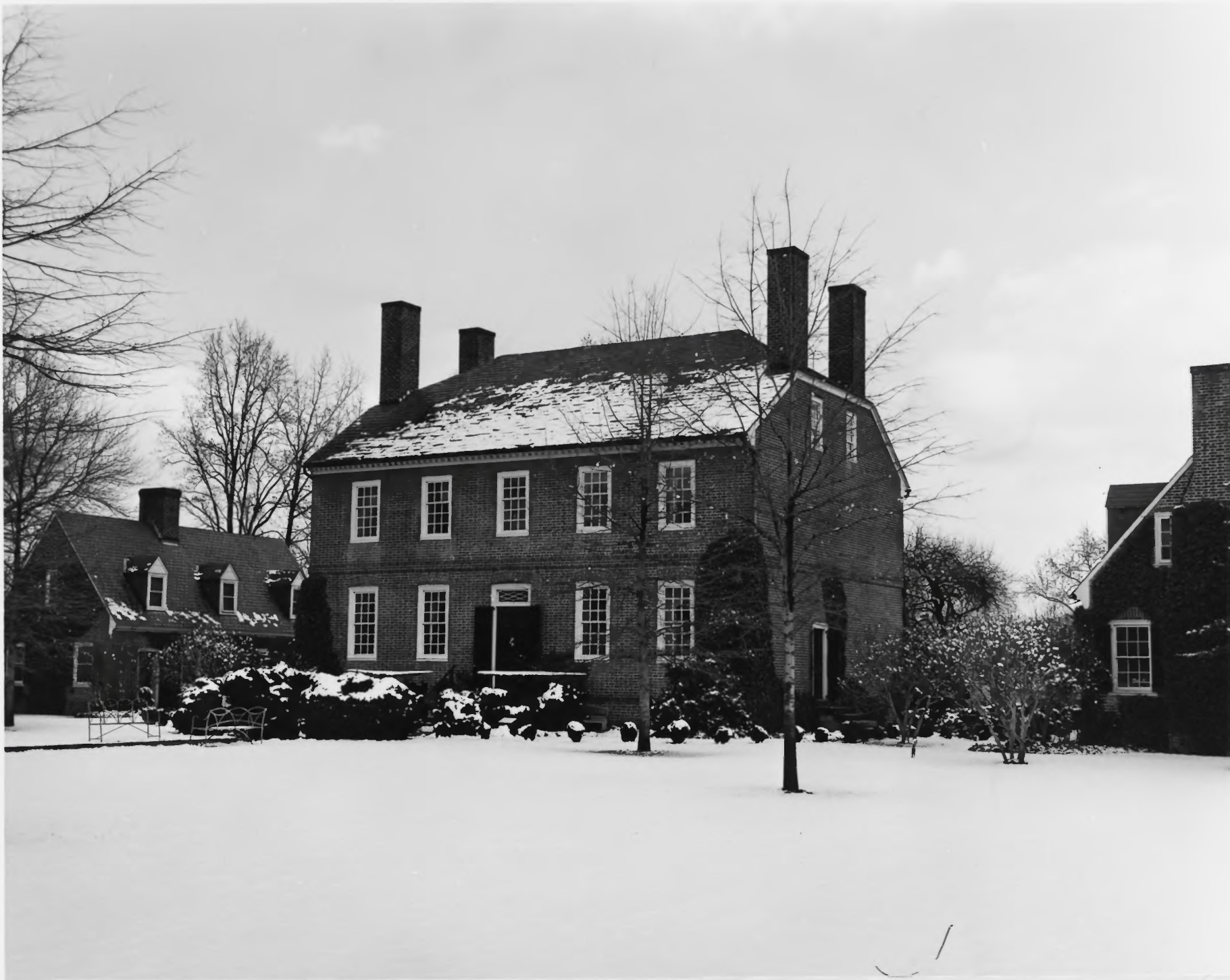
Kenmore, Fredericksburg, Virginia