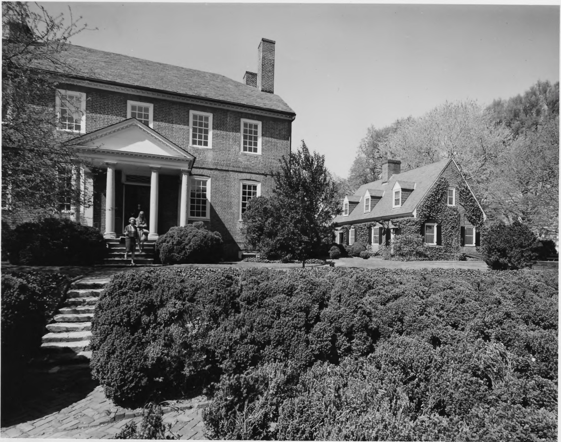
Kenmore, Fredericksburg, Virginia