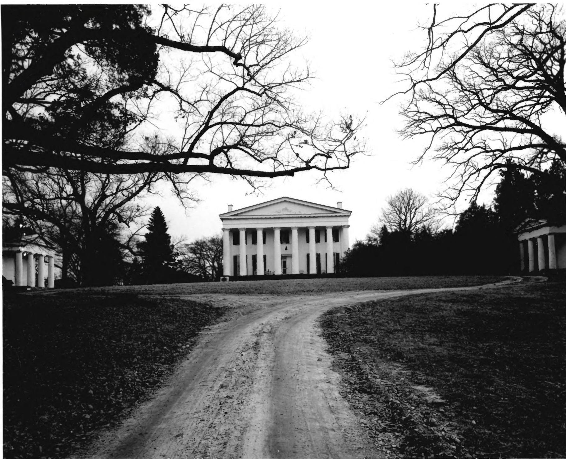
Berry Hill, Halifax Co., Virginia