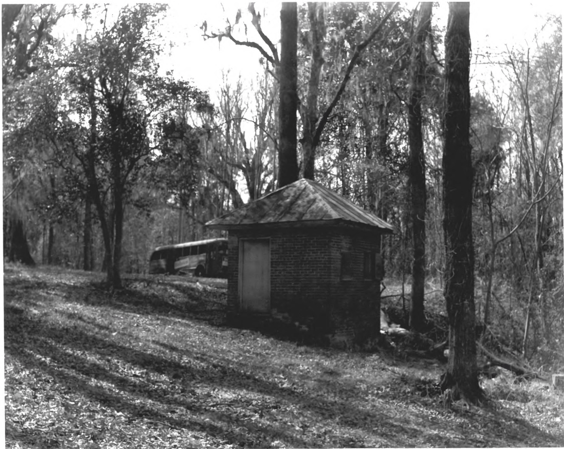
Necessary of Longwood, Natchez, Mississippi