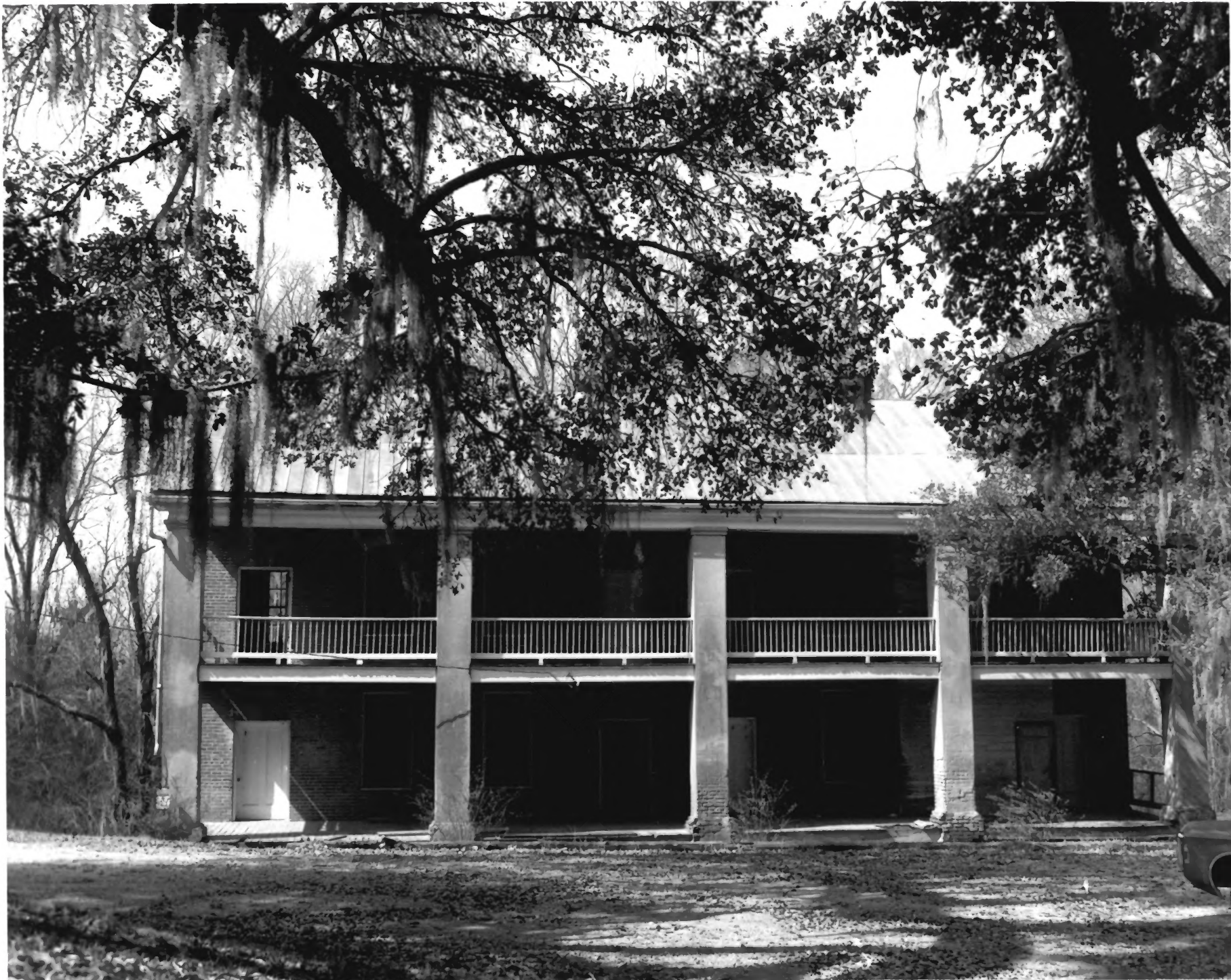
Servants' Quarters, Longwood, Natchez, Mississippi