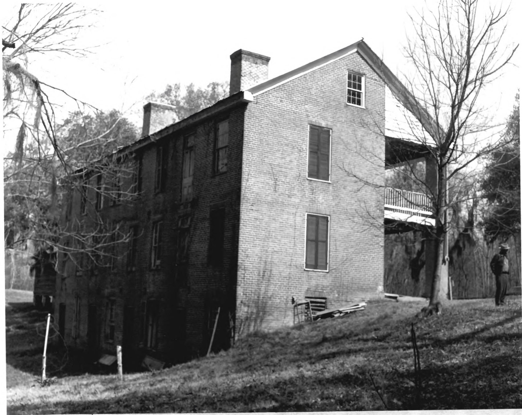
Servants' Quarters, Longwood, Natchez, Mississippi