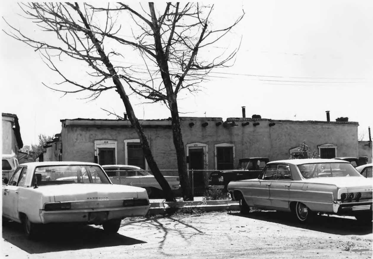
Views of West De Vargas.