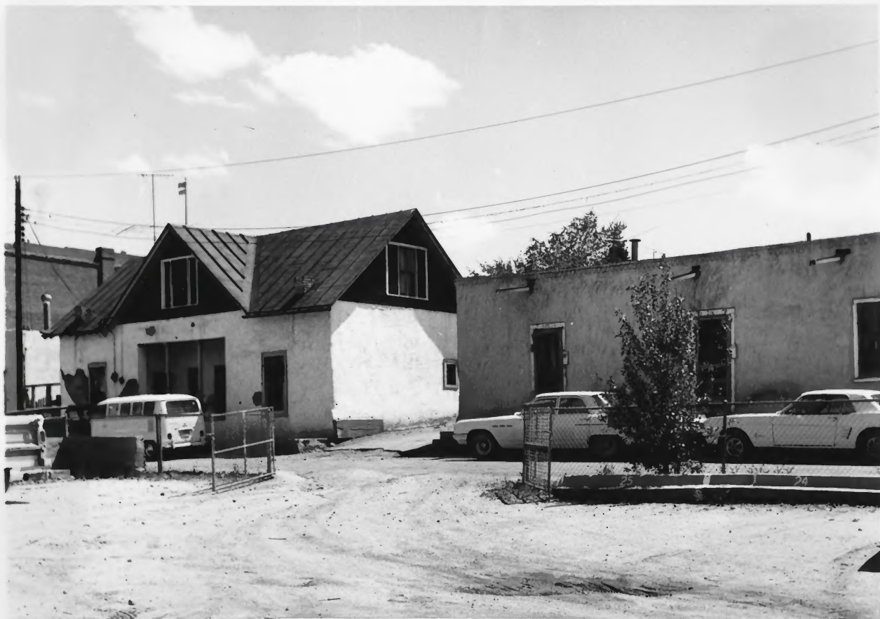
Views of West De Vargas