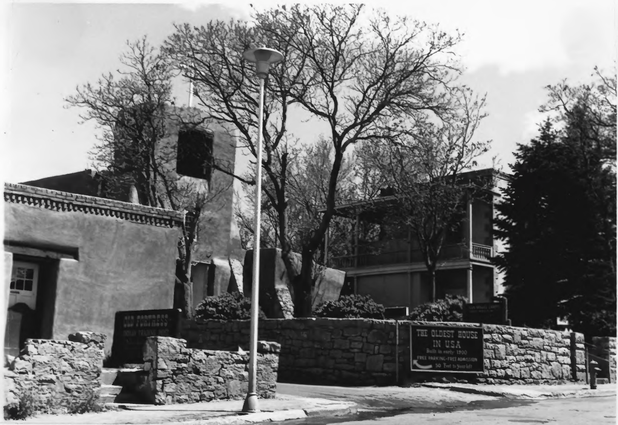
"Oldest House" (r.) and San Miguel Church facing College Street at intersection with East De Vargas. North end of St. Michael's Dormitory beyond church. 7