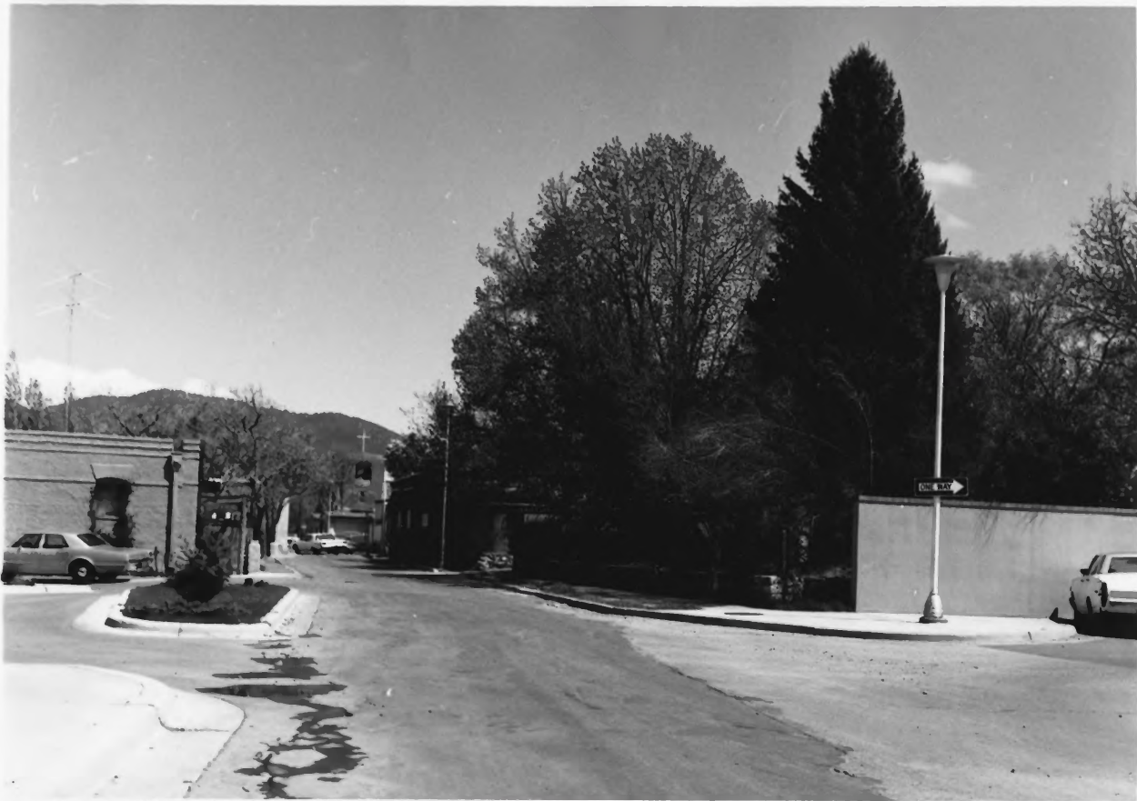
East De Vargas Street, looking east toward San Miguel Church.