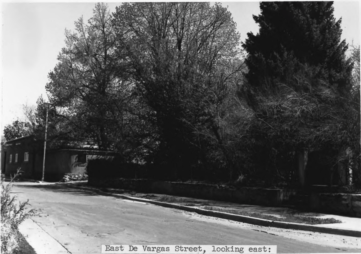
East De Vargas Street, looking east: Gregorio Crespín House (r.) and Santa Fe Theater.