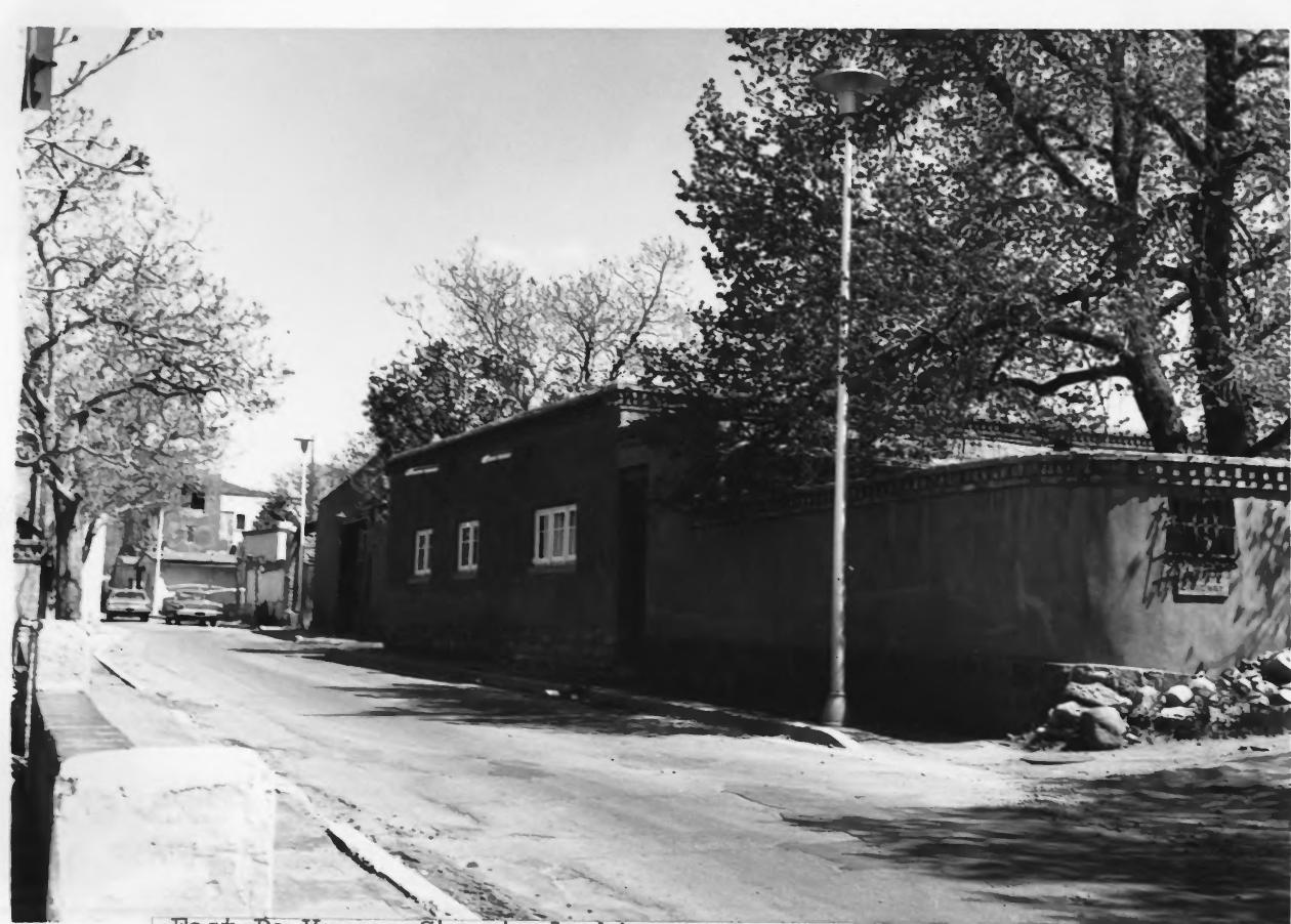
East De Vargas Street, looking east: Santa Fe Theater.