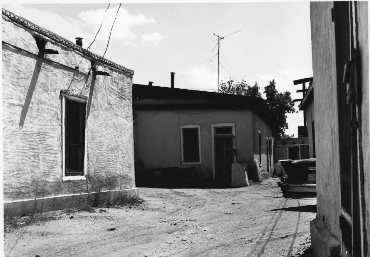
Example of unplanned court arrangement behind West De Vargas Street Facade.