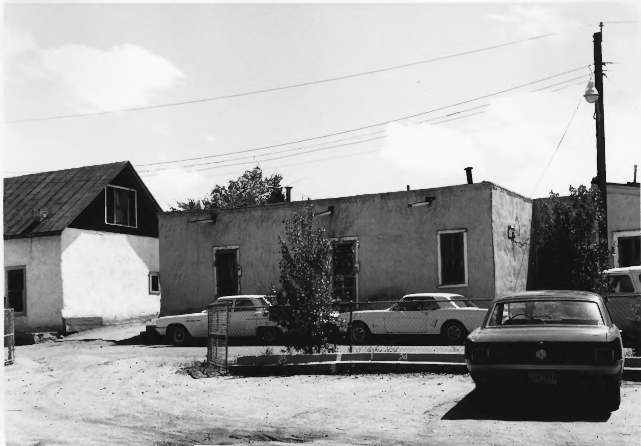
Views of West De Vargas