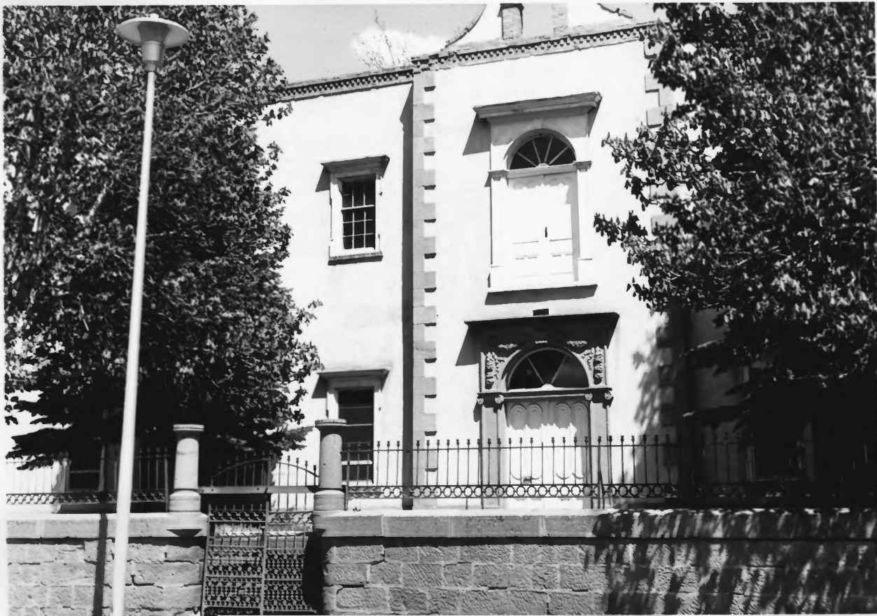
Entrance to St. Michael's Dormitory.