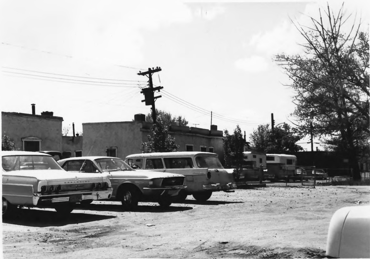
Views of West De Vargas.