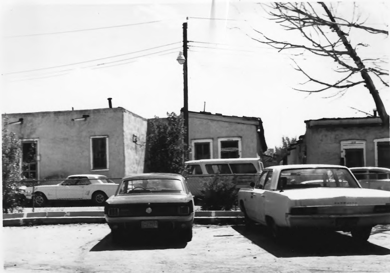
Views of West De Vargas.