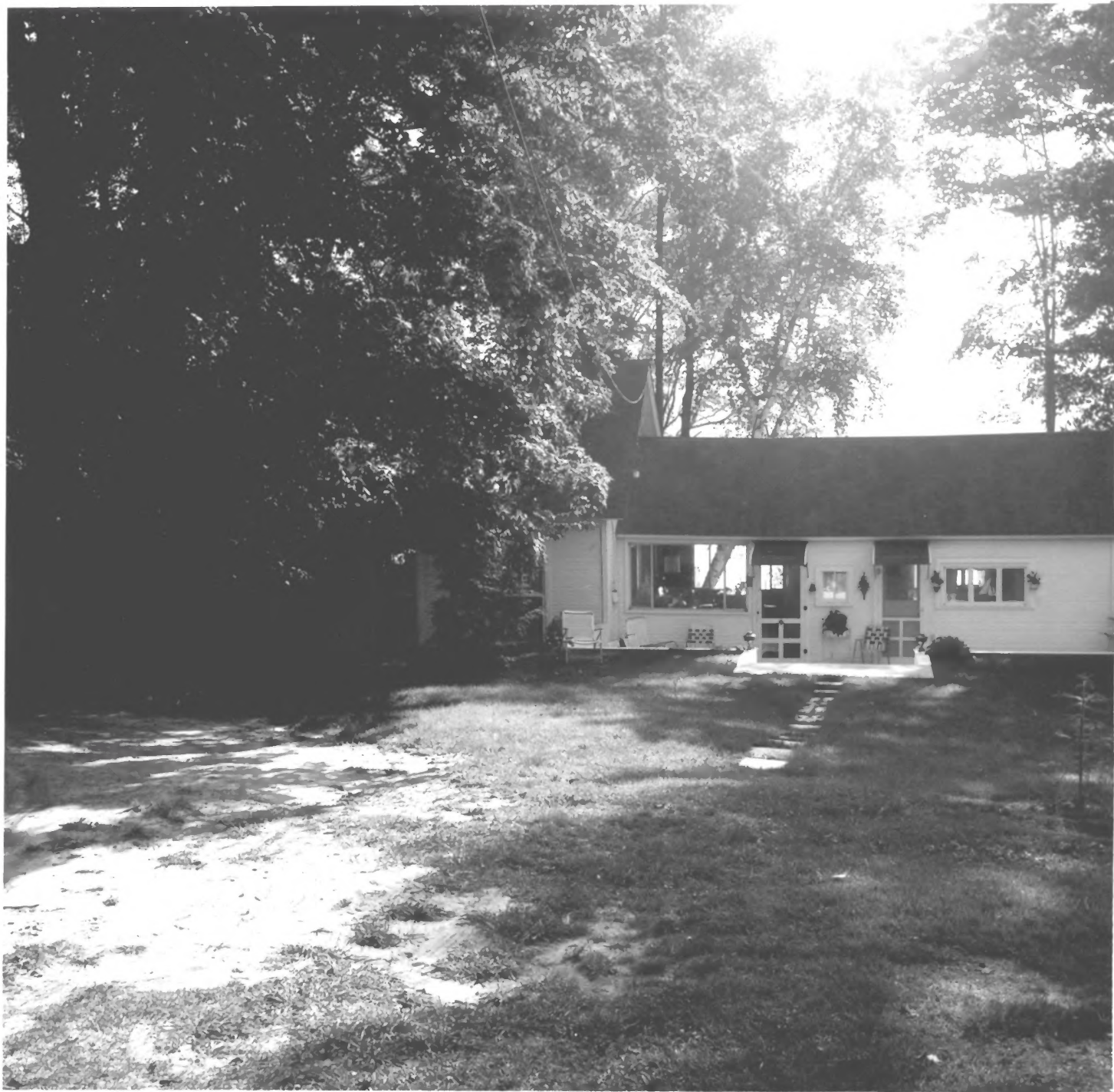
"Windemere." The Hemingway Cottage, Walloon Lake, Michigan, North side