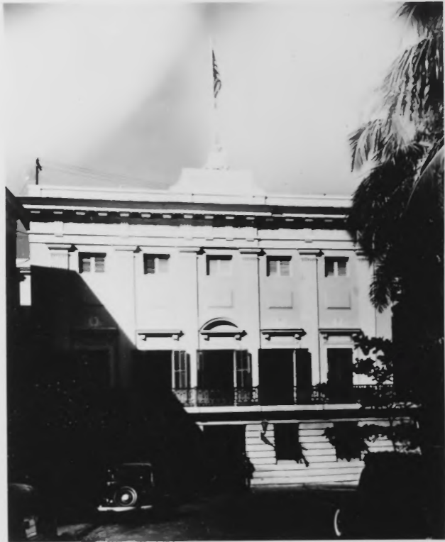
East or principal facade of La Fortaleza.