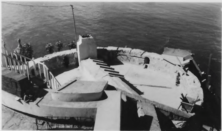
Top of NW tower showing in the parapet loopholes for both bow and arrow and harquebus