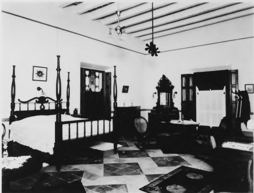
Bedroom in La Fortaleza showing type of ceiling construction being replaced with reinforced concrete