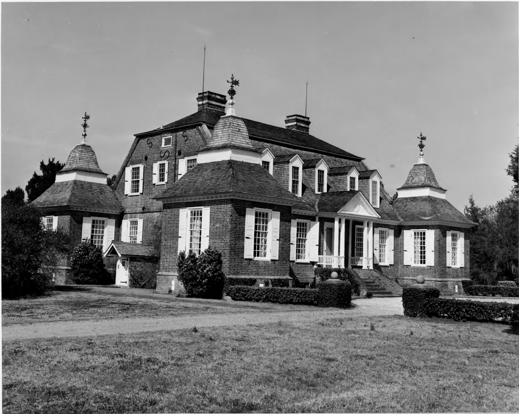
Mulberry Plantation House, Berkeley County, South Carolina