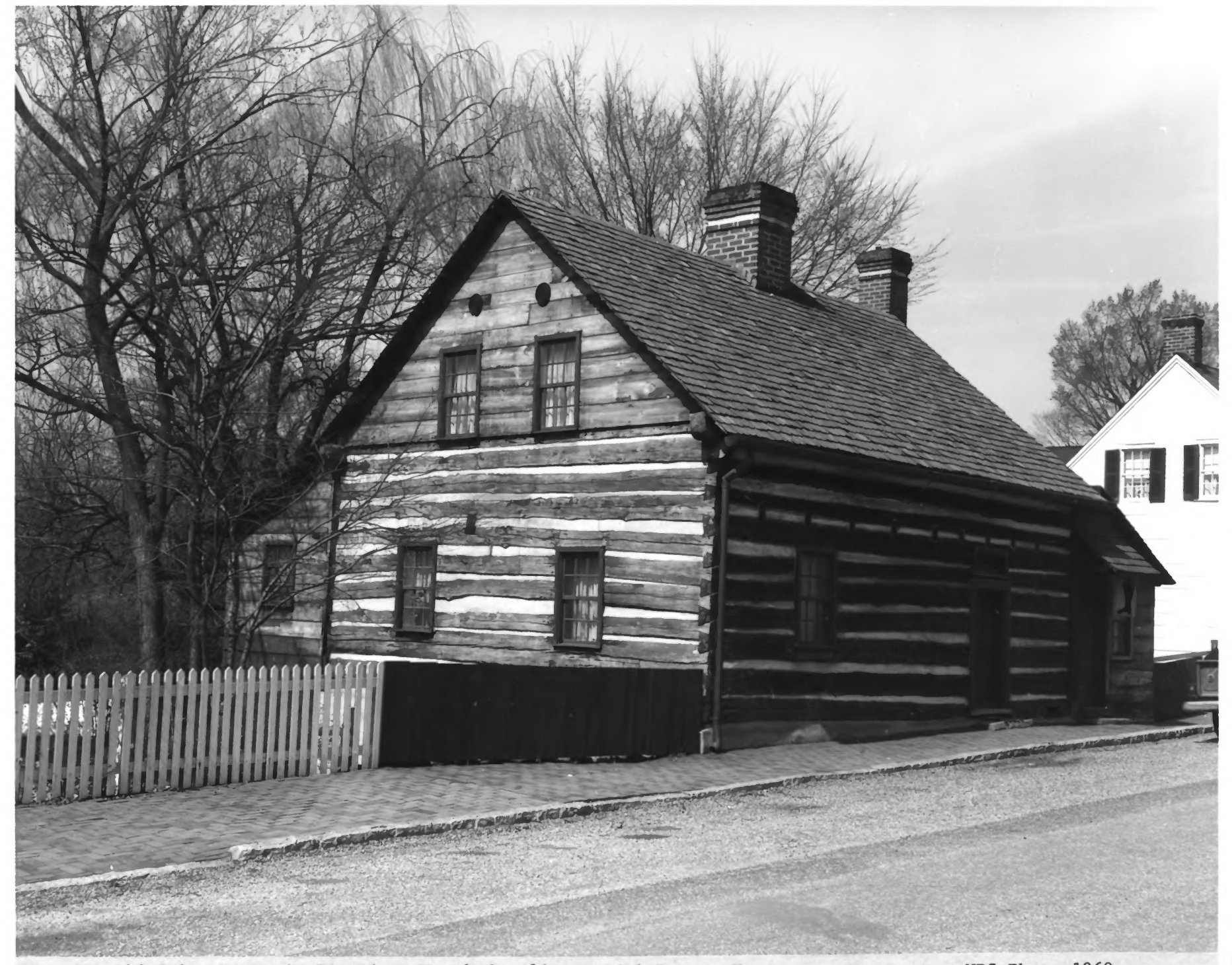
Old Salem Historic District, North Carolina, - Lick-Bonner House