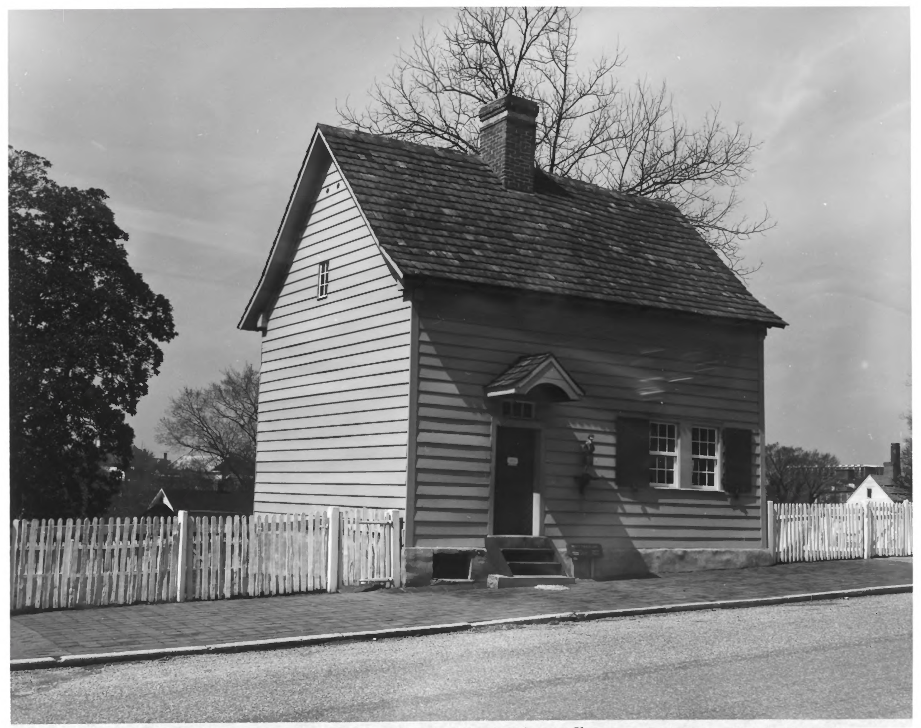
Old Salem Historic District, North Carolina - Miksch Tobacco Shop