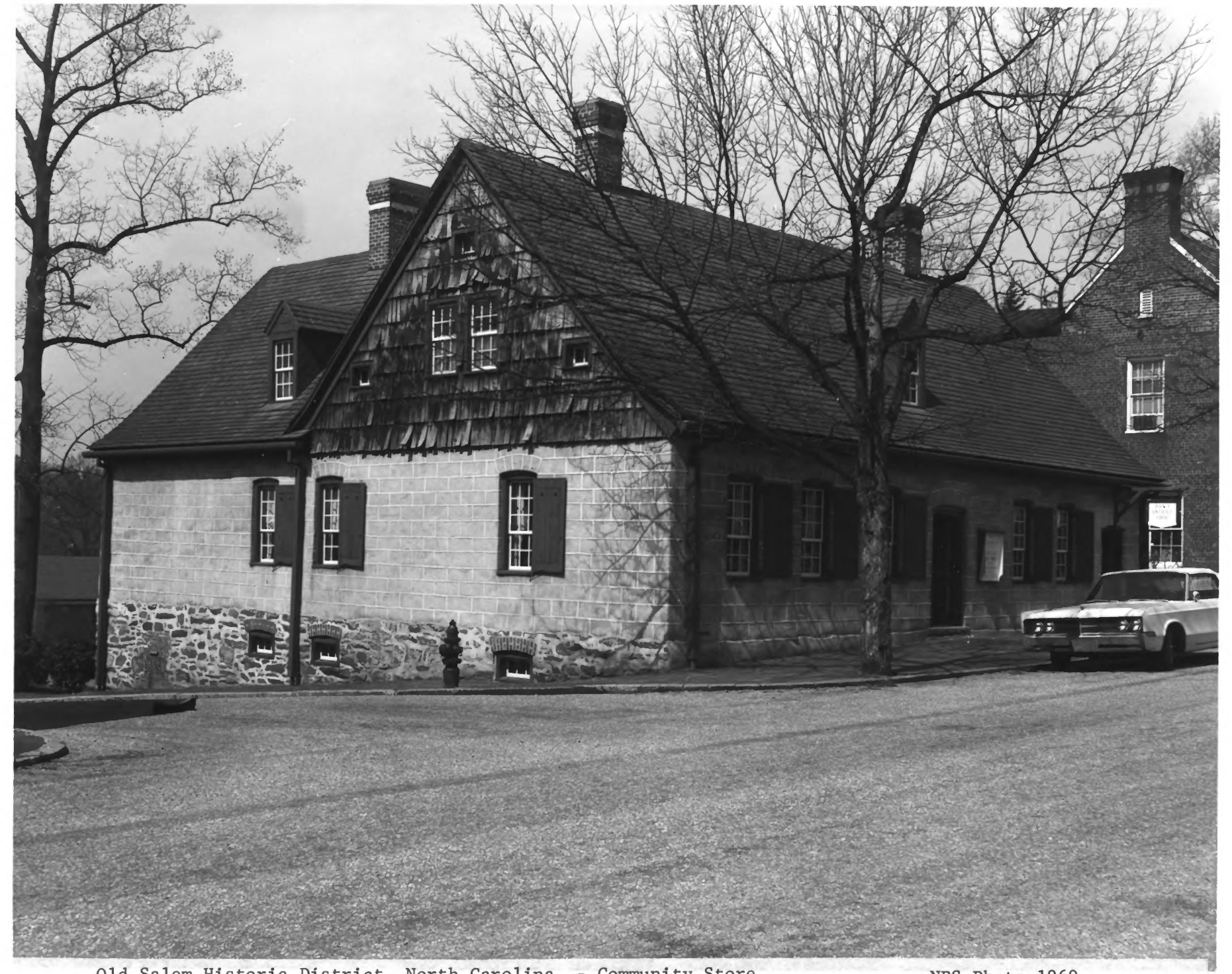
Old Salem Historic District, North Carolina, - Community Store