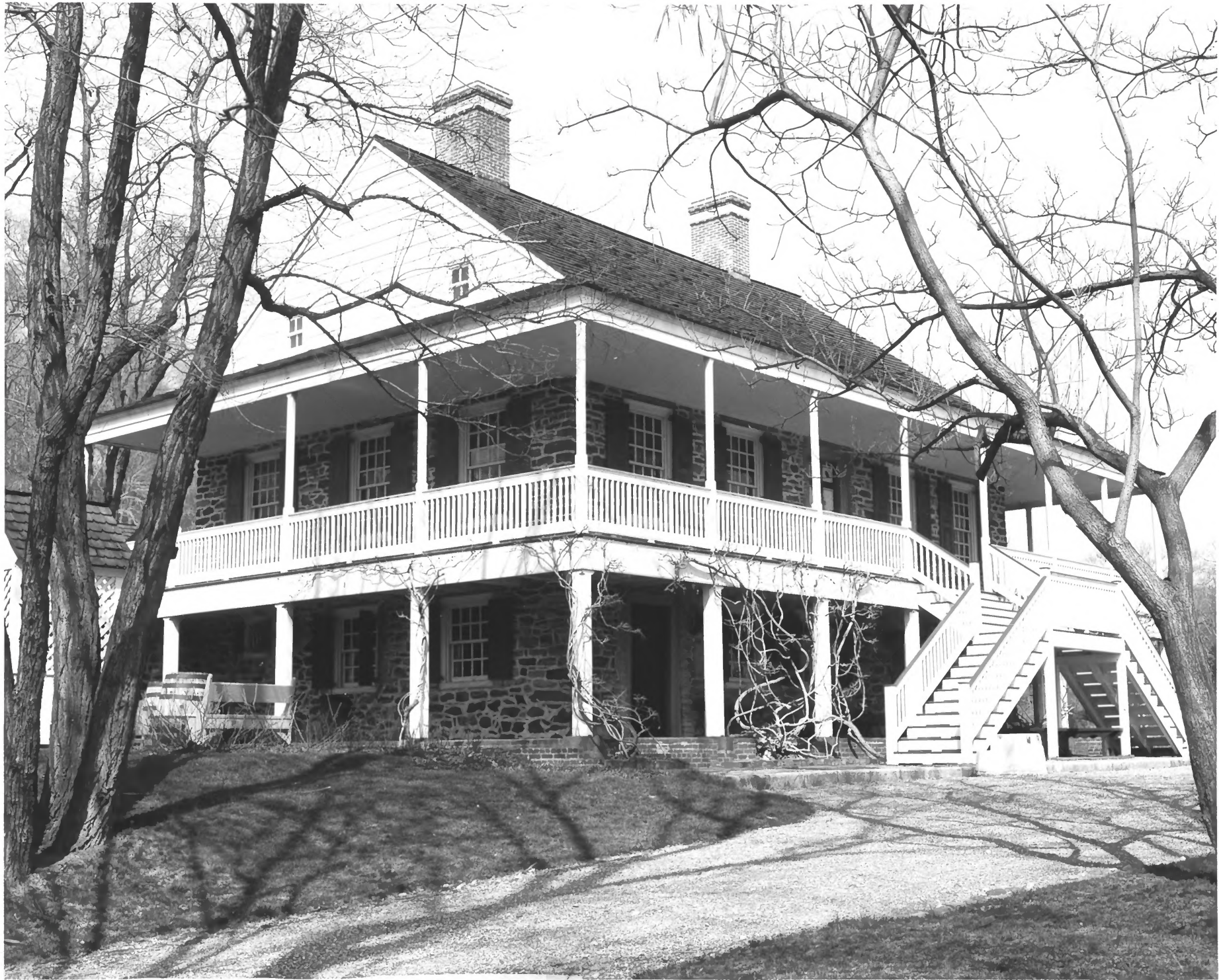
Van Cortlandt Manor House, Croton-on Hudson, New York