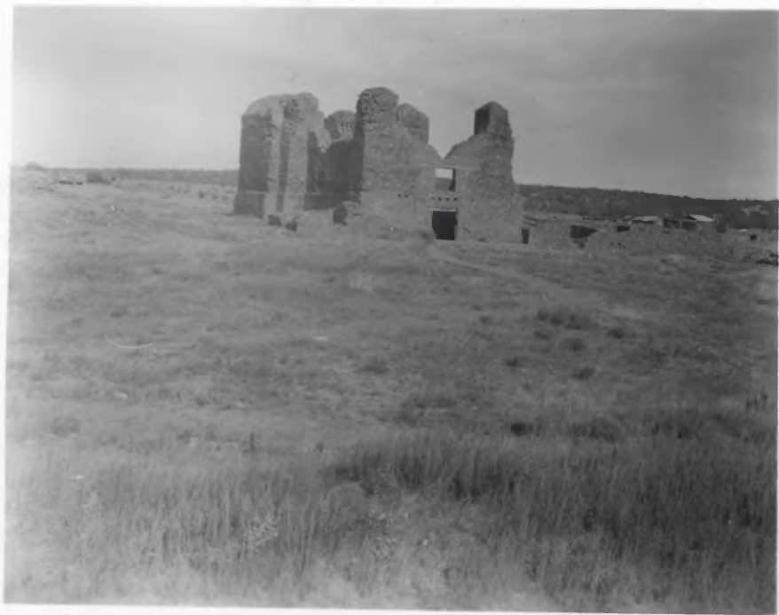
La Purisima Concepcion de Quarai Mission, Quarai State Monument, New Mexico. Interior of church. November 12, 1955.