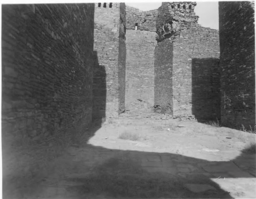
La Purisima Concepcion de Quarai Mission, Quarai State Monument, New Mexico. Looking north, church and convento.