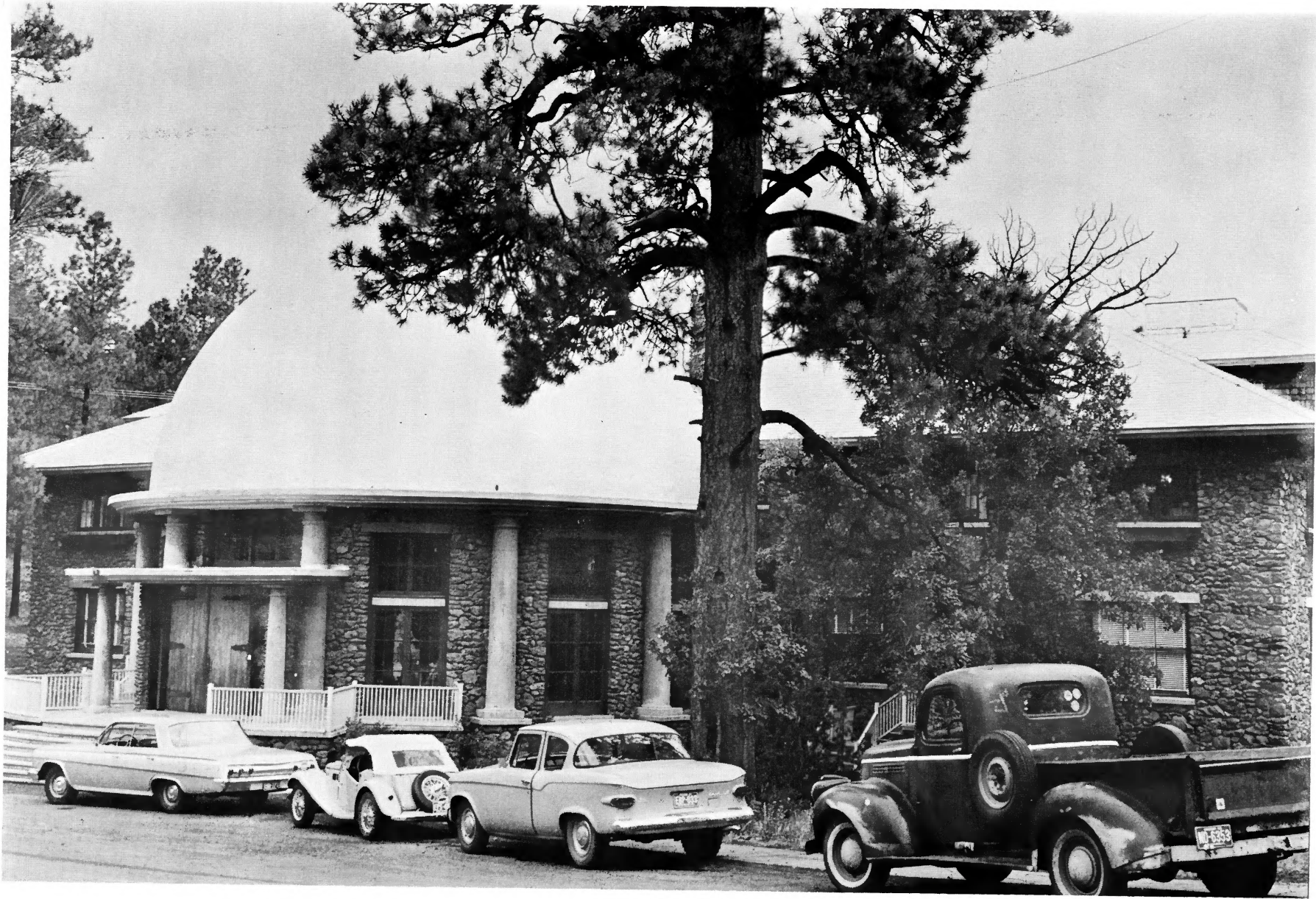
LOWELL OBSERVATORY: Present administration and laboratory building (1914). NPS Photo, 9/64.