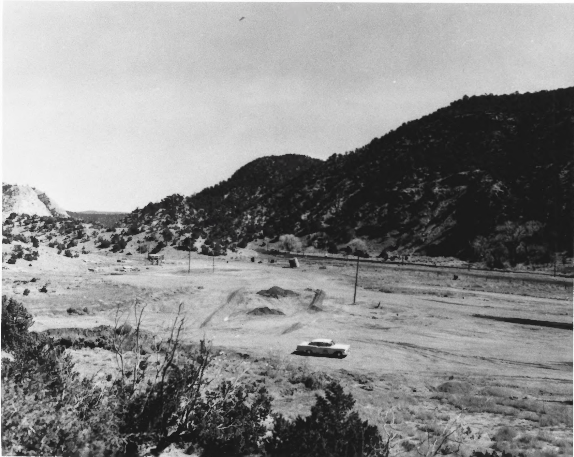
Crop out car