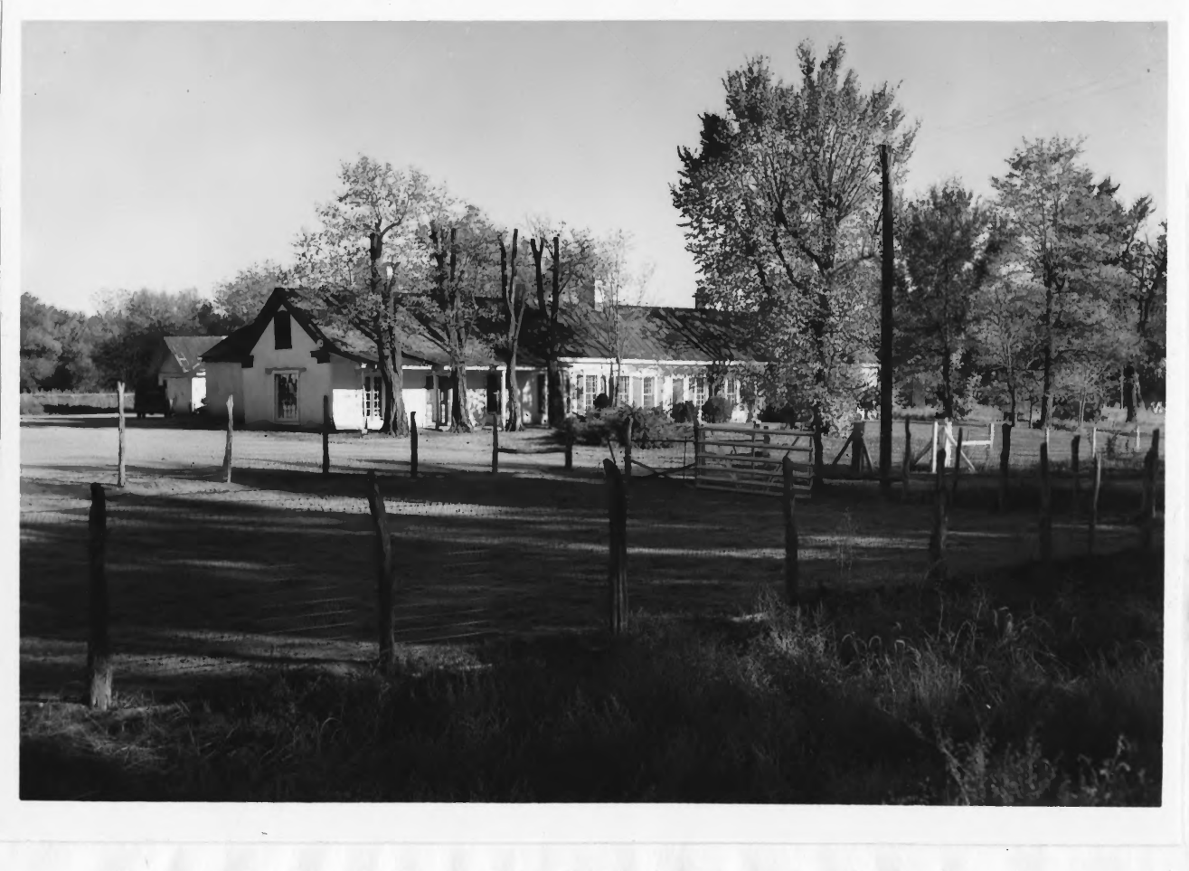
Watrous Ranch and Store at La Junta (Watrous, New Mexico).