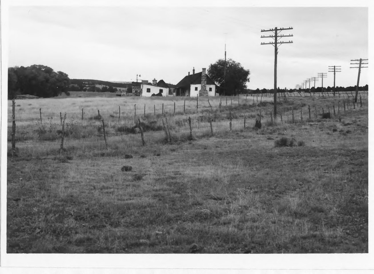
Sapello Stage Station from northeast, at original junction of Mountain and Cimarron Branches. (NPS photo by W. Brown, Oct. 1962; negative in Southwest Regional Office).