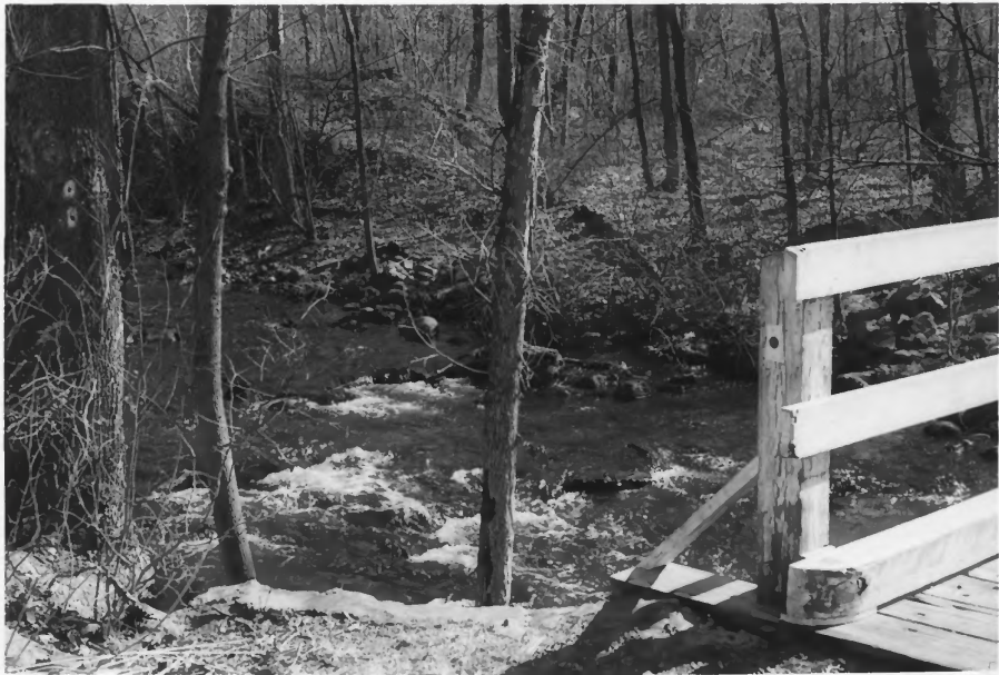
SWIFT FLOWING WANAQUE RIVER RUNS THRU TRACT