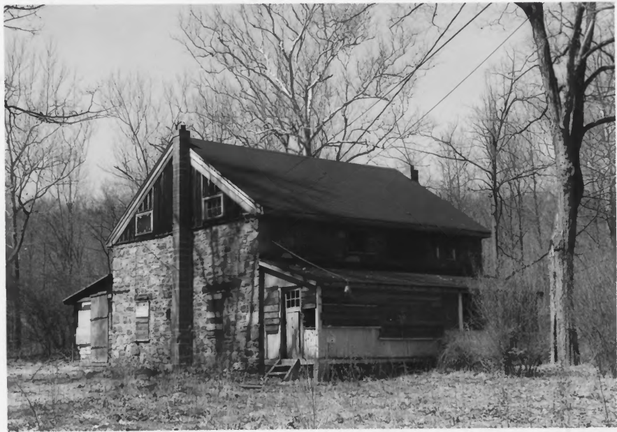
19TH CENTURY STONE MULTI-FAMILY HOUSE