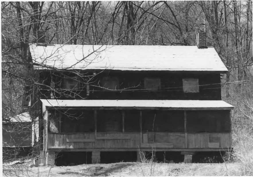
19TH CENTURY WORKERS' HOUSE