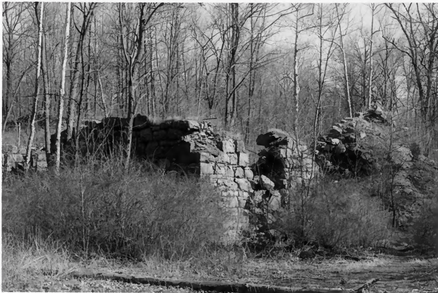
FURNACE # 2 ↑

(V.I.R.)- PHOTOS COPIED FROM "VANISHING IRON WORKS of THE RAMAPOs"