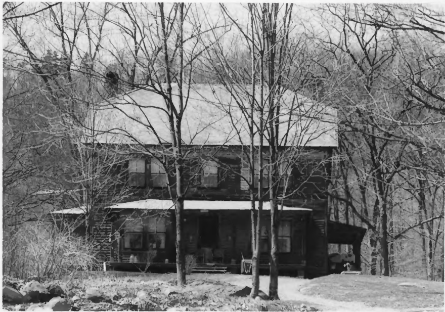
19 TH CENTURY IRONMASTERS HOUSE