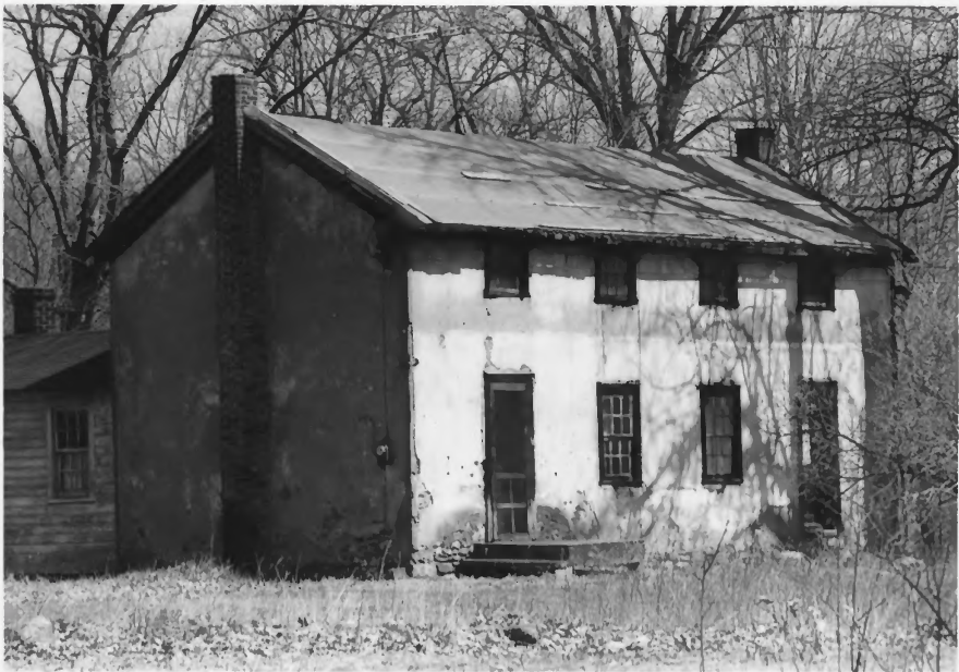
18 TH CENTURY STONE WORKERS' HOUSE