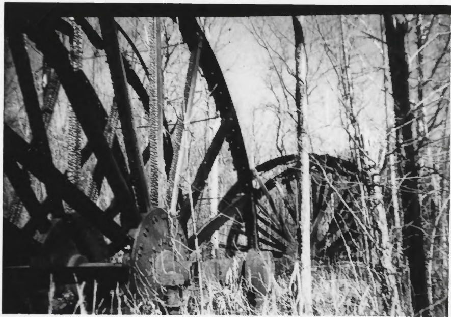
WATERWHEELS AFTER 1957 FIRE ↑