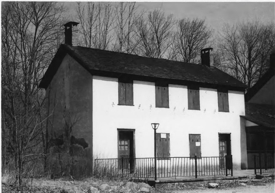
18 TH CENTURY STONE STORE #1