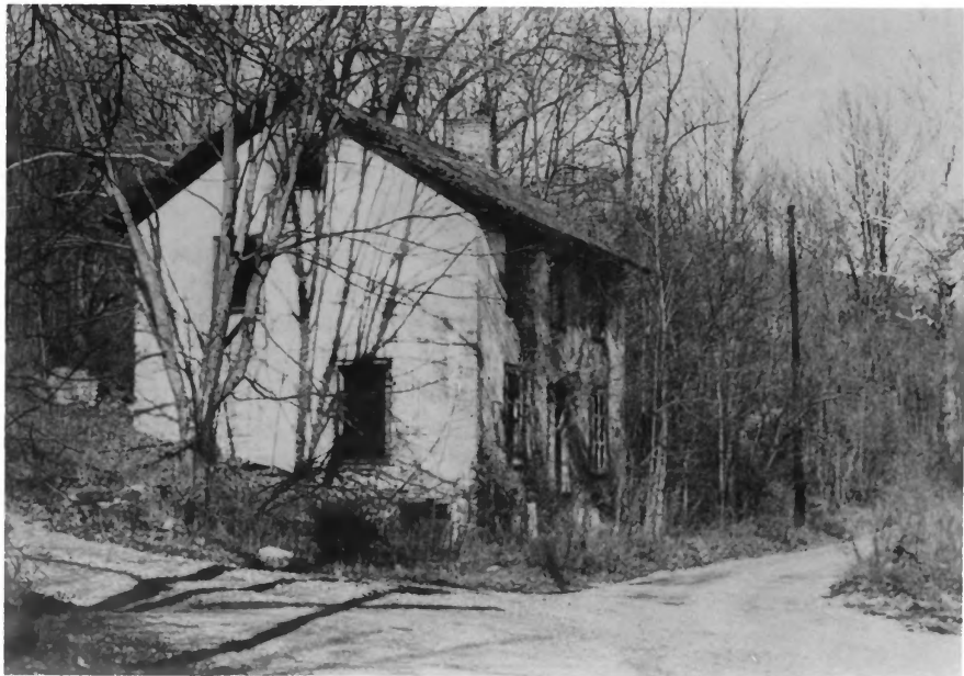
OFFICE & STORE #2 IN 1957 (V.I.R.)