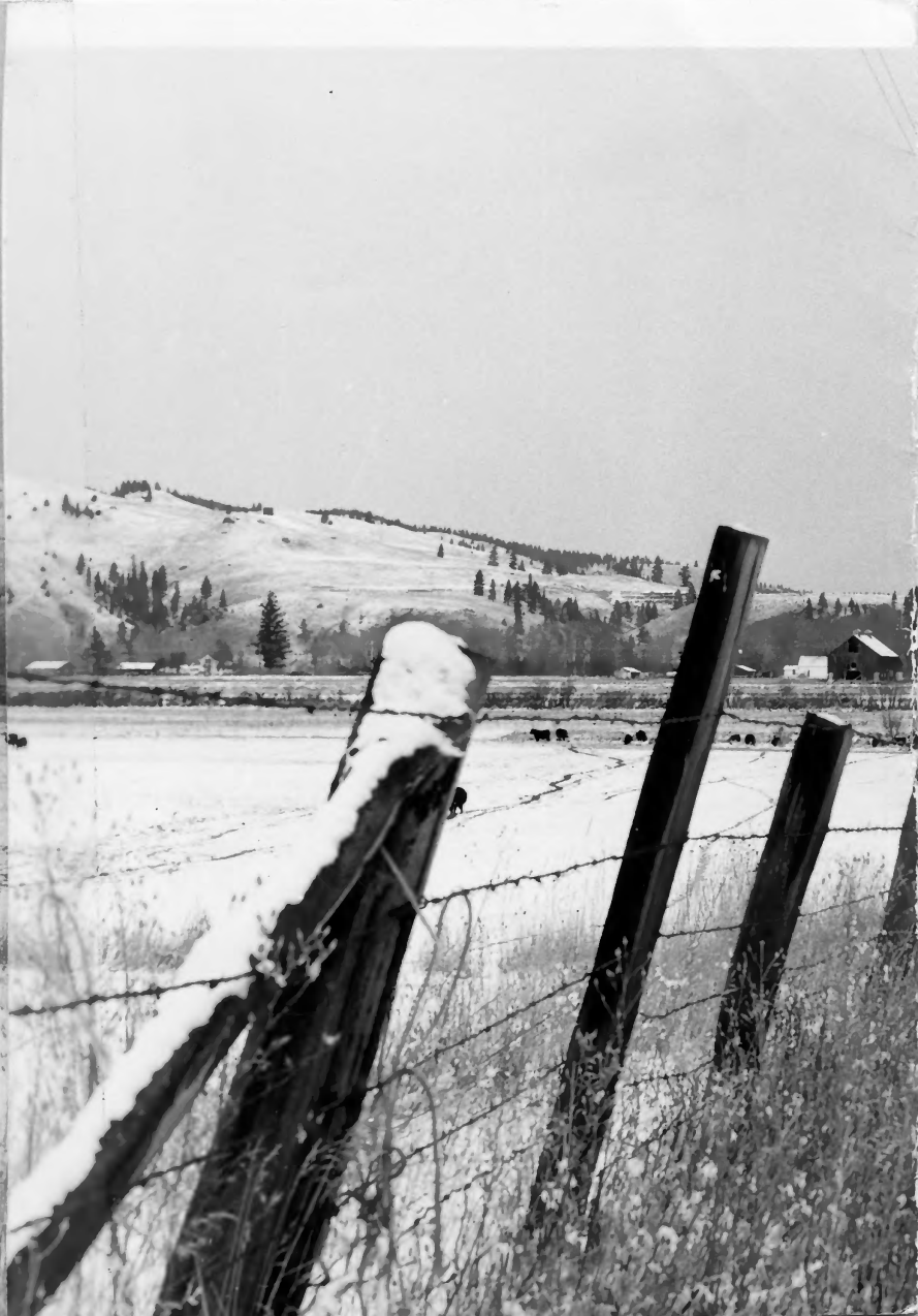
General area of Travellers Rest confluence of Bitterroot River & Lolo Creek is in timber at right- center of the photo. (Nov. 1971)