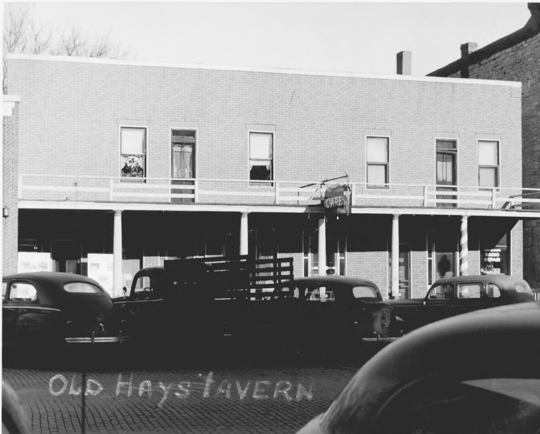
OLD HAYS TAVERN