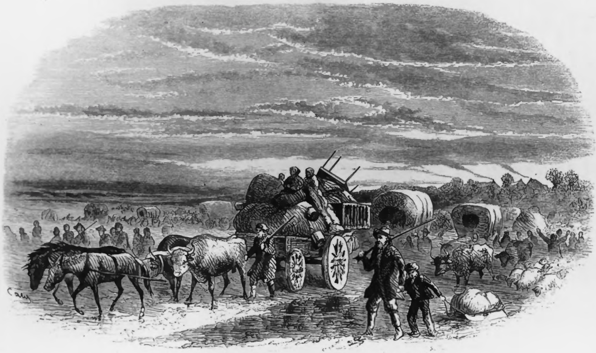
THE EXODUS FROM NAUVOO.