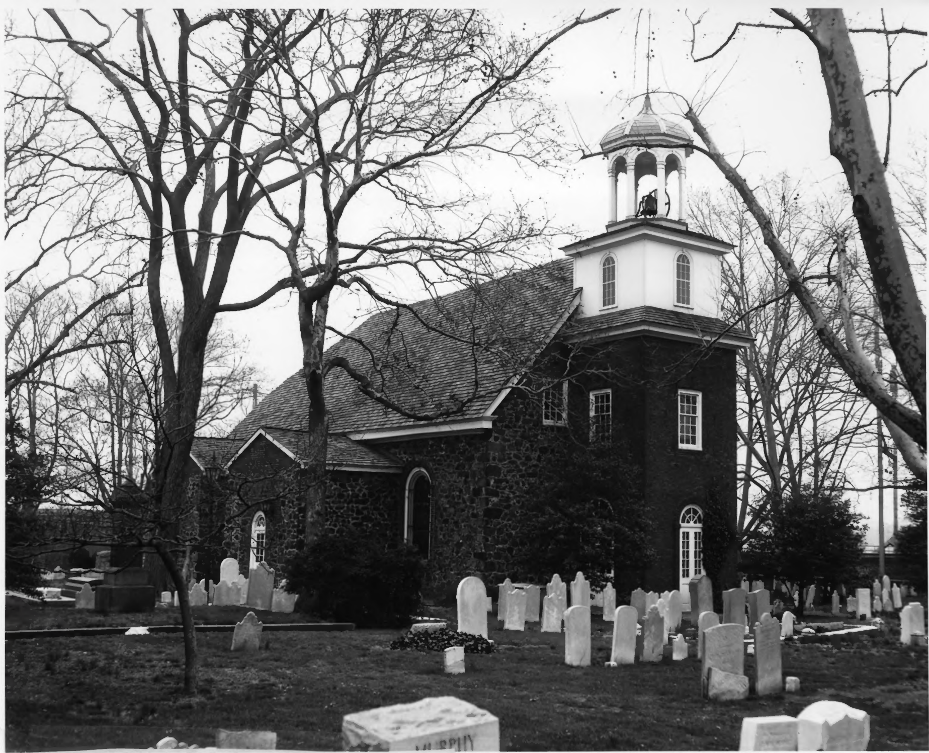
Holy Trinity (Old Swedes) Church, Wilmington, Delaware 25