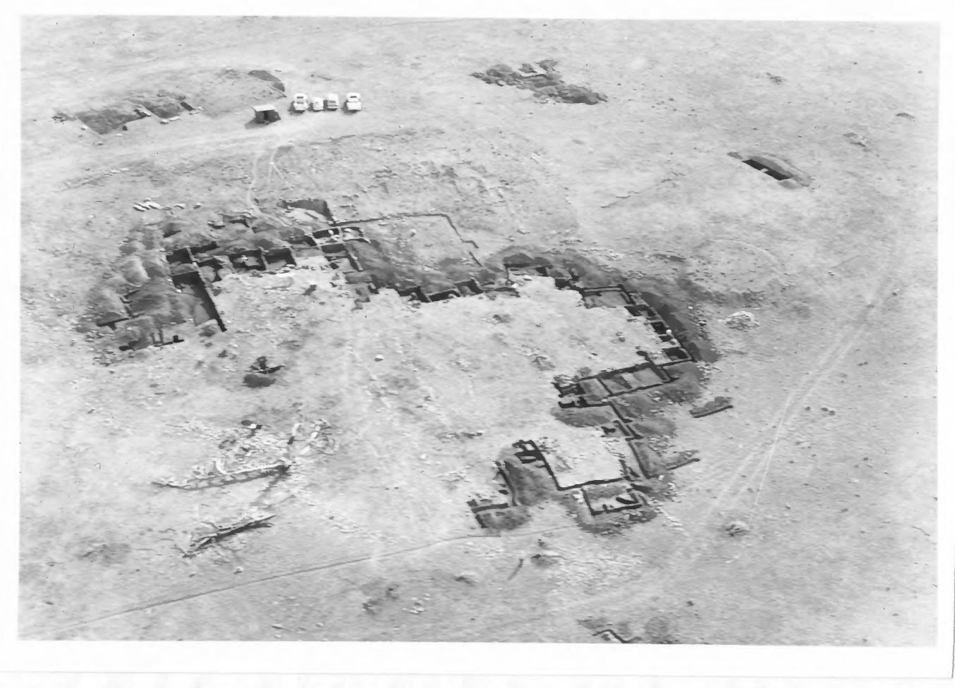
Aerial view of Turkey Creek Village in process of excavation.