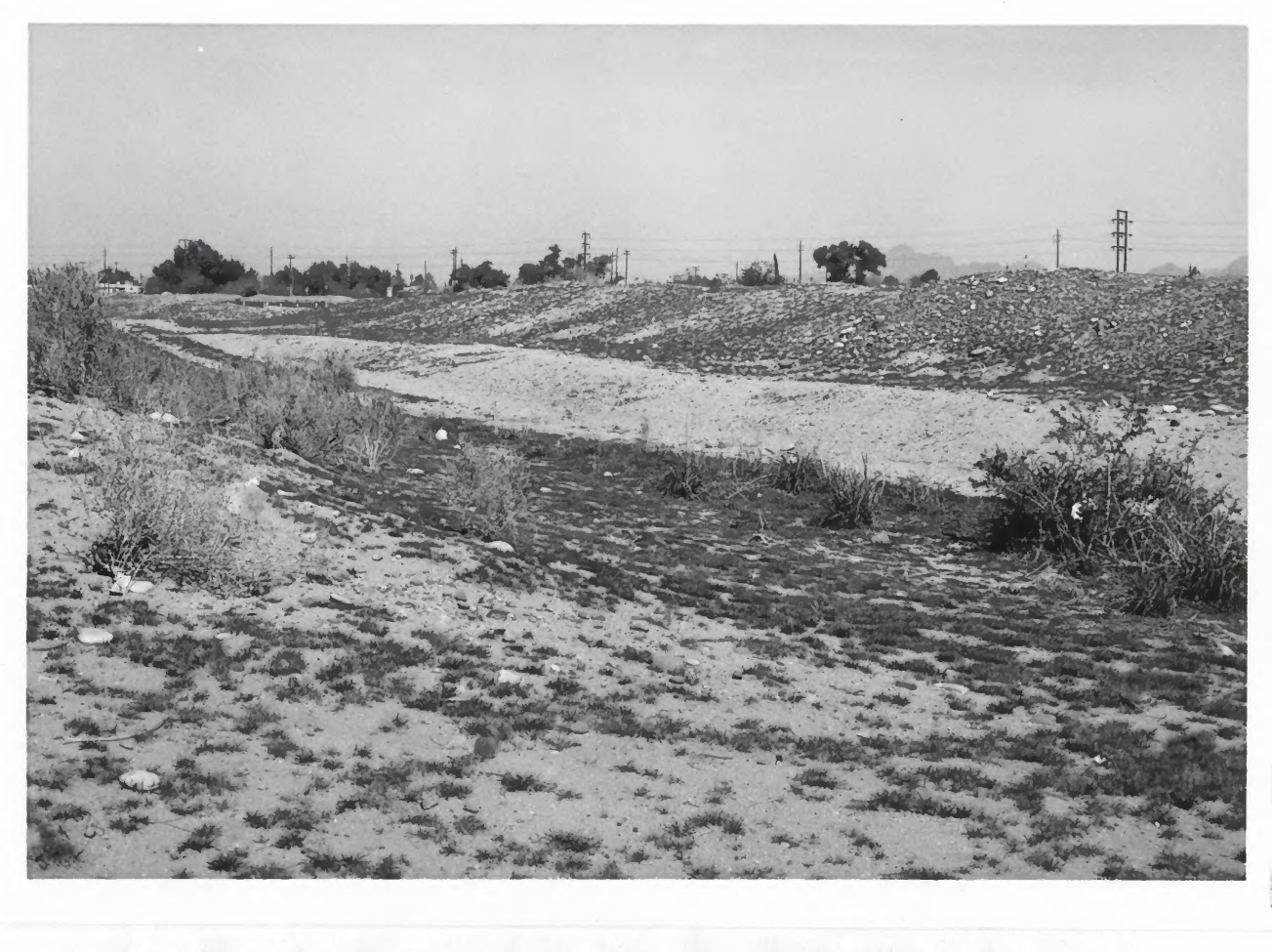
Canal remains in Park of the Four Waters.