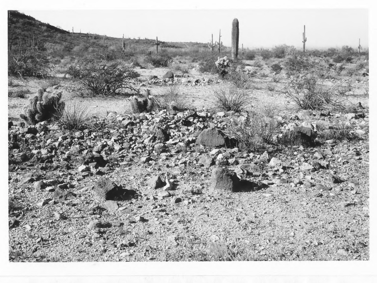
Rock walls of garden terraces north of Sacaton. (NPS photo; negative in Southwestern Regional Office).