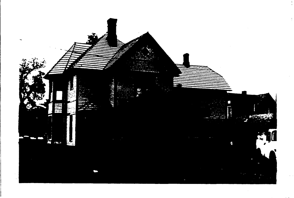
Allison-Reinkeh House, east elevation, 1987 photograph.