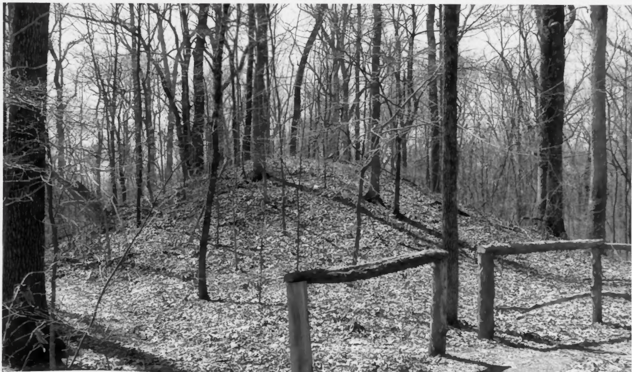
Figure 13. Restored Mound C, Late Woodland Burial Mound, within the Shiloh Indian Mounds Site. Investigated in 1899, and 1933-34. Photograph taken February 1988.