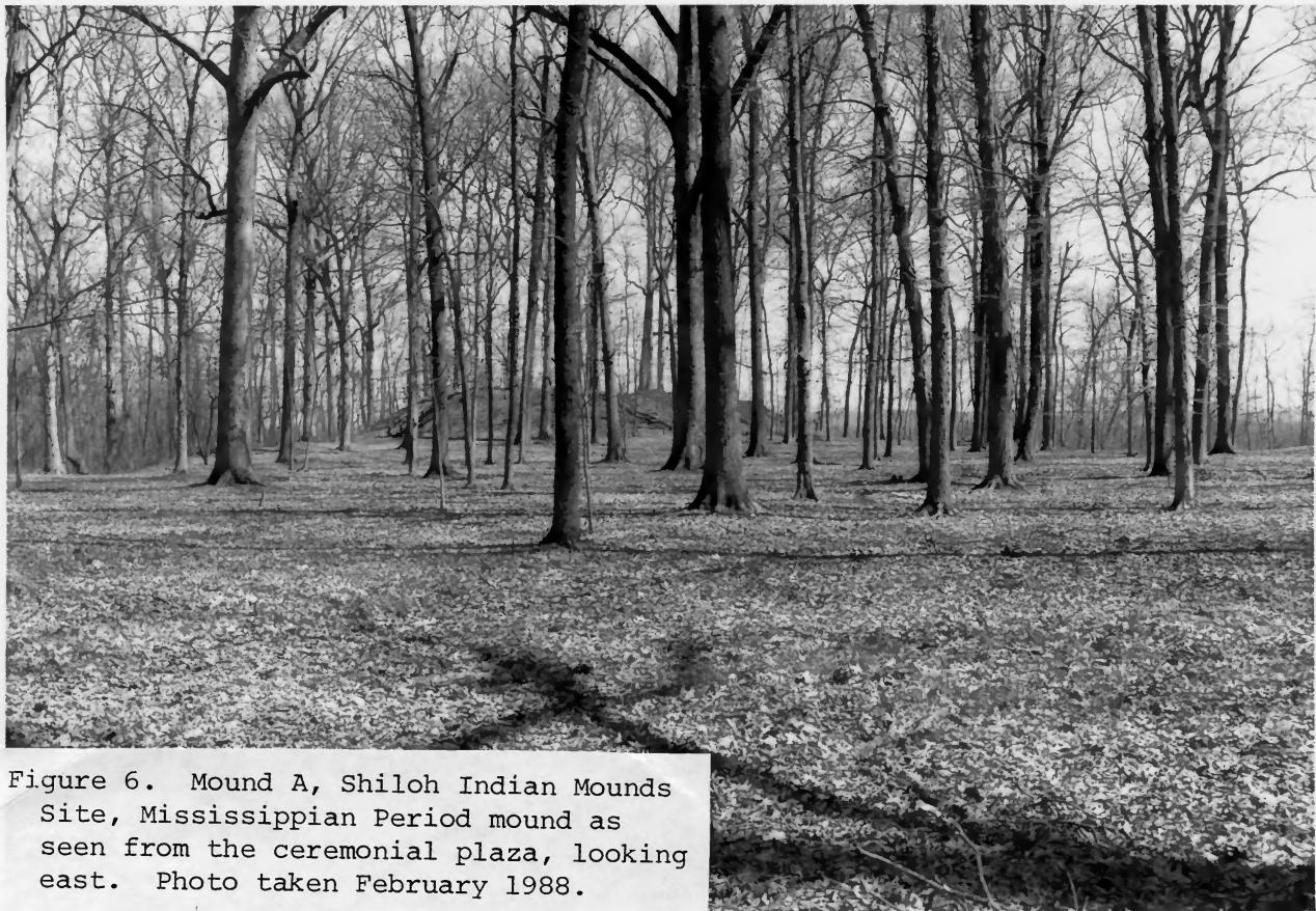
Figure 6. Mound A, Shiloh Indian Mounds Site, Mississippian Period mound as seen from the ceremonial plaza, looking east. Photo taken February 1988.