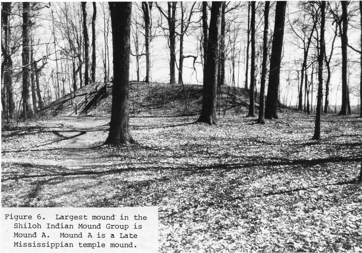
Figure 6. Largest mound in the Shiloh Indian Mound Group is Mound A. Mound A is a Late Mississippian temple mound.