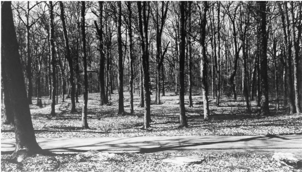
Figure 7. Mound G is in the center background. Small house mound is in the left foreground.