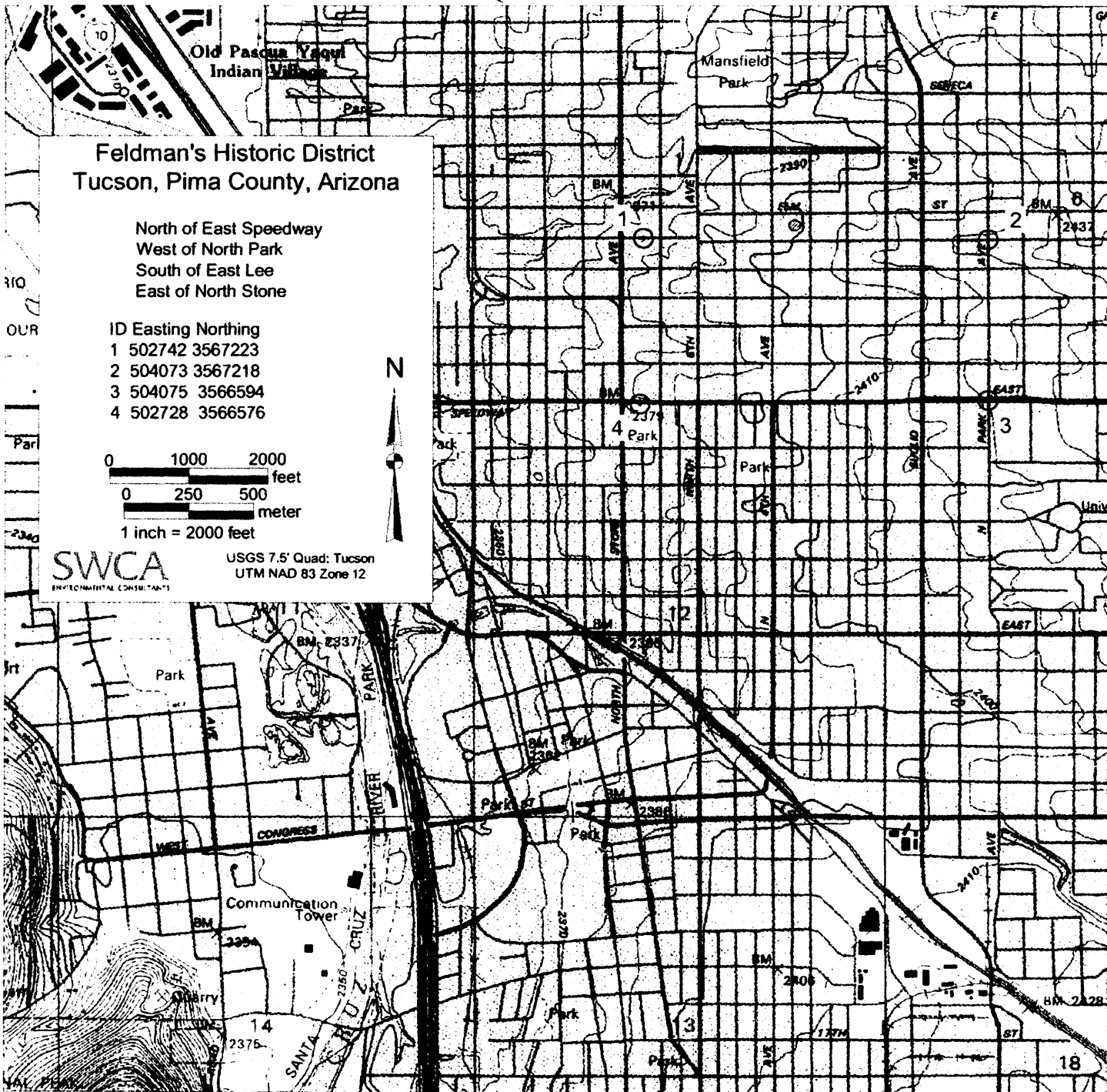
MAP 1: LOCATION MAP. FOUR POINTS ARE AT "SQUARED" CORNERS OF ACTUAL DISTRICT BOUNDARIES.

Feldman's Historic District Pima County, Arizona