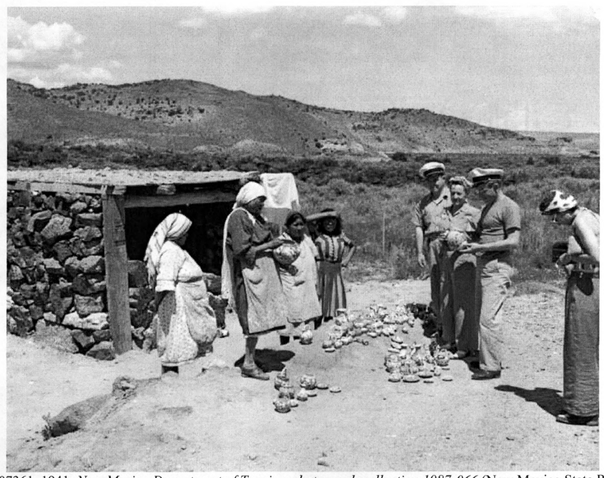
Item 007361, 1941, New Mexico Department of Tourism photograph collection 1987-066 (New Mexico State Records Center and Archives, Santa Fe, New Mexico).

Figure 1: Acoma Indian Roadside Pottery Business, 1941