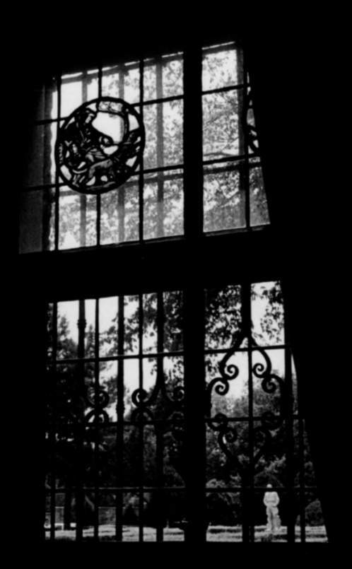
E. W. MARLAND MANSION