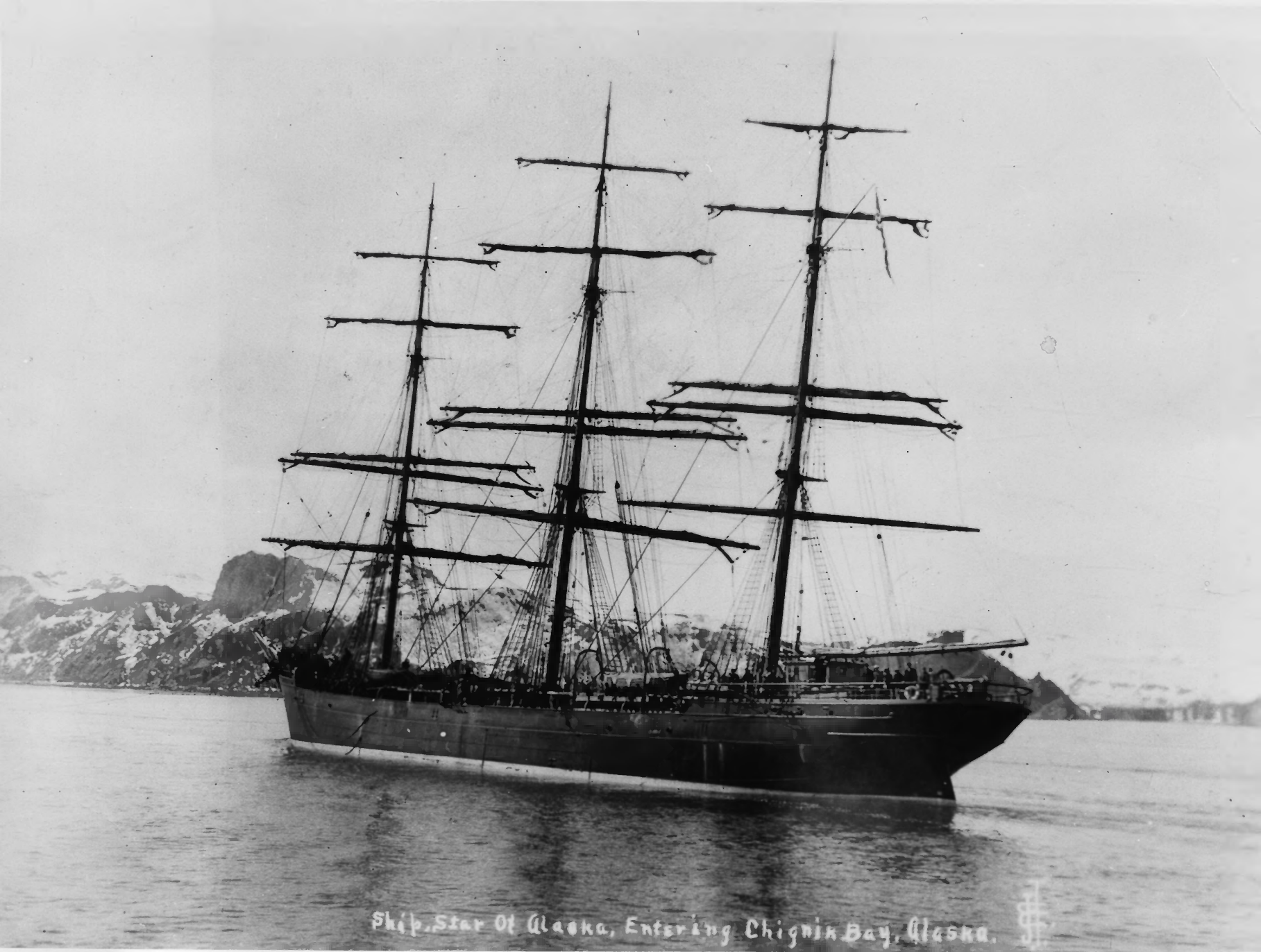
Ship, Star of Alaska, Entering Chignik Bay, Alaska.

Balclutha, as Star of Alaska, date unknown