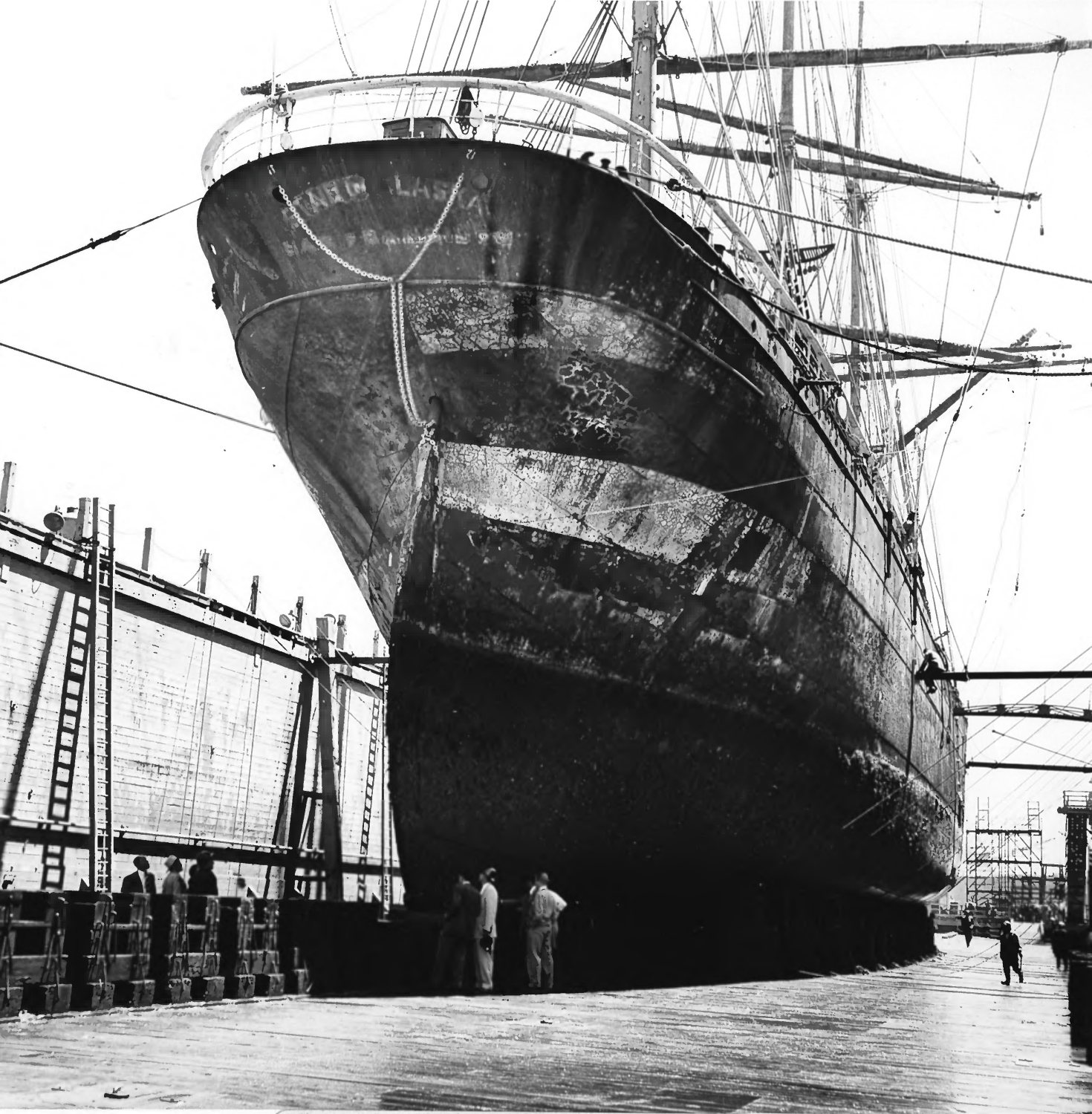
Balclutha as Pacific Queen , in drydock during restoration, 1954-55 San Francisco Bay area, California National Maritime Museum, San Francisco, photograph B4.35,640n