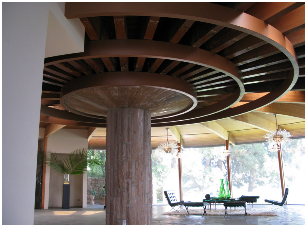
Detail of roof in living room

Paperwork Reduction Act Statement: This information is being collected for applications to the National Register of Historic Places to nominate properties for listing or determine eligibility for listing, to list properties, and to amend existing listings. Response to this request is required to obtain a benefit in accordance with the National Historic Preservation Act, as amended (16 U.S.C.460 et seq.).