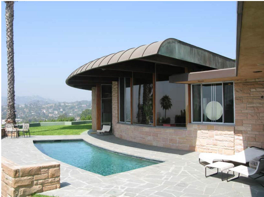
View of pool and south façade, facing northwest.