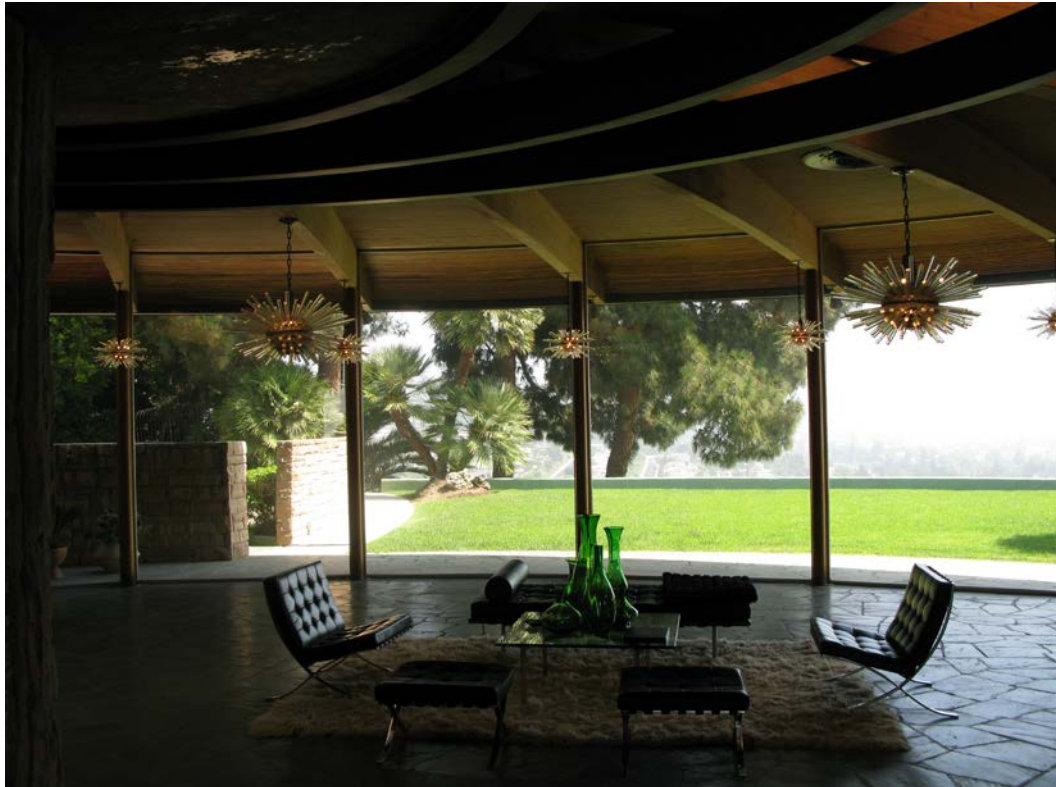
Detail of living room, roof structure and window system